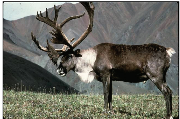
The Forty-Mile and Porcupine caribou herds range within the preserve.