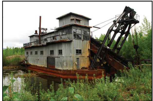
Coal Creek Dredge