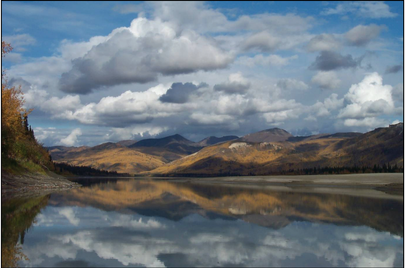
The Yukon River continues to draw visitors enjoying “The Spell of the Yukon”.

Appendix A includes selected excerpts from ANILCA that are most relevant for the day to day management of Yukon-Charley Rivers National Preserve.