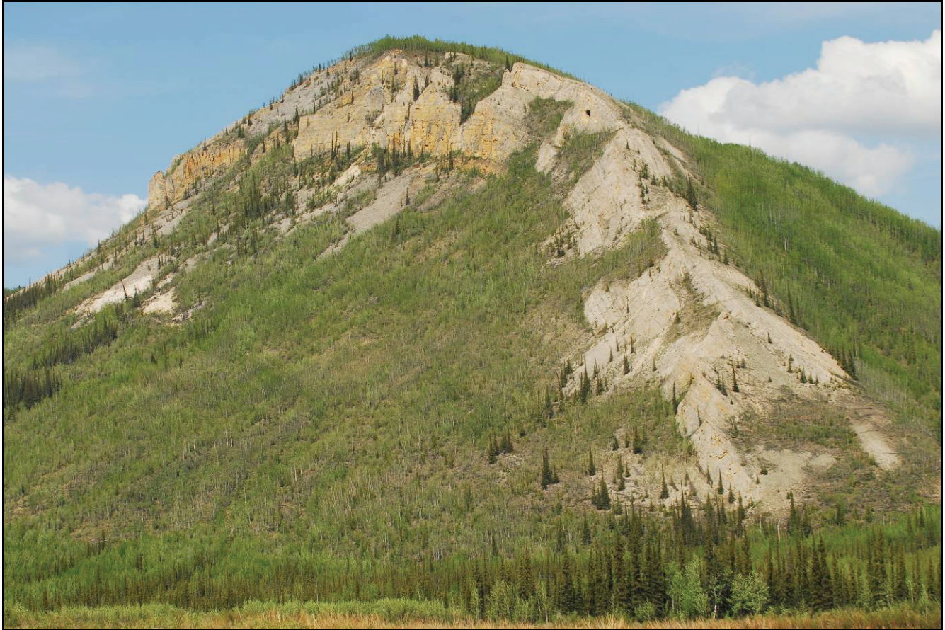
The Nation River Tahkandik Limestone bluff rises from the Yukon River.

Appendix B includes legislation that, while superseded by ANILCA, offers contextual background information regarding the establishment of Yukon-Charley Rivers National Preserve.