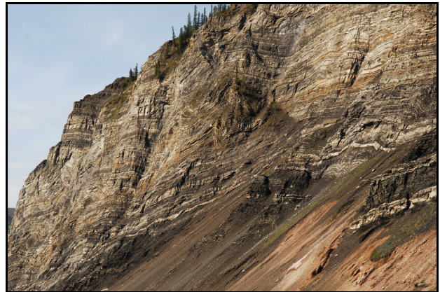
Calico Bluff is an example of the tremendous force and power exhibited by activity of the Tintina Fault.