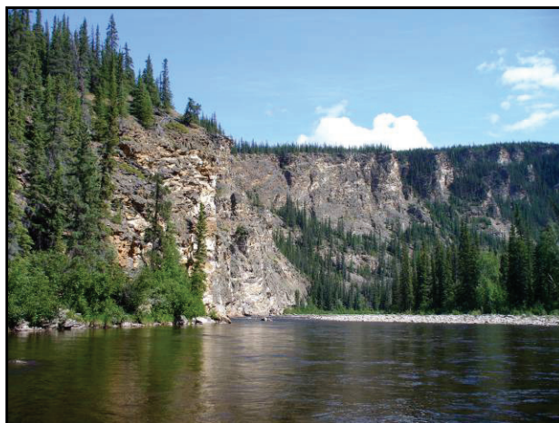
The Charley River with many bluffs affords the opportunity to view the once-endangered American Peregrine Falcon.

Visitors are attracted to the remote and challenging floating conditions the Charley River offers, as well as opportunities for float hunting, fishing, and other recreational pursuits such as wildlife viewing.