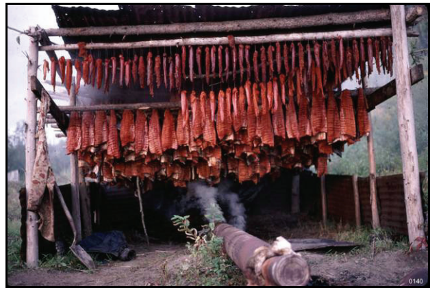
Salmon drying on fish rack.