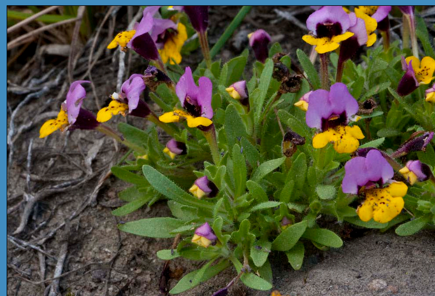
Velvet grass in Big Meadow towers over the rare yellow-lip pansy monkeyflower ( Mimulus pulchellus ). The pansy monkey flower is a Yosemite National Park special status species. It is also listed by the California Native Plant Society as category 1B.2: “plants rare, threatened or endangered in California with a moderate immediacy of threat.” It is endemic to California State, found only in three Sierra Nevada counties (Calaveras, Mariposa, Tuolumne).