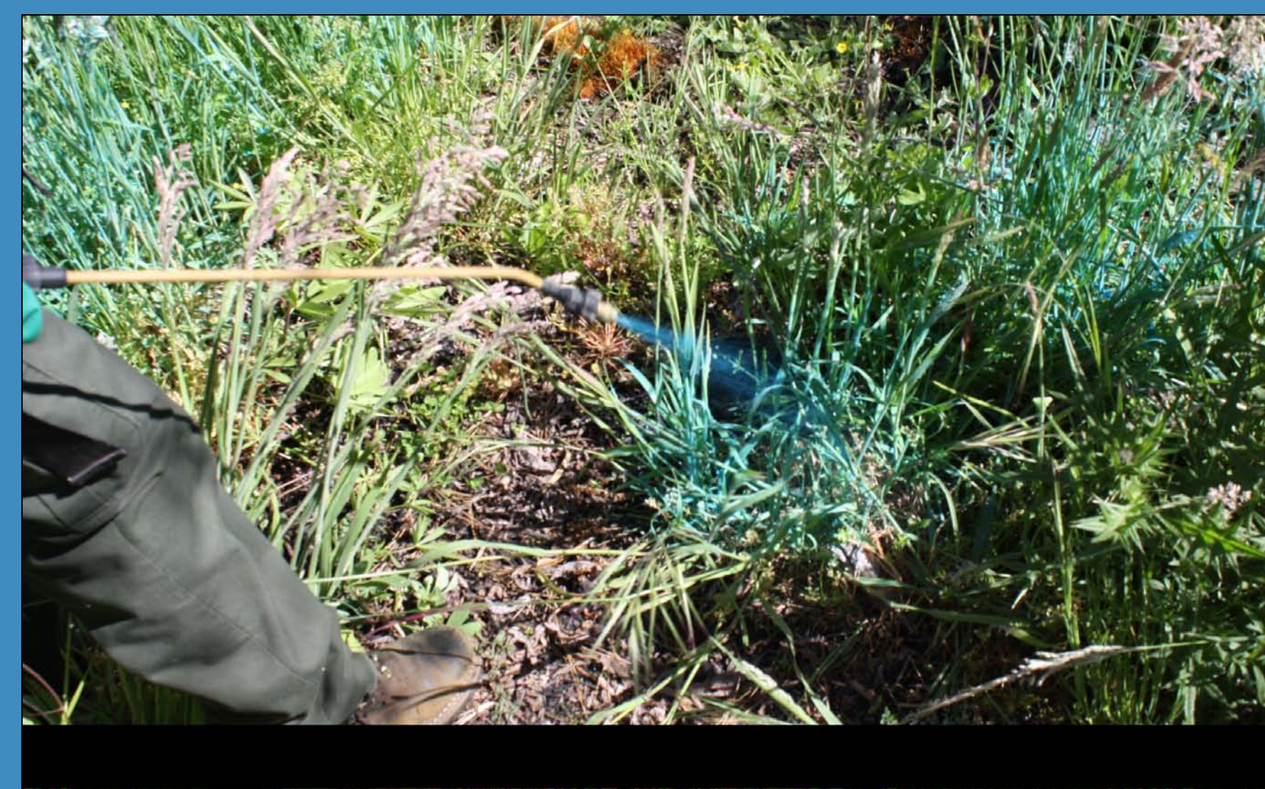
Daniel Bracken spot-sprays velvet grass with a 2% glyphosate solution. Blue indicator dye helps show where the herbicide has been applied.

A solution of only 0.5% Agridex surfactant applied to velvet grass shows that this standard concentration is far too low. Because the foliage is covered with velvety hairs, a 2% surfactant solution is needed.