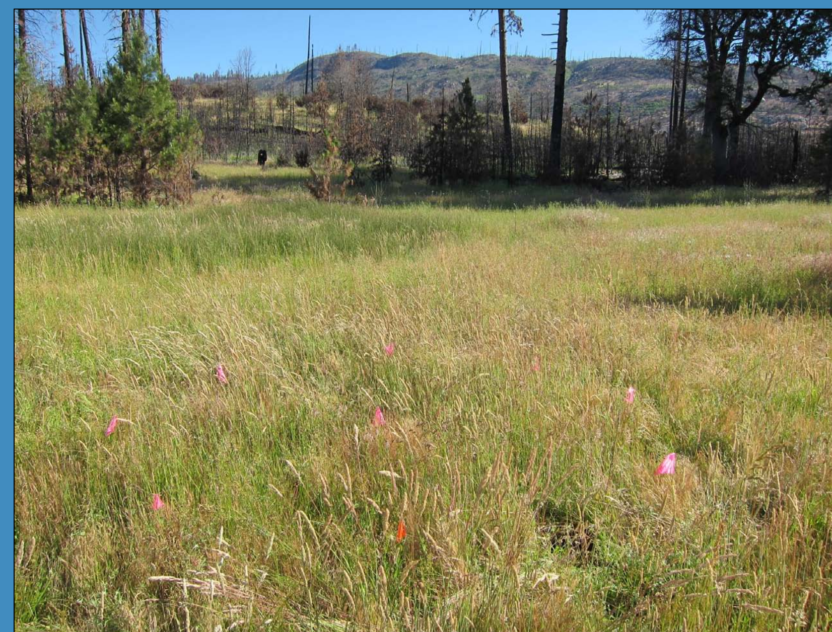
Documented distribution of common velvet grass in the park (left). A study plot placed in Big Meadow (right). Velvet grass has occupied a large portion of this and other meadows in Yosemite.