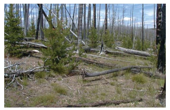
Some soils respond quickly after fires, but other soil types may continue to support less vegetation.

Although Engelmann spruce and subalpine fir have thin bark, they grow in cool, moist habitats where conditions that enable fires to burn are infrequent. In 1988, 28% of the park's whitebark pine burned, though it grows in open, cold, high-altitude habitats that accumulate fuel very slowly and have only a short season between snowmelt and snowfall during which fires can ignite and carry. Caches of whitebark pine seeds collected by red squirrels and Clark's nutcrackers and the hardiness of whitebark pine seedlings on exposed sites give this tree an initial advantage in burned areas over conifers dependent on wind to disperse seeds. However, this slow-growing and long-lived tree is typically more than 60 years old before reaching full cone production, and young trees may die before reproducing if the interval between fires is too short or if faster-growing conifers outcompete them.