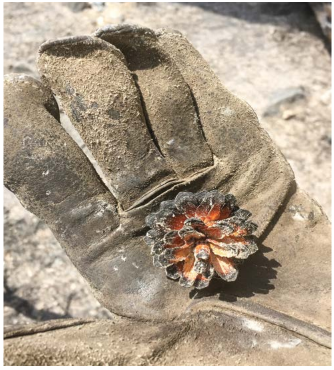
Trees in Greater Yellowstone are adapted to fire. This serotinous cone from a lodgepole pine tree was opened by fire, allowing it to release its seeds.

The thick bark on mature Douglas-fir trees resists damage from surface fires. Historically, in areas like the park's northern range, frequent surface fire kept most young trees from becoming part of the overstory. The widely scattered, large, fire-scarred trees in some of the dense Douglas-fir stands in the northern range are probably remnants of these communities.