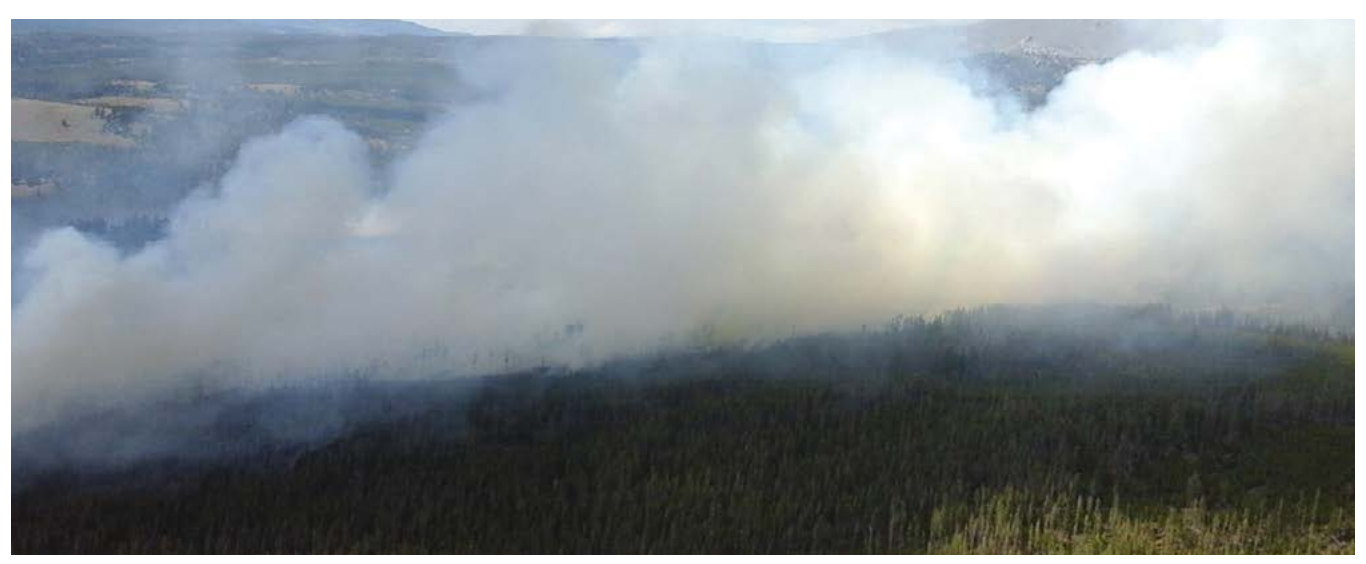
Greater Yellowstone is a fire-adapted ecosystem. Smoke may be visible from ongoing fires during the fire season, typically July through September.