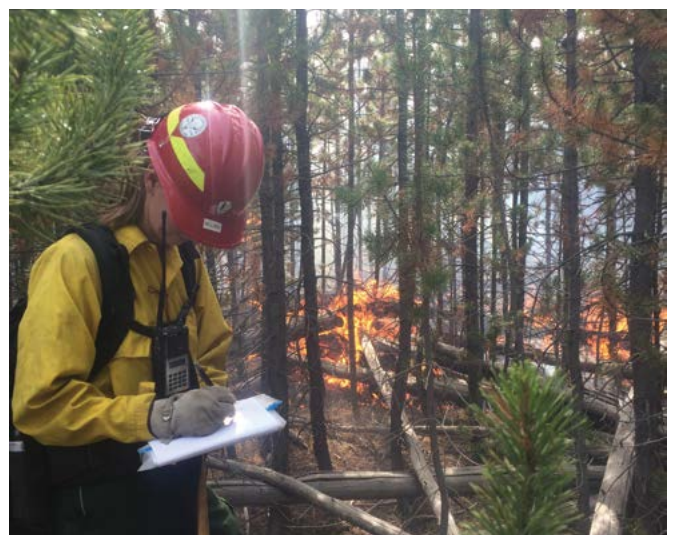
Monitoring fire behavior and weather on the Maple Fire, 2016.

By the 1940s, ecologists recognized fire was a natural and unavoidable change agent in many ecosystems, including relatively arid portions of the Rocky Mountains. In the 1950s and 1960s, other parks and