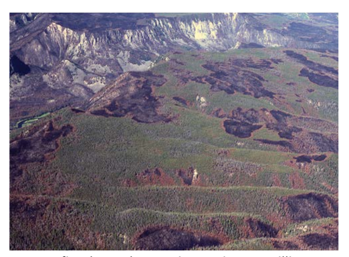
In 1988, fires burned a mosaic covering 1.4 million acres in the Greater Yellowstone Ecosystem as a result of extremely warm, dry, and windy weather.

Some of the vegetation in the Greater Yellowstone Ecosystem has adapted to fire and, in certain cases, is dependent on it. Some plant communities depend on the removal of the forest canopy to become established. They are the first to inhabit sites after a fire. Other plants growing on the forest floor are adapted to survive at a subsistence level for long periods of time until fires open the canopy. Fire creates a landscape more diverse in forest age, which reduces the probability of disease or fire spreading through large areas.