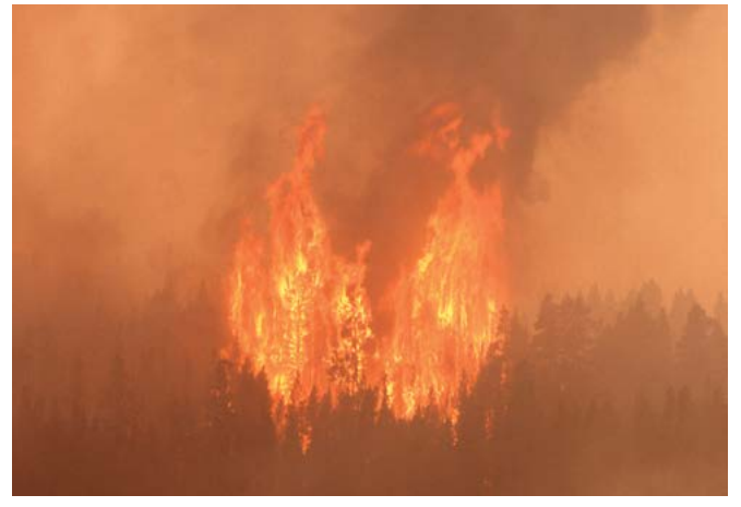
Some fires burn with higher intensity and rapid rates of spread. These large, fast-moving fires send plumes of smoke thousands of feet into the air and receive much of the public's attention. These large fires (>100 acres) only occur 8% of the time in the park.

Ongoing research in Yellowstone is also showing that forests experiencing stand-replacing fires can affect fire behavior for up to 200 years. When a fire