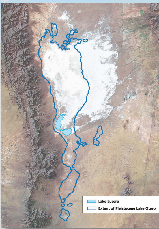
Lake Otero once covered much of the Tularosa Basin. When it dried, gypsum deposits were left behind on the basin floor.

Two to three million years ago the ancient Rio Grande flowed along the southern edge of the Tularosa Basin. Sand deposits from the river blocked-off the southern edge of the basin, preventing snowmelt and rainfall from flowing out of it. This allowed for the formation of the 1,600 square-mile Lake Otero.