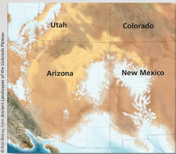
Extent of the Permian Sea about 250 million years ago

Over millions of years, sea levels rose and fell many times. In times of evaporation, concentrations of calcium and sulfate in the water increased enough to combine and form the mineral gypsum ( \text{CaSO}_4 \cdot 2\text{H}_2\text{O} ). Thick layers of gypsum were deposited in sedimentary rocks on the bottom of this sea.