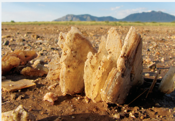
Selenite crystals on the surface of Lake Lucero

Each year some of the crystals emerge from the protective mud surface of Lake Lucero as wind and rain remove sediments from around them. Once exposed, crystals begin the gradual process of erosion into smaller and smaller pieces.