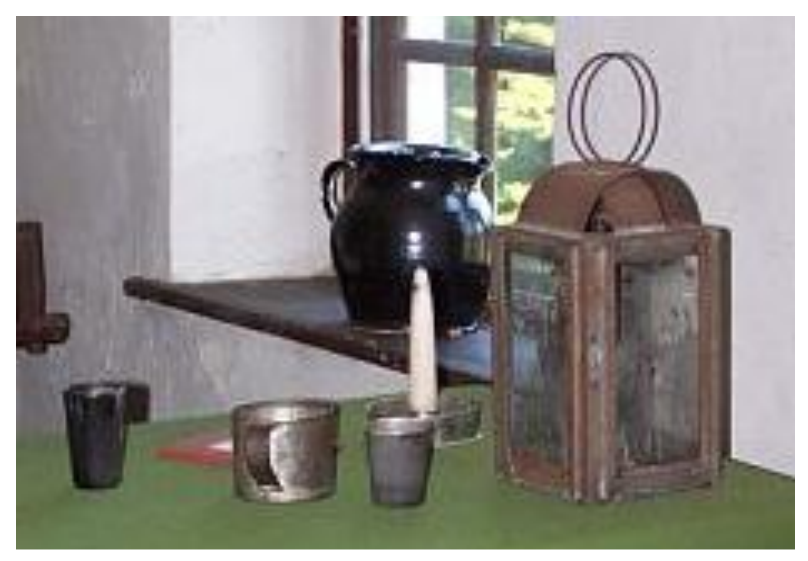
VAFO 3313 Table; VAFO 30154 Horn Cup; VAFO 5743 Candlestand

The garret was used as sleeping quarters for many of the house's inhabitants at various times during the encampment. The free and enslaved servant slept here, but records also show that at times aides-de-camp used this space. There is an account of aide-de-camp, John Laurens, knocking his head on the low ceiling when rising in the morning.