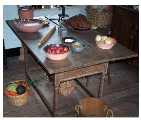
VAFO 3361 Table

The kitchen bustled with activity; baking, roasting, broiling, frying, and stewing were all accomplished here, both over the fire and atop piles of hot coals placed at several locations on the hearth. The most common cookware found in a colonial kitchen was made of iron. Wrought iron frying pans were used to cook items such as Washington's favorite hoe cakes, a cornmeal pancake that was popular for its ability to last on long journeys. Cast-iron pots received frequent use, usually weighing between 20-40 pounds empty; they could hold gallons of soups and stews for Washington's military family and guests. In back of the fireplace, there is a