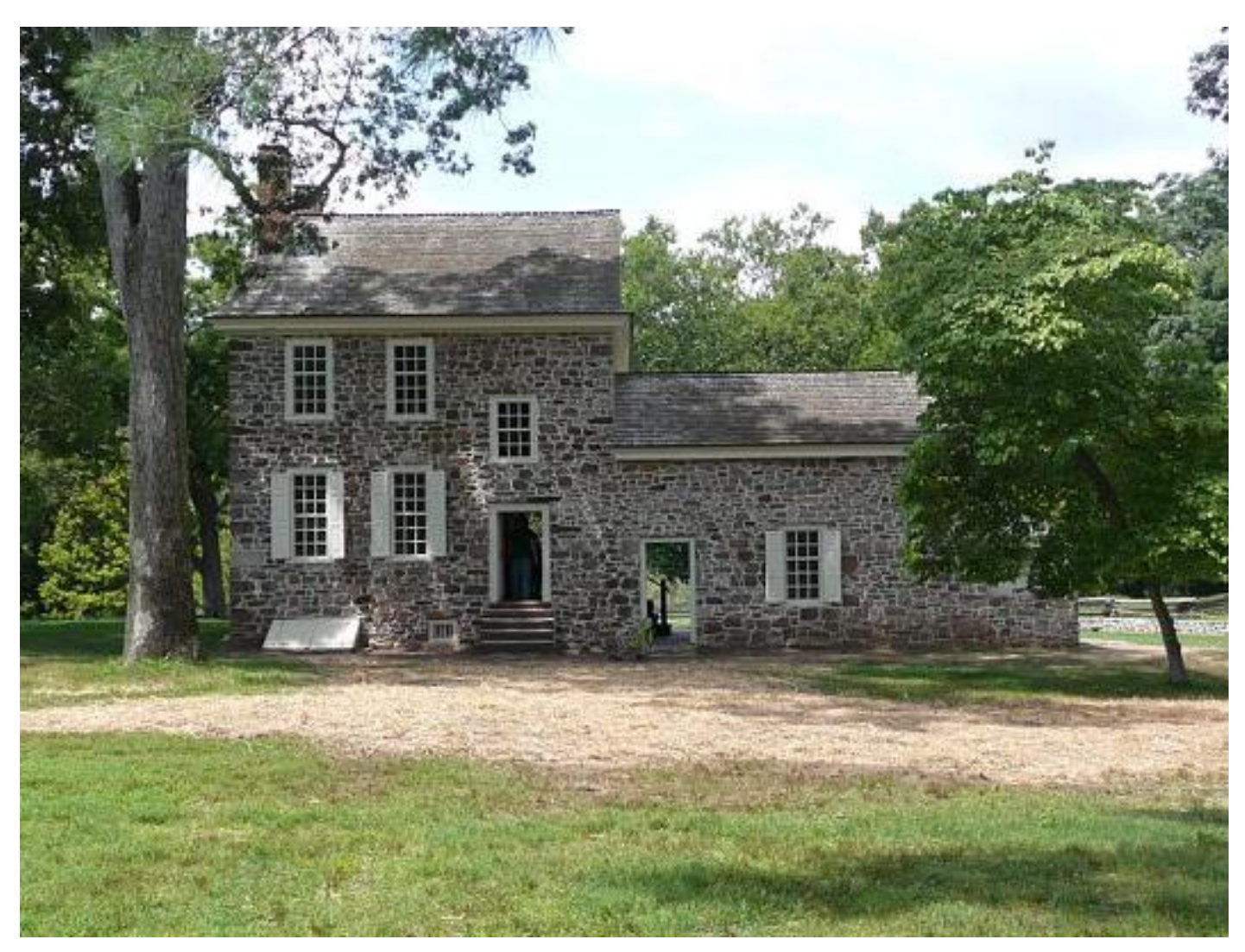
In June 1778 the Army left Valley Forge, and followed the British Army into New Jersey, encountering them at Monmouth. There, the Americans demonstrated what they had learned at Valley Forge. After the war, the house changed ownership several times until 1878, when it was acquired by the Centennial and Memorial Association. In 1905 it became part of Valley Forge State Park and in 1976, part of Valley Forge NHP.