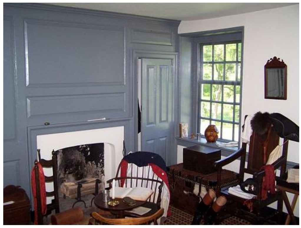
VAFO 3338 Chair; VAFO 3336 Chair; VAFO 3355 Tilt-top Table; VAFO 3507 Mirror; VAFO 3341 Chair

The second bedroom on the left is believed to have been the aides-de-camp bedroom. This room currently holds two beds, but many more would have been sharing this space. In the daytime, this room would have been used as another office, as exhibited by the papers and book on the small tilt-top table in the center of the room.