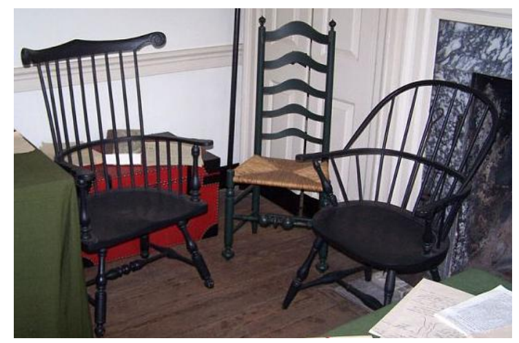
VAFO 30053, VAFO 30072, VAFO 30071 Chairs

The first room on the right was a beehive of activity. Washington's military aides, six to ten in number, used this room for the bureaucratic business of managing a war. The aides-de-camp were required to make three handwritten copies of each official document, using the implements available at the time including quills pens, inkwells, and sanders. At 2:00 P.M., every day the papers and documents were put aside and the tables pushed together and the English creamware removed from the recessed cabinet as the office was transformed into a dining room for the general and his aides. With all the officers together, Washington used this time wisely for group discussion and planning. In the evening, all furniture would have been pushed aside to make room for sleeping. No space was wasted when fifteen to twenty-five people shared a house of this size.