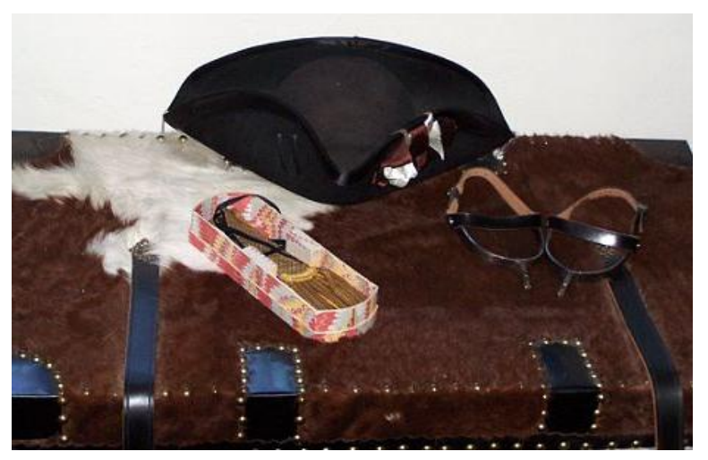
VAFO 82913 Trunk; VAFO 30256 Epaulets; VAFO 30258 Spurs

The second bedroom on the left is believed to have been the aides-de-camp bedroom. This room currently holds two beds, but many more would have been sharing this space. In the daytime, this room would have been used as another office, as exhibited by the papers and book on the small tilt-top table in the center of the room.