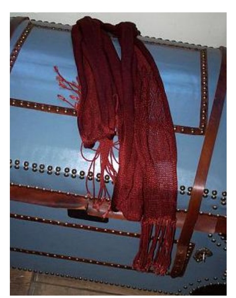
VAFO 82914 Trunk; VAFO 61079 Officer's

strongbox that would have been used to contain important documents or the currency to purchase drastically needed supplies.