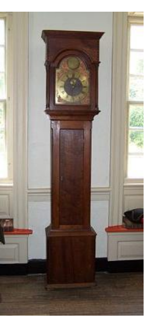
VAFO 3375 Clock

A major source of light and heat came from the fireplace. A fireback such as this was placed behind the fire to protect the masonry at the back of the fireplace as well as to reflect heat back into the room. The fireback is decorated with relief designs which include tulips, hearts and stars, as well as the date "1763." The wrought-iron andirons, also known as "firedogs," kept the logs off of the hearth floor allowing for air to circulate around the fire.