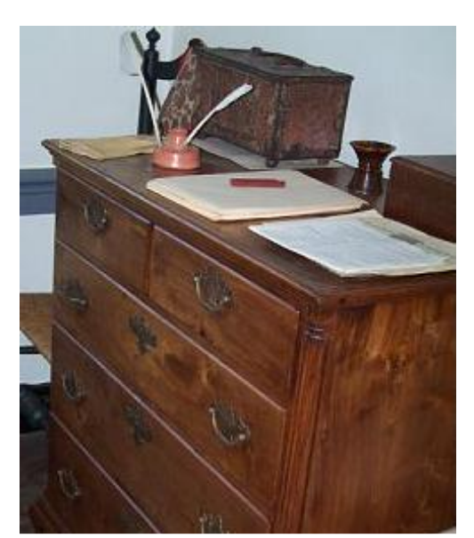
VAFO 3519 Chest of Drawers; VAFO 82924 Pamphlet; VAFO 3365 Strongbox

The third and smallest room of the second story was often used as a guest bedroom. The dignitaries, congressmen, ambassadors, and socially prominent persons who visited General Washington were usually given this room. A folding field bed like this one was popular, and would have been appreciated by guests. The curtains kept away insects while used in the field during campaign season, and helped to keep the occupant warm, a welcome addition for a bed in a room with no fireplace. When not used by a guest, the room became available to anyone in the house.