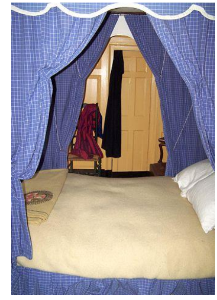
VAFO 3359 Bedstead

The tilt-top table crafted circa 1745 was used as a serving table for tea. The table's small size and ability to fold down,