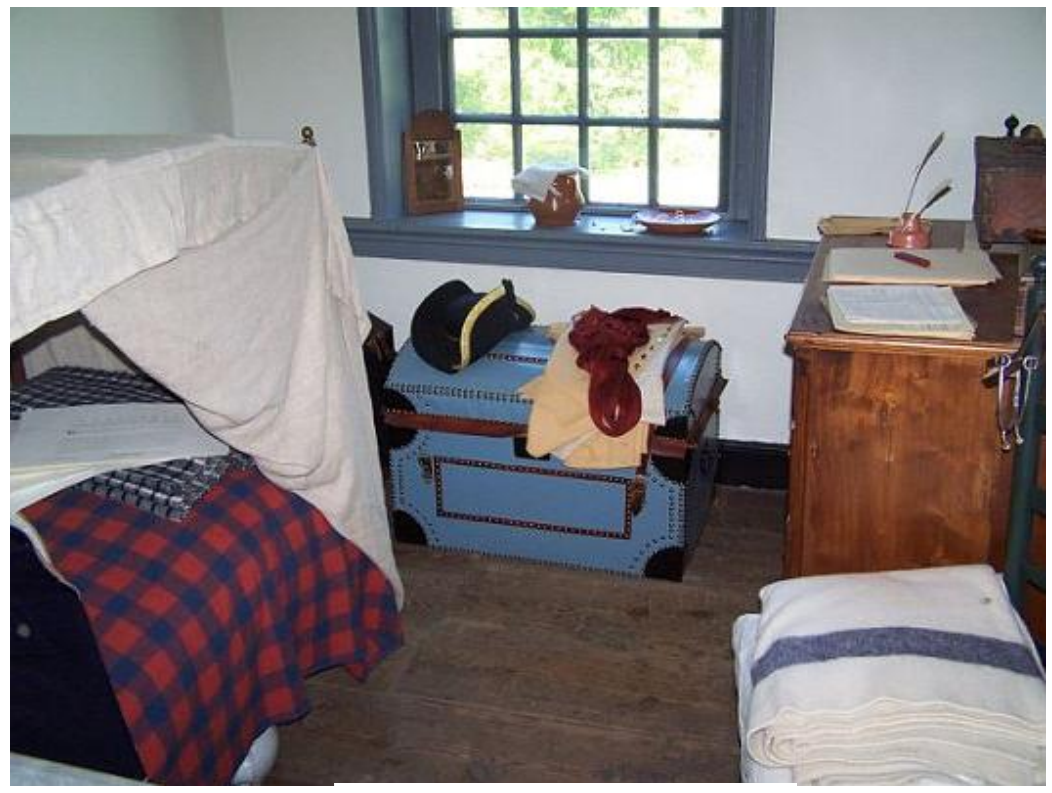
VAFO 91279 Camp Cot

The third and smallest room of the second story was often used as a guest bedroom. The dignitaries, congressmen, ambassadors, and socially prominent persons who visited General Washington were usually given this room. A folding field bed like this one was popular, and would have been appreciated by guests. The curtains kept away insects while used in the field during campaign season, and helped to keep the occupant warm, a welcome addition for a bed in a room with no fireplace. When not used by a guest, the room became available to anyone in the house.