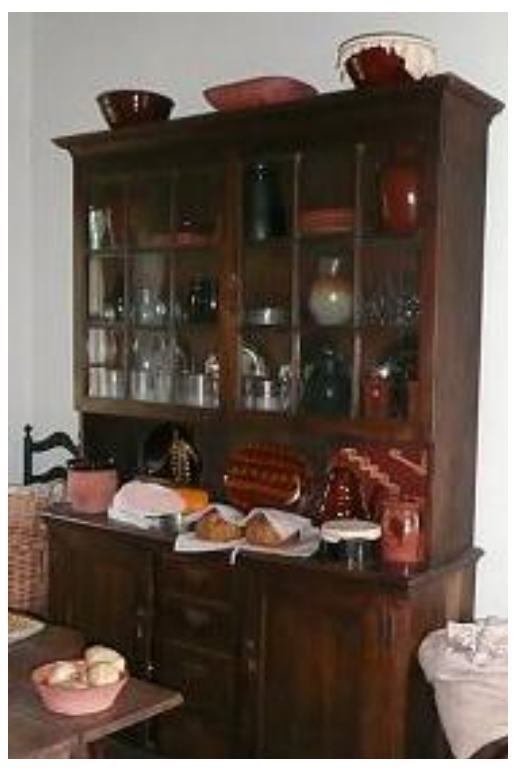
VAFO 3353 Hutch

The large cabinet along the wall is known as a hutch. Crafted in the mid-18th century, it was used to store dishes, eating and serving utensils, as well as provide a work space for cooking. Notice the notches in the counter space -- this hutch was also used as a cutting board.