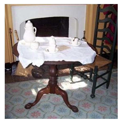
VAFO 3355 Table

The tilt-top table crafted circa 1745 was used as a serving table for tea. The table's small size and ability to fold down,