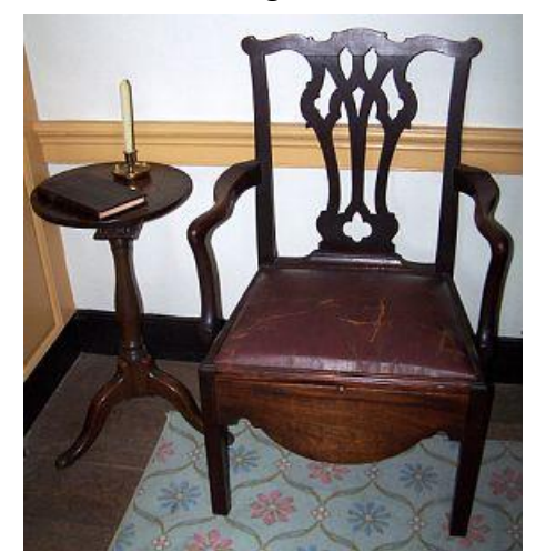
VAFO 3507 Table; VAFO 16 Commode Chair

in copying documents; no one was ever idle.