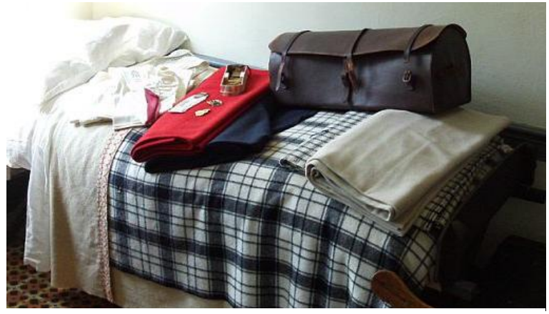
VAFO 91279 Field Cot; VAFO 30250 Portmanteau

Officers had the privilege of having their own folding military field cots, which they purchased and transported at their own expense. An aidede-camp could set this bed up quickly in the field or in a house. His belongings were kept in large traveling trunks and portmanteaus. Made of brown tooled leather, a portmanteau was used to transport small personal items and a few pieces of clothing. They were popular with travelers due to its size and the ease of transport on horseback.