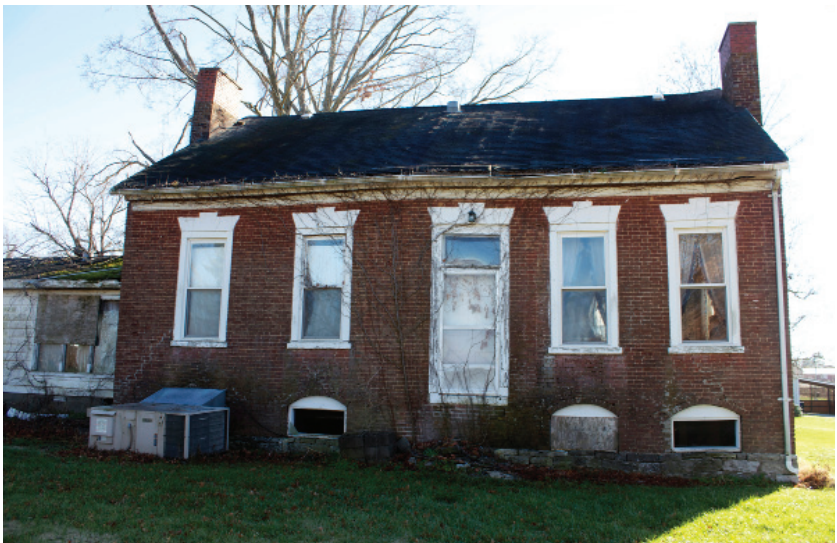
Figure 3. Located on the Northern Route of the Trail of Tears in Livingston County, Kentucky, this 1½-story, double-pile, hall-parlor dwelling was reportedly built for Richard Caldwell in 1824.