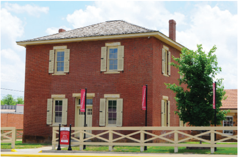
Figure 15. The Cherokee Supreme Court Building in Cherokee County, Oklahoma, is an excellent example of a restored masonry building.

Do not add stucco or cement to “patch” a brick or stone wall or as a cheaper option of repairing the hard material and the historic mortar.