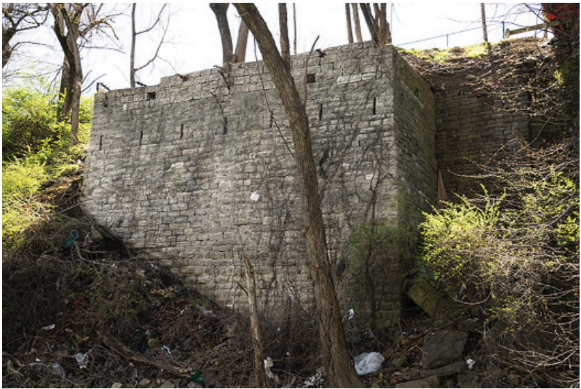
Figure 8. Detachments traveling the Northern Route of the Trail of Tears crossed the Cumberland River in Nashville via a covered toll bridge constructed in 1823. The west abutment of the toll bridge remains extant today and retains much of its integrity.