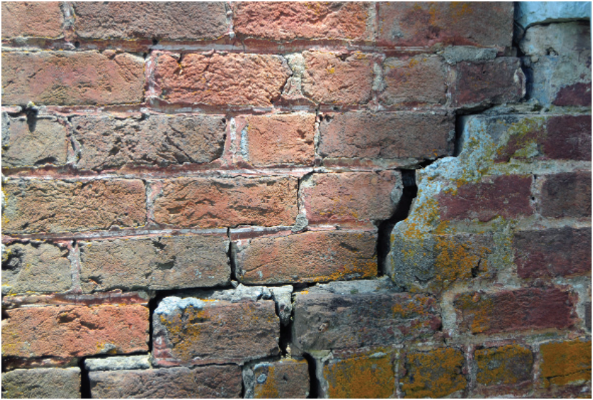
Figure 12. James Brown House, Hamilton County, Tennessee.