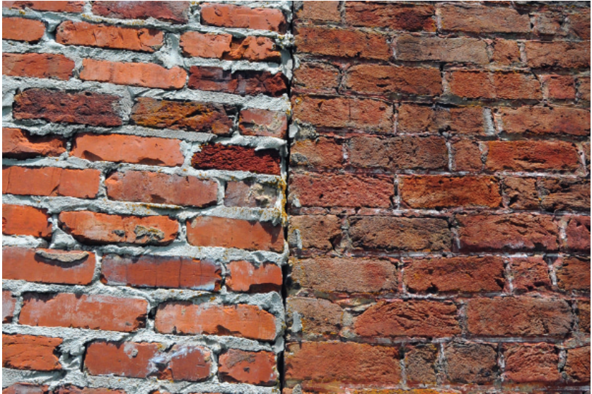
Figure 14. James Brown House, Hamilton County, Tennessee.