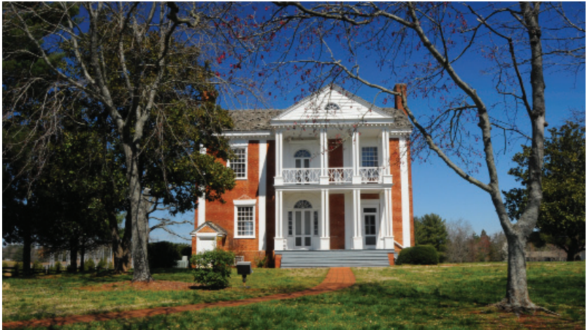
Figure 1. This two-story, Federal-style house was built in Murray County, Georgia, between 1819 and 1823 for Cherokee leader Joseph Vann.

To help property owners become better stewards of this architectural and historical legacy, the Center for Historic Preservation at Middle Tennessee State University partnered with the National Trails Intermountain Region of the National Park Service to develop this guide. It offers advice and solutions regarding the restoration and preservation of historic masonry buildings associated with the Trail of Tears National Historic Trail by addressing common problems faced by property owners and construction/preservation professionals.