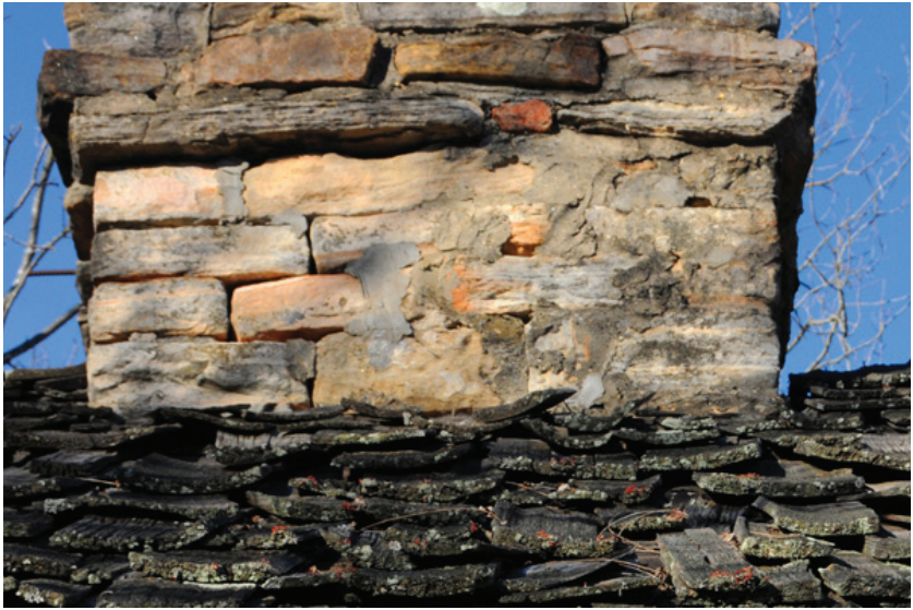
Figure 13. The chimney of the Snelson-Brinker House in Crawford County, Missouri, was patched with Portland cement.