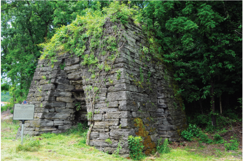
Figure 4. Overgrown vegetation damages the ca. 1833 Lee and Gould Iron Furnace located on the Benge Route in Hickman County, Tennessee.