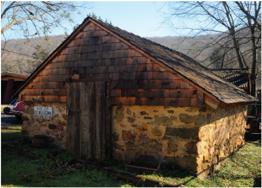
Figure 7. The Willstown Mission Smokehouse in Dekalb County, Alabama, is an important remnant of the mission, but it is now surrounded by modern development that affects its integrity of setting and feeling.

Integrity of workmanship speaks to the craftsmanship of the building. If modern repairs have overwhelmed the original workmanship—“the physical evidence of the crafts of a particular culture or people during any given period of history”—then the building has lost crucial elements of what made it historic.