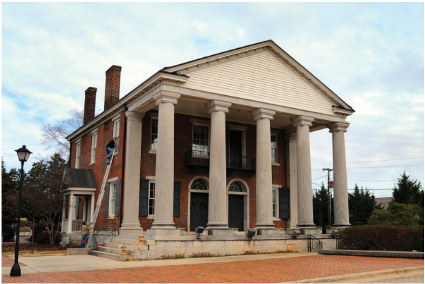
Figure 2. Built in the Greek Revival style, the State Bank in Decatur, Alabama was constructed in 1833 along the Tuscumbia, Courtland, and Decatur Railway. The Deas and Whiteley detachments passed by the building on their journey to Indian Territory.