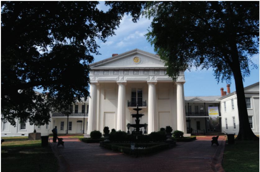
Figure 16. Old State House, Pulaski County, Arkansas.

For additional technical assistance, contact your State Historic Preservation Office (SHPO): http://www.nps.gov/nr/shpolist.htm .