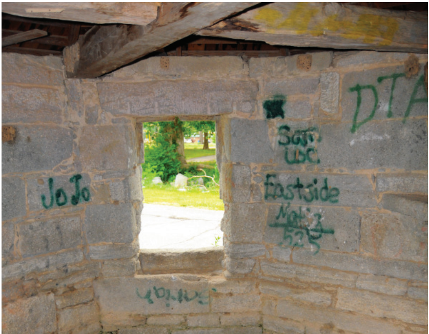
Figure 10. The limestone walls of the Lewis Ross Springhouse in Mayes County, Oklahoma, need cleaning after vandals damaged the interior with spray paint.