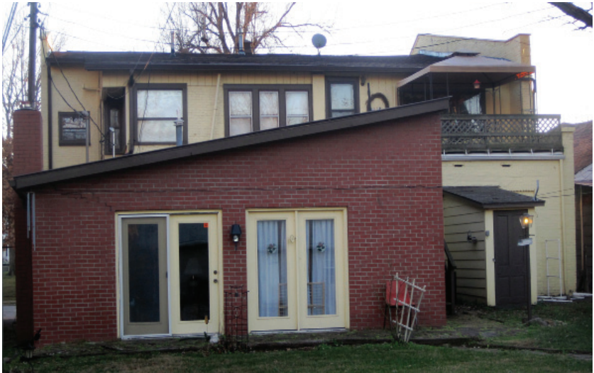
Figure 6. Rear additions of the Sim House in Golconda, Illinois.