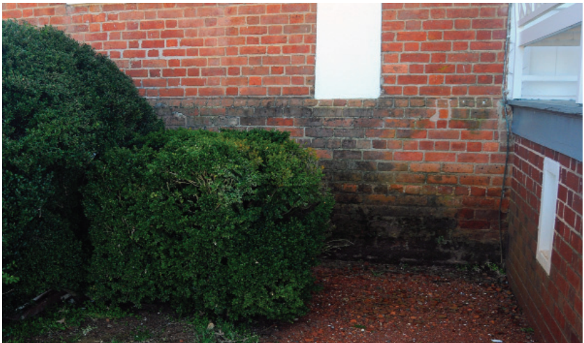
Figure 9. Mold grows on the north elevation of the Chief Vann House in Murray County, Georgia, and needs cleaning. Sometimes it is not enough to simply clean the walls regularly, though. This mold is likely caused from the boxwoods planted in front of the building, which are blocking sunlight and leading to moisture issues.