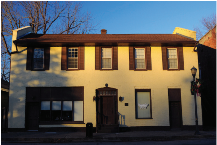
Figure 5. Although the façade (above) of the Sim House in Golconda, Illinois, retains integrity, the number and date of the rear additions (below) would raise questions about the building’s overall architectural integrity.