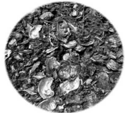
A close-up photograph of tabby

For the enslaved people, plantation life revolved around these tabby structures. The tabby slave quarters, barn and kitchen house were centers of activity for the plantation and its workers.