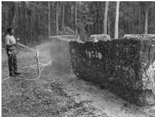
Tabby preservation in progress

For updates on tabby preservation and stabilization, visit our website: http://www.nps.gov/timu