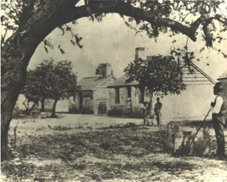
Historic photograph of the slave cabins

Tabby was a constant backdrop to life for everyone at this plantation. Each morning enslaved men, women and children opened their eyes to the sight of four tabby walls. They began their day's labor in the cool, dark tabby barn, gathering their tools and supplies. At night, they closed their eyes to the walls surrounding them.