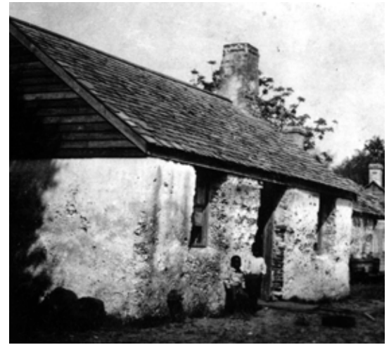
Historic photograph of the slave quarters

Upon completing their daily tasks, slaves tended to their personal needs. This included working their own food plots, cooking, fixing their homes, and raising livestock. Slave families struggled to keep traditions alive, passing along African heritage during the evening work at the cabins.