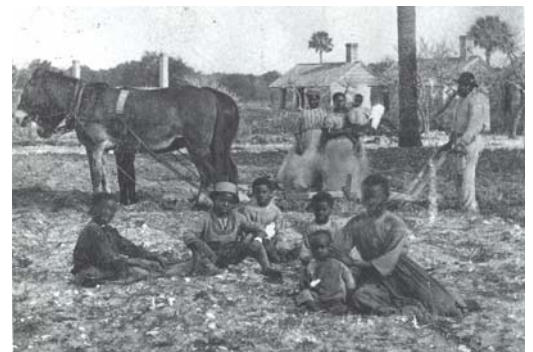
Near the slave cabins, late 19 th century

for the owner and his family, and the stories told by the enslaved kitchen workers to pass the long day of work and heat.