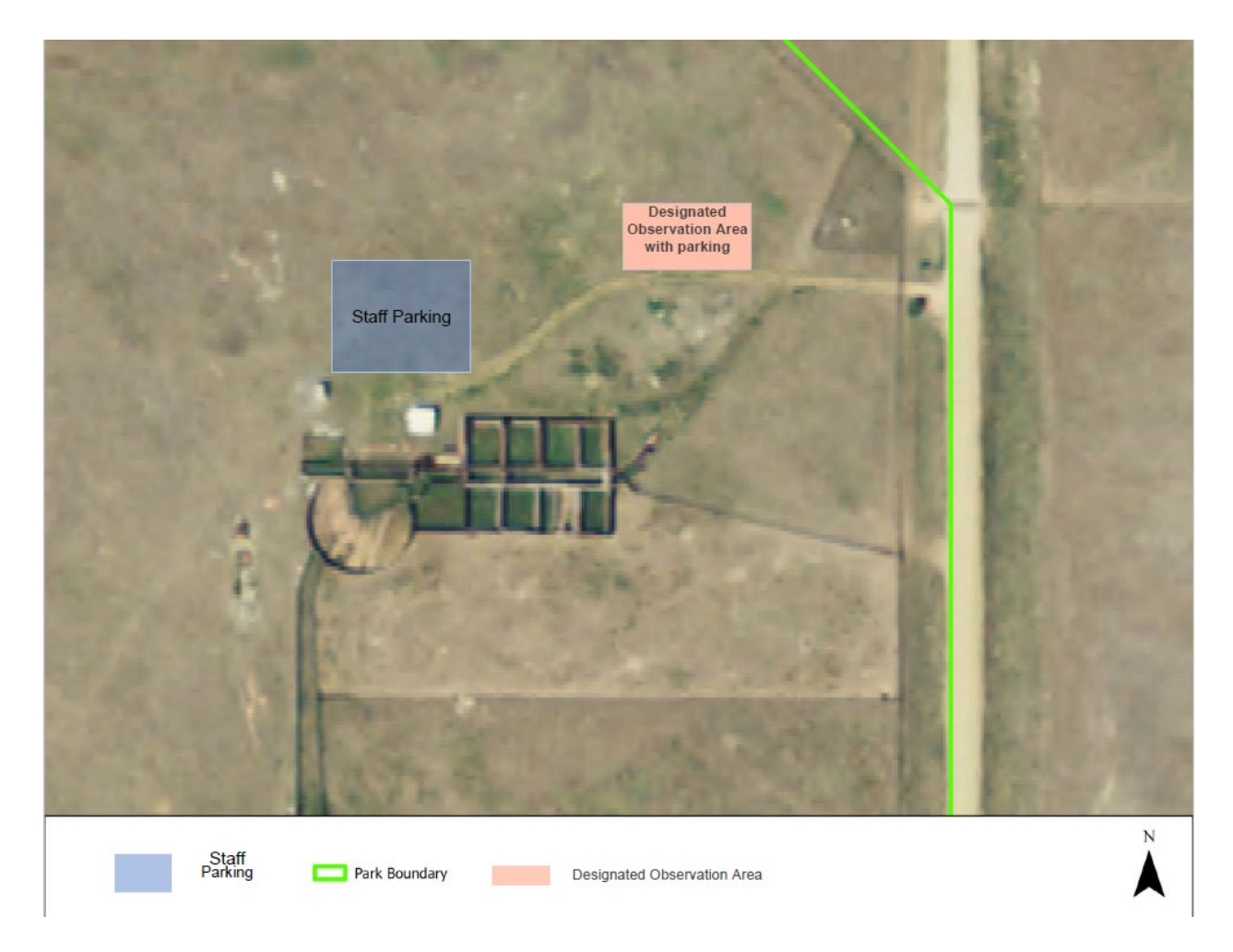
Figure 4: The Location of the Designated Observation Area at the Wildlife Handling Area