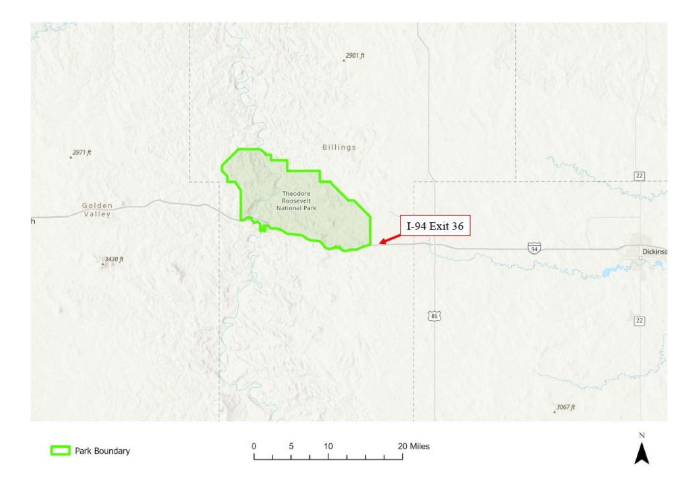
Figure 2: The South Unit Location and Interstate Exit to Access the Wildlife Handling Area