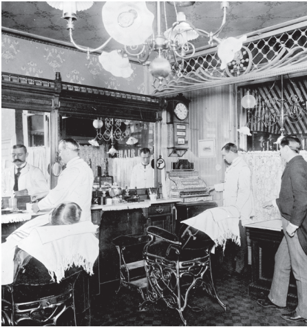
Barber shop in New York City, late 1800s

Susan B. Anthony had worked alongside women like Elizabeth Cady Stanton supporting rights for women for many years. In 1872, Anthony organized her sisters and several other women in Rochester, New York, to register and attempt to vote in the presidential election that fall. On November 1, 1872, Susan and her sisters successfully persuaded the male officials at the voter registration office that the 14th Amendment guaranteed that all U.S. citizens be treated equally under the law. Susan argued that this meant that women, as U.S. citizens, were also covered under voting laws. The registration officials didn't know what to do so they let the women register.