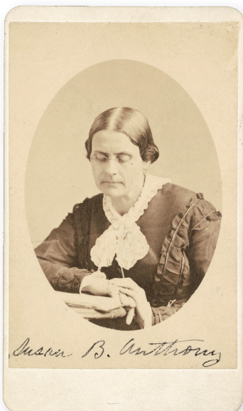
Susan B Anthony, 1870

LIBRARY OF CONGRESS; PHOTO BY MATHEW BRADY ALL OTHER IMAGES NPS UNLESS CREDITED