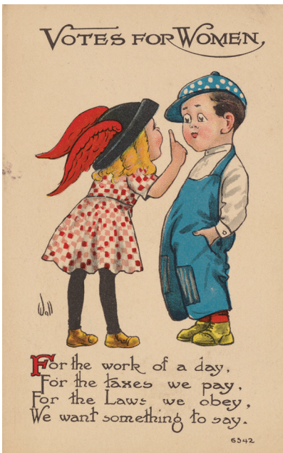
Postcard, early 1900s

Interview an adult you know that could tell you about their experiences in voting. Perhaps you could talk with a grandparent or an older family friend that remembers the Civil Rights Movement of the 1960s that led to the Voting Rights Act of 1965. Think about the questions you would ask your interview subject. What would you like to learn about voting rights? What would be interesting for your “newspaper readers”? Write a newspaper article based on the interview.