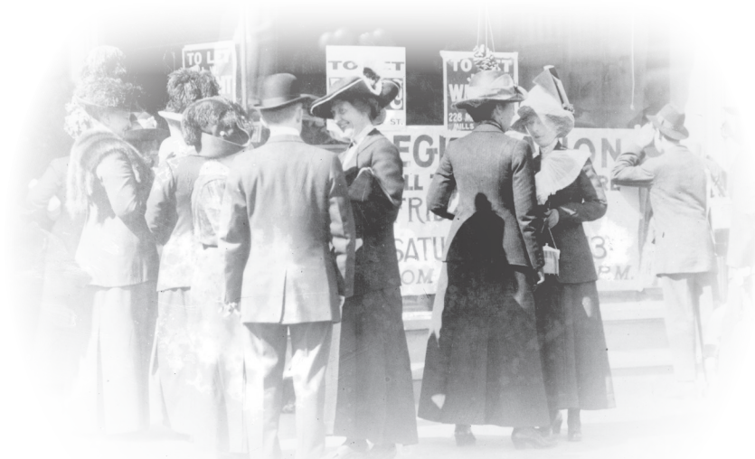
Women register to vote, early 1900s