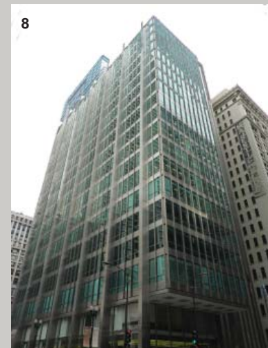
1. Chase Grain Elevator, Sun Prairie, WI; 2. Sengelmann Hall, Schulenburg, TX; 3. Cincinnati Color Building, Cincinnati, OH; 4. Carlin's Amoco Station, Roanoke, VA; 5. Breakwater Hotel, Miami Beach, FL; 6. Croke Patterson-Campbell Mansion, Denver, CO; 7. Old Masonic Temple and City Hall, Vallejo, CA; 8. Inland Steel Building, Chicago, IL.