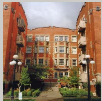
Trinity Place Apartments, Portland, OR