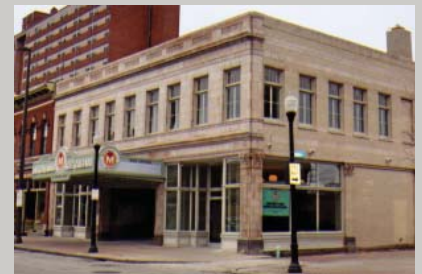
The Rialto Theater, Cleveland, OH

The former Central States Life Insurance Company Building recently became the headquarters of Chameleon Integrated Services (CSI), a St. Louis, MO-based information technology firm, following a $3 million rehabilitation. Individually listed in the National Register, this 1921 Mission Revival-style building was designed for a local corporate headquarters, complete with an impressive two-story atrium. Later used for many purposes, and most recently as a series of nightclubs, CSI purchased the building and returned it to its original use as corporate offices. The building's exterior and surviving historic features on the inside were restored, and state-of-the-art security systems installed. Twenty-seven percent of the work was completed by minority-owned businesses from Greater St. Louis. With their new offices and a building rich in architectural detail, CSI has not only saved an impressive historic resource, but also is contributing to the rebirth of the local community.