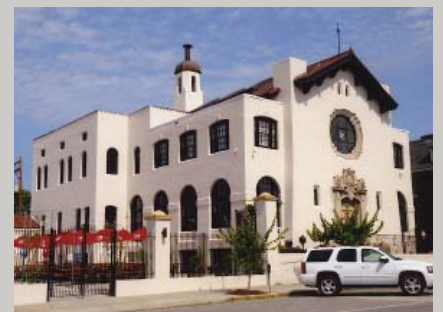
Central States Life Insurance Co. Building, St. Louis, MO