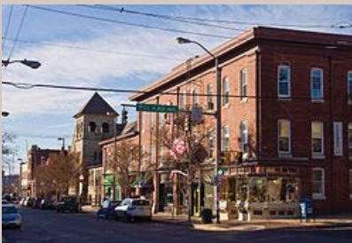
Above: Exterior view of tower and interior view; bottom: Hampden Historic District, Baltimore, MD.

The rehabilitation work met the Secretary of the Interior's Standards for Rehabilitation, creatively adapting the building to a new use while retaining its historic character and features. The project was also awarded the Baltimore City Green Standards Two Stars rating – the equivalent of LEED-NC Silver Certification from the United States Green Building Council. The preservation and reutilization of this former mill building will serve as an anchor and catalyst to the positive redevelopment momentum in a portion of Baltimore City that is seeing a rebirth in recent years.