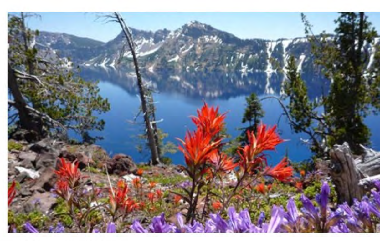
Wellness in Nature > Get a healthy dose of nature—wherever you are