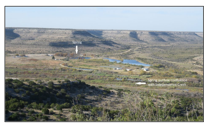
Figure 2. Overview of Independence Creek Preserve.

Independence Creek Preserve provides an outstanding and illustrative example of a spring-fed stream that ensures perennial river discharge in an arid environment. The high-discharge rate spring complex supports habitat for three vulnerable native fish species and provides habitat for nesting and migratory birds. Land surrounding Independence Creek includes characteristic examples of Chihuahuan Desert flora and fauna, as well as habitats for rare species in a landscape dominated by mesa topography.