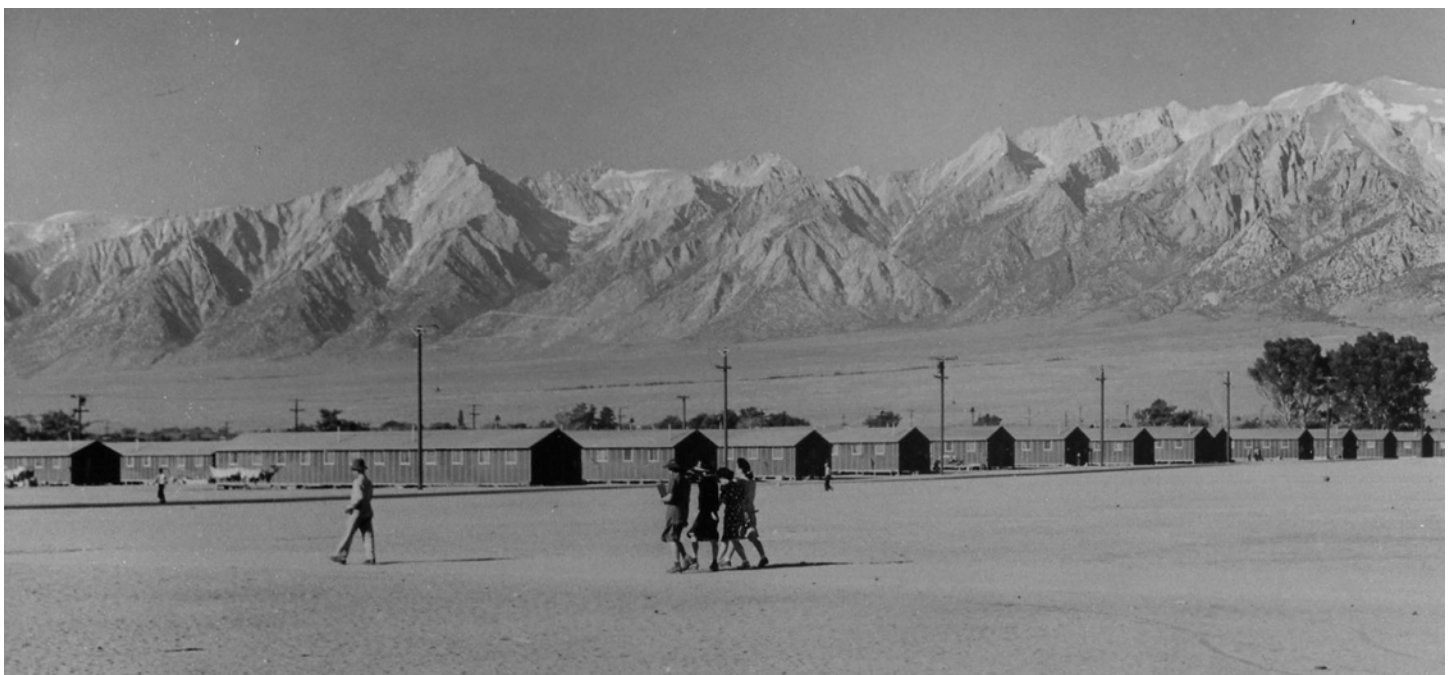
The Manzanar War Relocation Authority Center for internees of Japanese Ancestry.