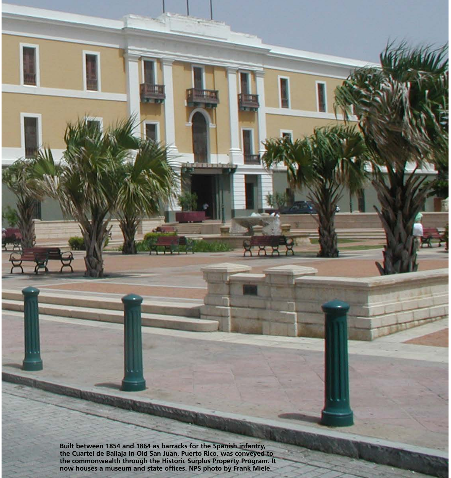
Built between 1854 and 1864 as barracks for the Spanish infantry, the Cuartel de Ballaja in Old San Juan, Puerto Rico, was conveyed to the commonwealth through the Historic Surplus Property Program. It now houses a museum and state offices.

The National Park Service provides grants, technical assistance, and training that support the preservation and enjoyment of our cultural heritage on public lands and private properties throughout the nation.