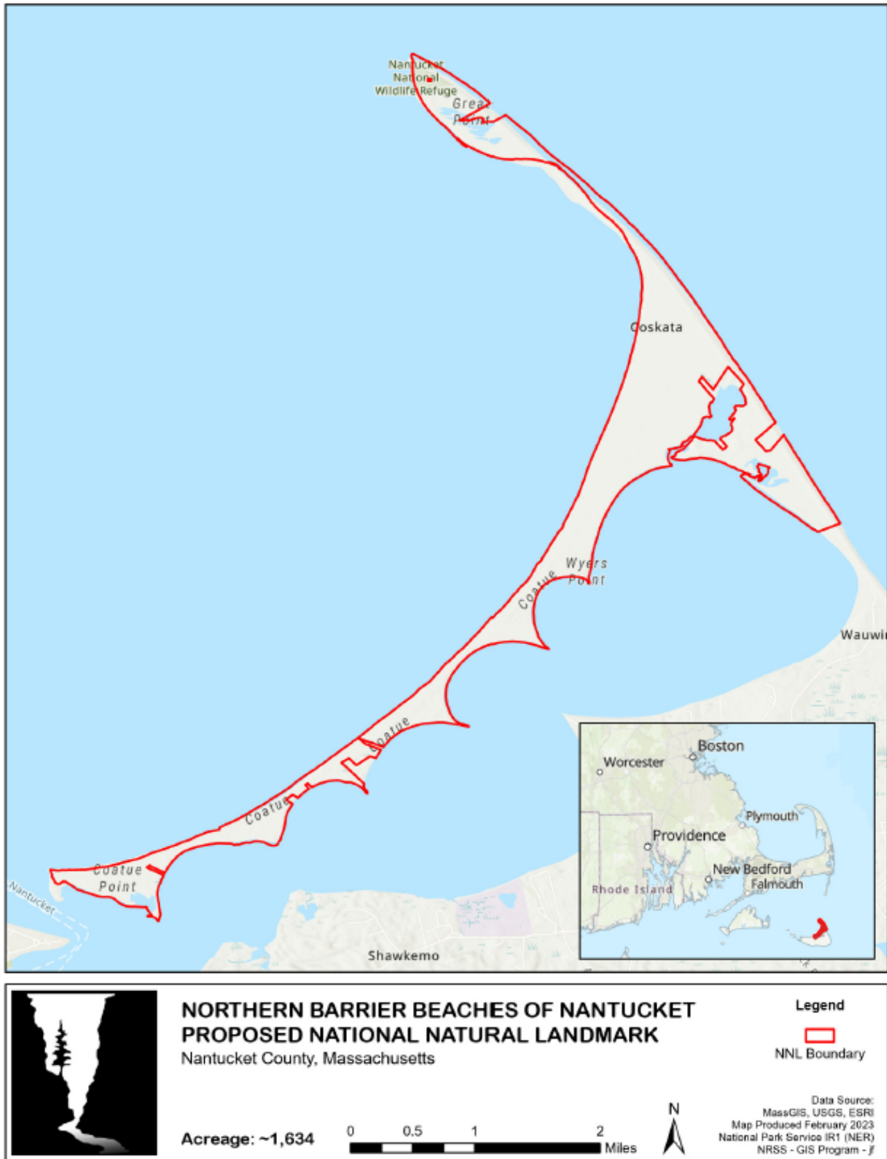
Figure 3. Map showing the general location within Massachusetts and the proposed boundary for the Nantucket Barrier Beach and Wildlife Refuge potential NNL.