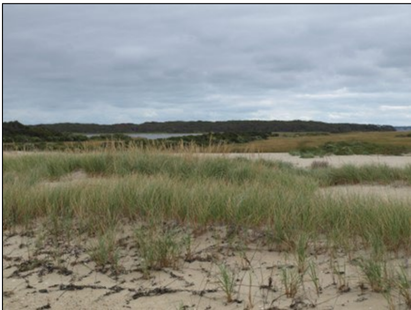
Figure 2. (Top) Aerial view of rhythmic cusped spits, photo by Above Summit; courtesy of The Trustees; (Bottom) On the ground view of The Glades, Coskata Pond and Coskata Woods in the distance, NPS photo.