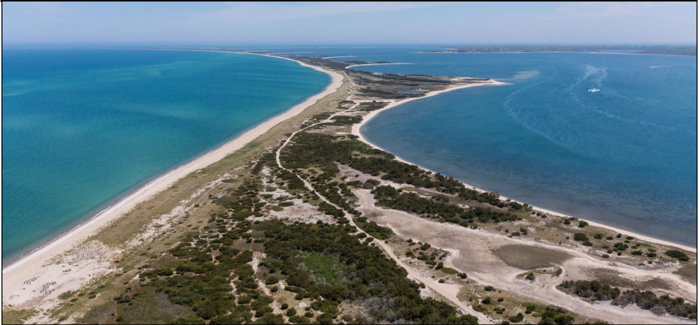
Figure 1. Aerial view of Nantucket Barrier Beach and Wildlife Refuge