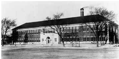
Monroe Elementary School (National Historic Landmark photograph).