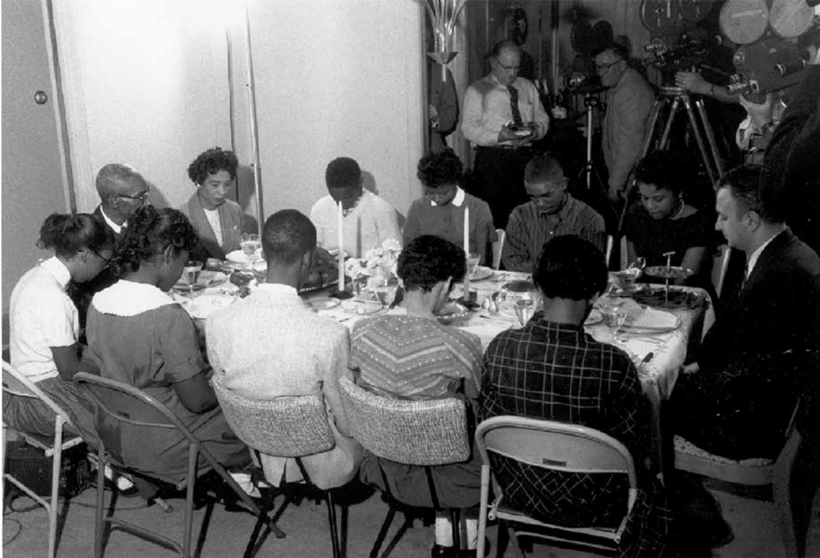
Daisy Bates House, Little Rock, Arkansas, Thanksgiving Dinner, 1957 (National Historic Landmark photograph, courtesy of Will Counts).

The Daisy Bates House is nationally significant for its role as the de facto command post for the Central High School desegregation crisis in Little Rock and its association with Daisy Bates who was at the forefront of black community efforts to desegregate the school. The house served as a haven for the nine African-American students who desegregated the school and a place to plan the best way to achieve their goals. This event marks a milestone in the history of school desegregation when, for the first time, a U.S. President used federal powers to uphold and implement a federal court ruling regarding school desegregation.