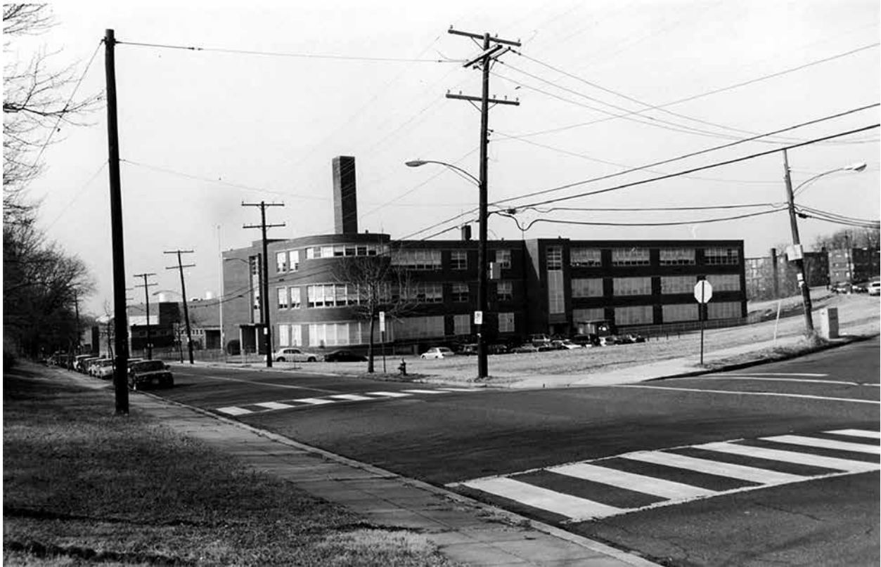
John Philip Sousa Junior High School, Washington, D.C. (National Historic Landmark photograph).

The John Philip Sousa Junior High School (now the John Philip Sousa Middle School) is associated with the struggle to desegregate schools in the nation's capitol as part of the Bolling v. Sharpe court case. The U.S. Supreme Court decided this case on the same day as the public school segregation cases in Kansas, Virginia, Delaware, and South Carolina combined in Brown v. Board of Education . The Bolling case was an integral part of the U.S. Supreme Court's decision that neither the federal or state governments could maintain racially segregated schools.