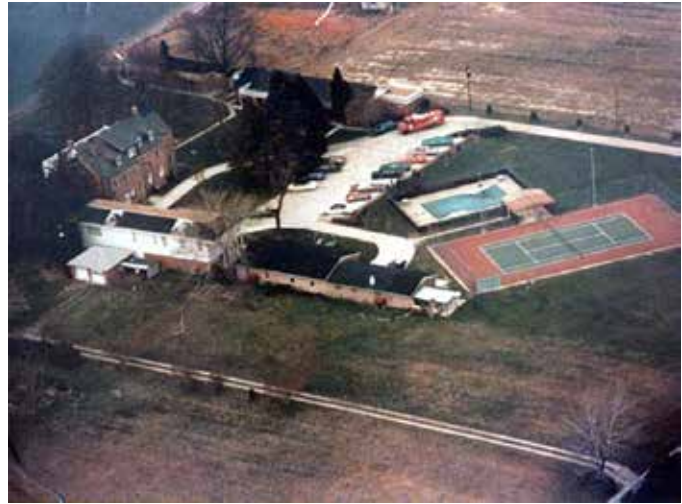
Robert R. Moton Conference Center (National Historic Landmark photograph).

Moton High School was the run down high school where its students initiated a strike for equal facilities and subsequently filed suit against school desegregation. It was among the school segregation cases consolidated in Brown v. Board of Education (1954) before the U.S. Supreme Court case that struck down the “separate but equal” doctrine governing public school policy. Subsequently, it is associated with Virginia’s efforts at “massive resistance” to school integration when Prince Edward County closed its public schools. Moton High School was designated a National Historic Landmark on August 5, 1998.