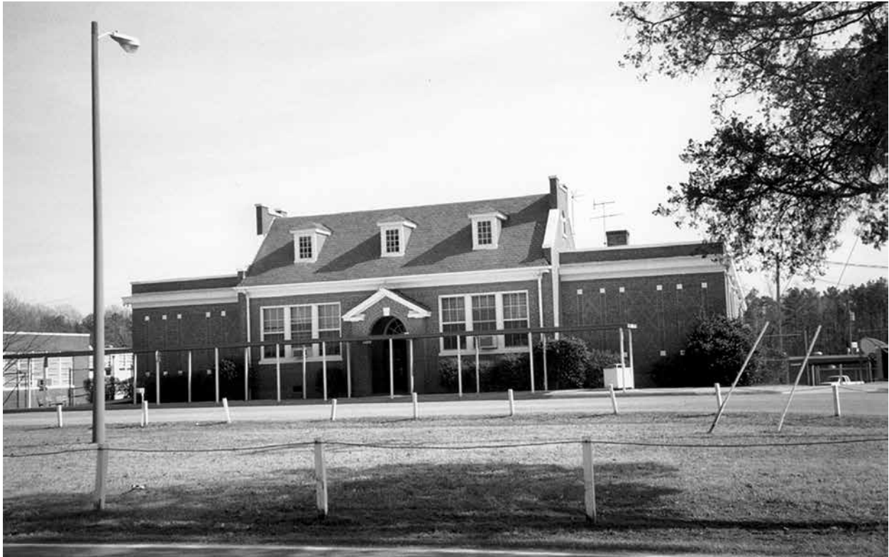
New Kent School, 1930 Building, New Kent County, Virginia (National Historic Landmark photograph).

The New Kent School and the George W. Watkins School are associated with the most significant public school desegregation case the U.S. Supreme Court decided after Brown v. Board of Education . The 1968 Green v. County School Board of New Kent County decision set the standards that judges would use to determine whether school districts were in constitutional compliance in school segregation cases. Thus, a decade of massive resistance to school desegregation in the South from 1955-1964, was replaced by an era of massive integration from 1968-1973, as the Court placed an affirmative duty on school boards to integrate schools.