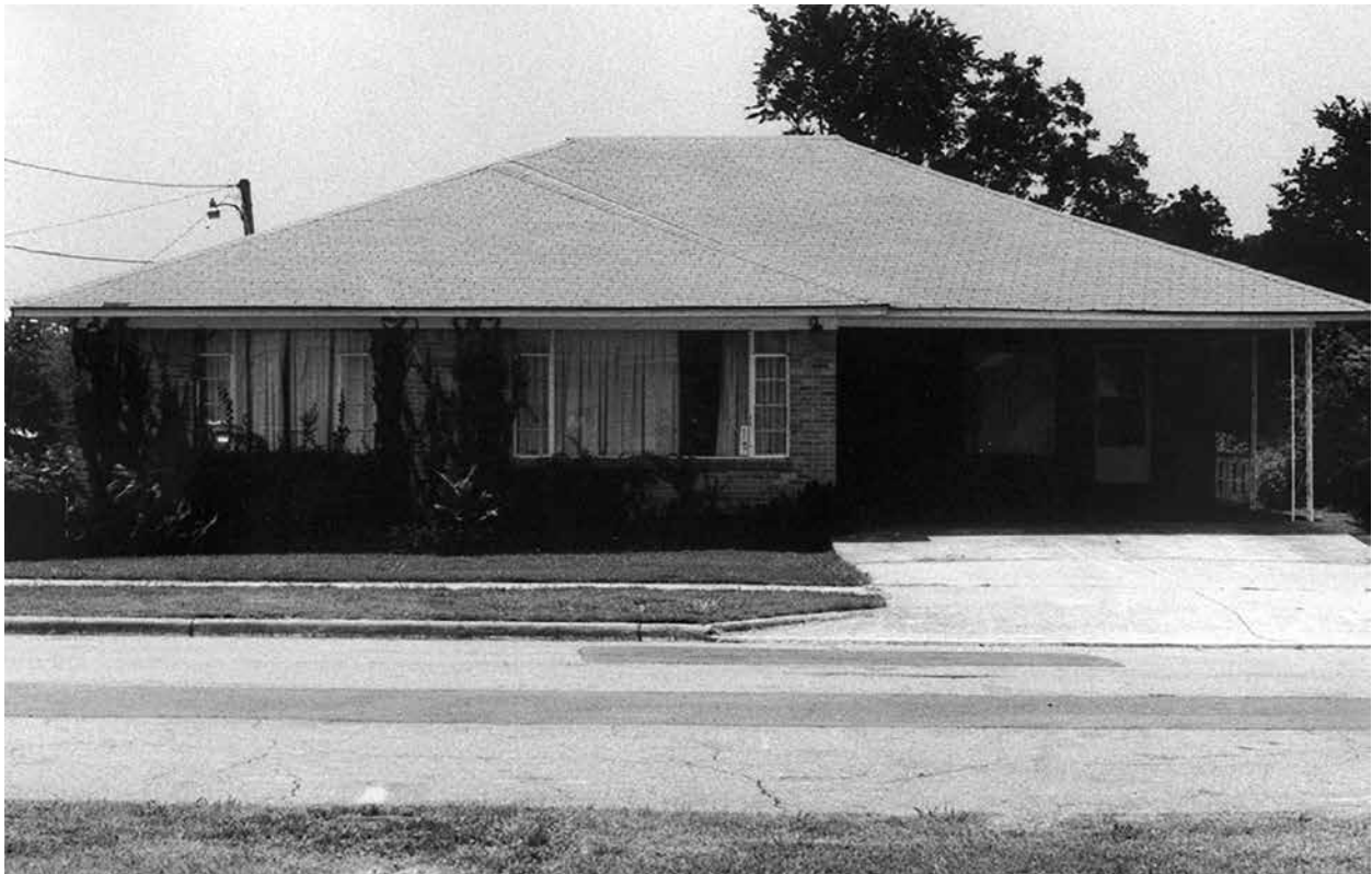
Daisy Bates House, Little Rock, Arkansas (National Historic Landmark photograph).

Throughout this crisis and during the 1957-1958 school year, the Little Rock Nine used the Bates House as a planning place, an official daily pick-up and drop-off point, and a place to be counseled and consoled. Daisy Bates also served as liaison with parents and local and federal officials in planning how desegregation would proceed. The Bates House stands as a symbol of the role of civil rights advocates who fought against legal and social obstacles to educational opportunity for African-American youth during a period of southern massive resistance to desegregation. The Daisy Bates House was designated a National Historic Landmark by the Secretary of the Interior on January 3, 2001.