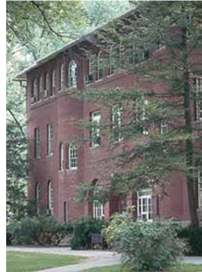
Lincoln Hall, Berea College (Photograph from National Register of Historic Places Online Itinerary "We Shall Overcome, Historic Places of the Civil Rights Movement," courtesy of Berea College).

A private school founded in 1855, Berea College was the first college established in the U.S. for the specific purpose of educating black and white students together. In 1904 the Kentucky state legislature mandated that black and white students could only be taught simultaneously if they were taught twenty-five miles apart. The U.S. Supreme Court upheld the state's right to pass laws to regulate state chartered private institutions on the basis of race, thus lending additional credence to do the same for public schools. This is the only instance in which the U.S. Supreme Court upheld school segregation in higher education. Lincoln Hall was designated a National Historic Landmark on December 2, 1974.