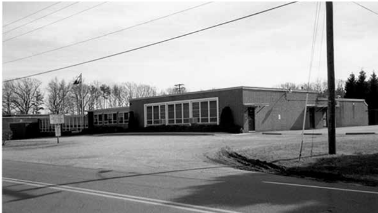
George W. Watkins School, New Kent County, Virginia (National Historic Landmark photograph).

The New Kent School and the George W. Watkins School were designated a National Historic Landmark by the Secretary of the Interior on August 7, 2001. An online lesson plan, “New Kent School and the George W. Watkins School: From Freedom of Choice to Integration,” is available online through the Teaching with Historic Places (TwHP) web-site ( https://www.nps.gov/subjects/teachingwithhistoricplaces/index.htm ).