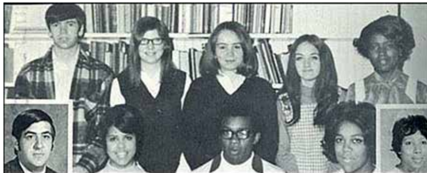
Yearbook Photograph of Integrated Student Government Body, New Kent High School, New Kent County, Virginia (National Register of Historic Places, Teaching with Historic Places photograph, courtesy of New Kent County Schools, Virginia).