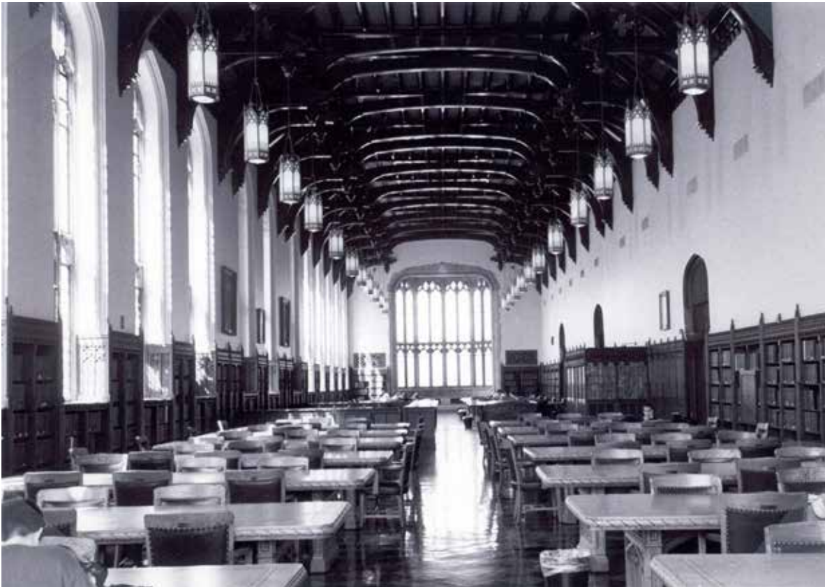
Bizzell Library, University of Oklahoma, Norman, Oklahoma, Main Reading Room (National Historic Landmark photograph).

In reaching its decision the Court found that intangible factors such as “intellectual commingling” with other students, were essential to an equitable education. These factors played a role four years later in the Brown decision when the Court cited its earlier finding in the McLaurin case that intangible factors in education prohibited the possibility of the “separate but equal” doctrine. The Secretary of the Interior designated Bizzell Library a National Historic Landmark on January 3, 2001.