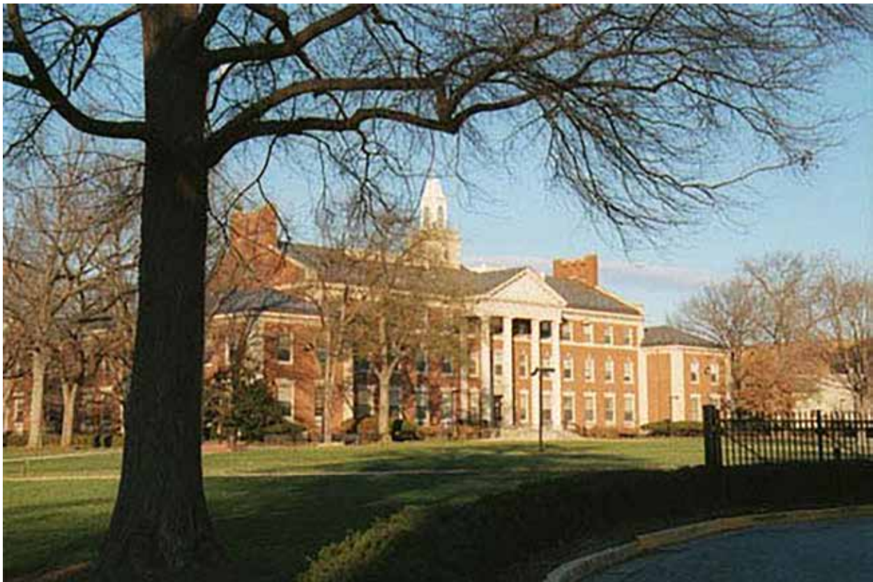
Frederick Douglas Memorial Hall, Howard University, Washington, D.C.

Frederick Douglass Memorial Hall symbolizes the academic research undertaken in preparation for cases litigated by the NAACP LDF. This building is where Howard University professors and LDF lawyers met to discuss how their research into the harmful effects and infeasibility of the “separate but equal” doctrine weakened the legality of segregation. The buildings were designated a National Historic Landmark by the Secretary of the Interior on January 3, 2001.