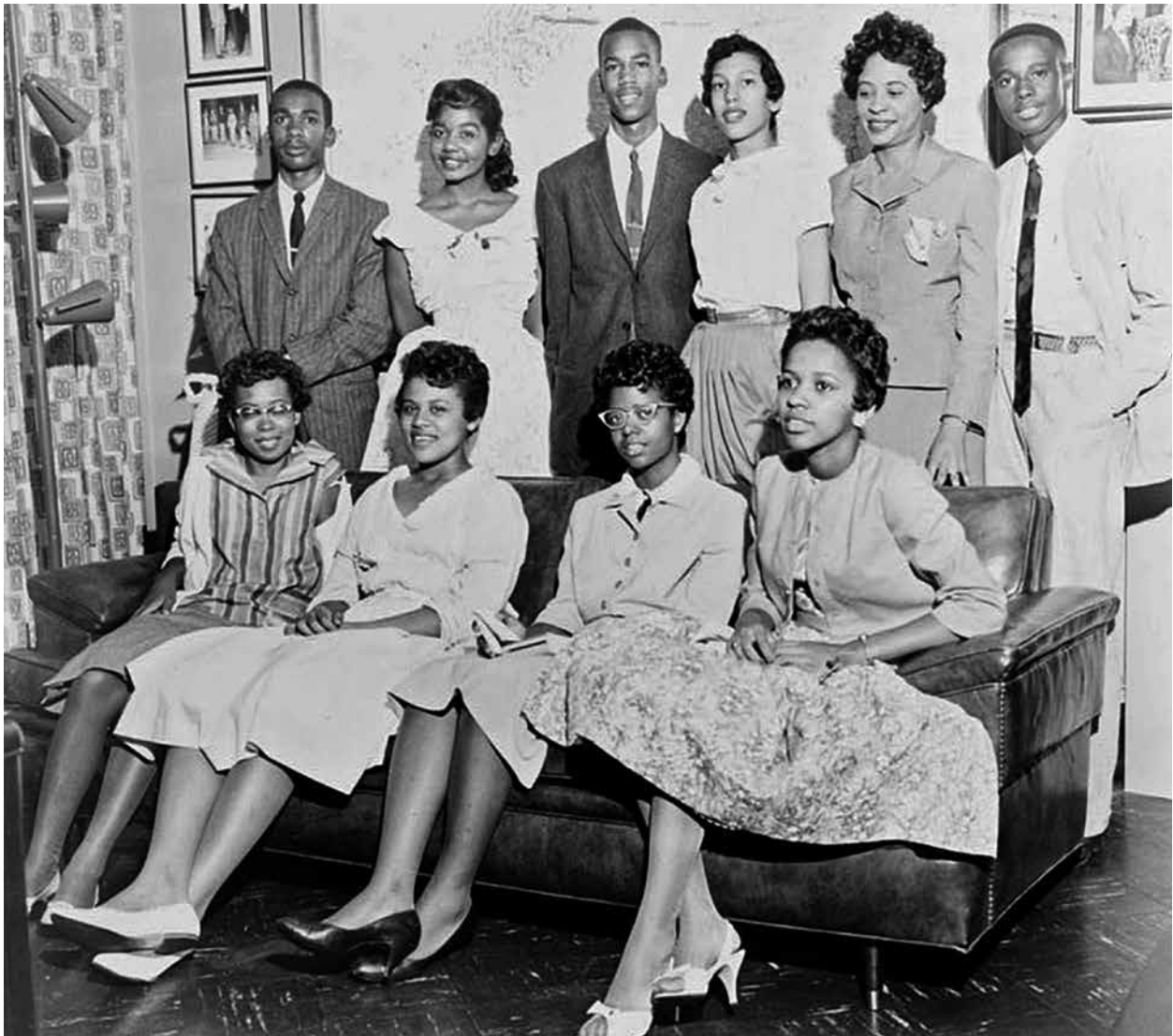
Central High School's "Little Rock Nine" and Daisy Bates Posed in Living Room.

A NATIONAL HISTORIC LANDMARK THEME STUDY UPDATE May 17, 2004