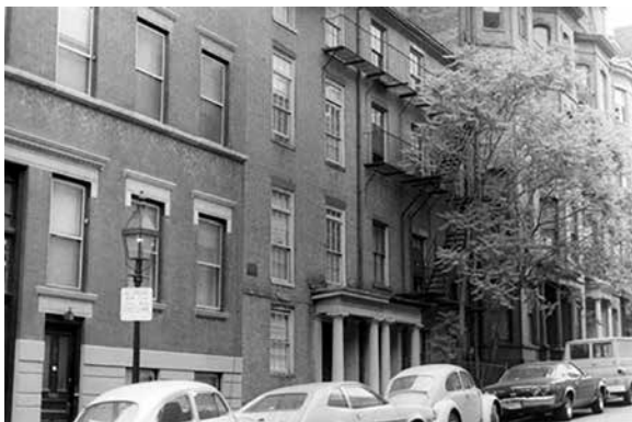
Charles Sumner House, Boston, Massachusetts (National Historic Landmark photograph).