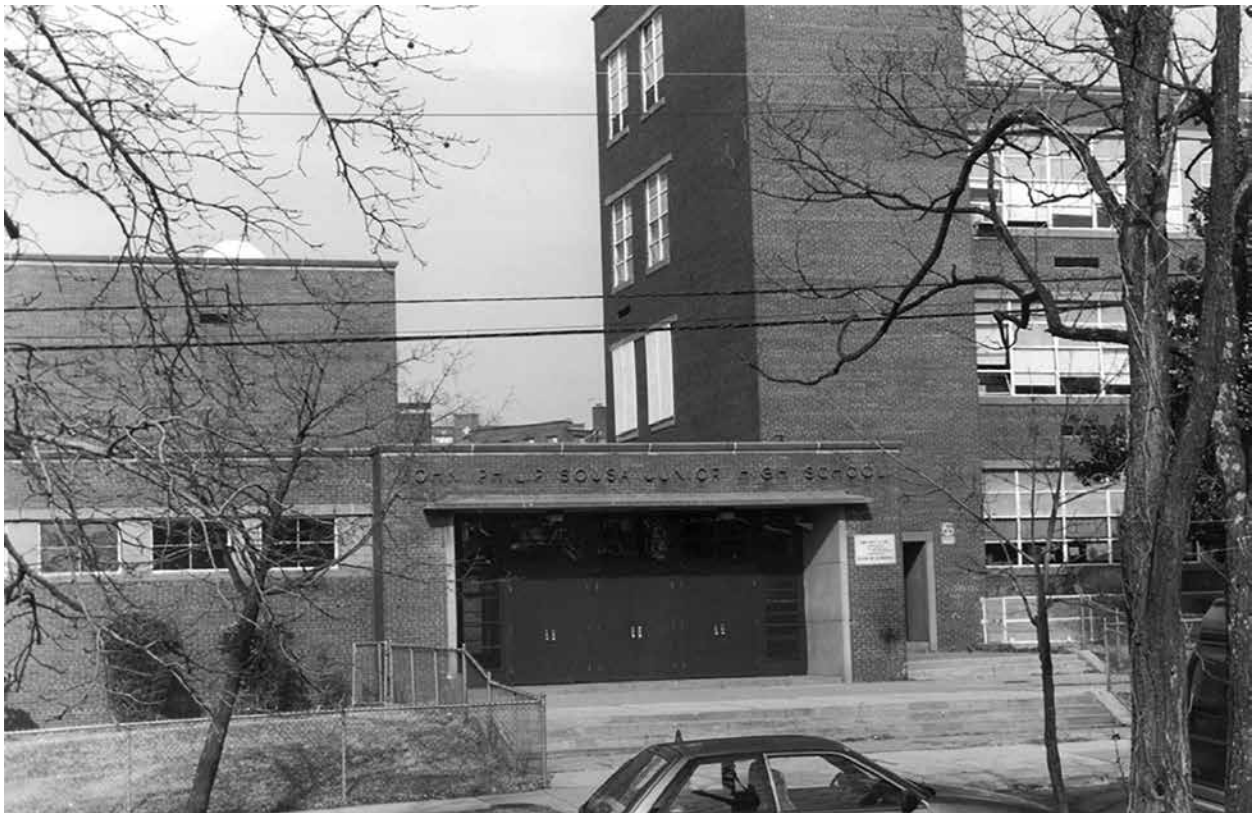
John Philip Sousa Junior High School, Washington, D.C. (National Historic Landmark photograph).

As a result, the District’s schools opened with mixed classes and faculty in September 1954, prior to the Supreme Court’s decision in Brown II (1955) that mandated schools to desegregate “with all deliberate speed.” The school now stands as a symbol of the lengthy conflict that ultimately led to the racial desegregation of schools by the federal government and marked the beginning of the modern civil rights movement. John Philip Sousa Junior High School was designated a National Historic Landmark by the Secretary of the Interior on August 7, 2001.