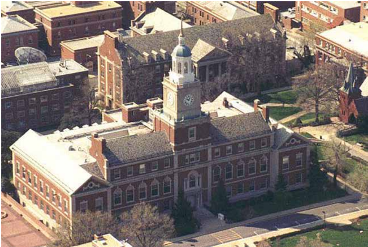
Aerial view of Founders Library, Howard University, Washington, D.C.

A portion of the Howard University campus is nationally significant as the setting for the institution's role in the legal establishment of racially desegregated public education and for its association with two nationally recognized leaders of that fight: Charles Hamilton Houston and Thurgood Marshall. Beginning in 1929, Howard Law School became an educational training ground for civil rights through the vision of Charles Hamilton Houston. This program produced activist black lawyers dedicated to securing the civil rights of all people of color and, in 1936, established the first course in civil rights law. Thereafter, lawyer Thurgood Marshall, of the National Association for the Advancement of Colored People (NAACP) Legal Defense Fund (LDF), led the organization's strategy to desegregate schools leading up to the Brown v. Board of Education case. In this case, the U.S. Supreme Court declared school segregation unconstitutional.