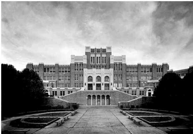
Little Rock Central High School (Courtesy of Tod Swiecichowski).

Central High School stands as the first test of national resolve under the Eisenhower administration to enforce black civil rights in the face of massive southern defiance during the period following the 1954 Brown v. Board of Education decision. On September 25, a day after President Eisenhower issued Executive Order 10730, the “Little Rock Nine” marched into Little Rock High School under the protection of federal troops and the Arkansas National Guard. The President upheld the stipulations in the Fourteenth Amendment as the nine students desegregated Little Rock High School despite the need for federal intervention. Little Rock Central High School was designated a National Historic Landmark on May 20, 1982 and thereafter as a National Historic Site on November 6, 1998.