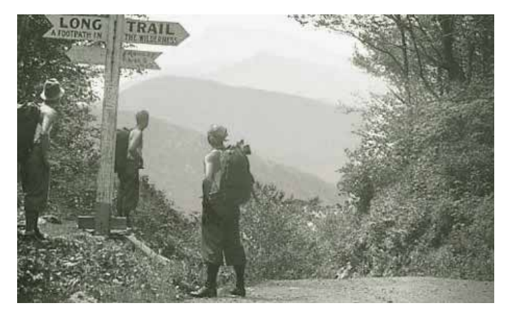
Built by the Green Mountain Club between 1910 and 1930, the Long Trail follows the main ridge of the Green Mountains from the Massachusetts-Vermont line to the Canadian border as it crosses Vermont's highest peaks.

In 2001, there was one last chance to secure 3764 acres along the northern corridor of Vermont's Long Trail. Two attempts in the 1990s to acquire the Black Falls Basin had failed—the second time when Land and Water Conservation Funds were unavailable. Drawing on more than 20 public and private funding sources, including the Vermont Department of Forests, Parks and Recreation, the Green Mountain Club completed the largest single land acquisition it had ever undertaken. The acquisition protected a wilderness experience for Long Trail hikers and important wildlife habitat.