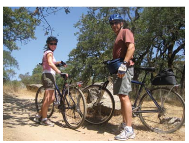
Santa Rosa, California: Annadel State Park

Protecting Parks Forever: Finally, beyond the program's direct assistance to develop and enhance facilities, every assisted site is protected against conversion to non-recreation use to ensure the federal and state/local investment remains available, not just for today's citizens, but for all future generations of Americans. In FY 2009, LWCF stewardship protection was expanded by a total of 26,265 acres and 81 park sites.