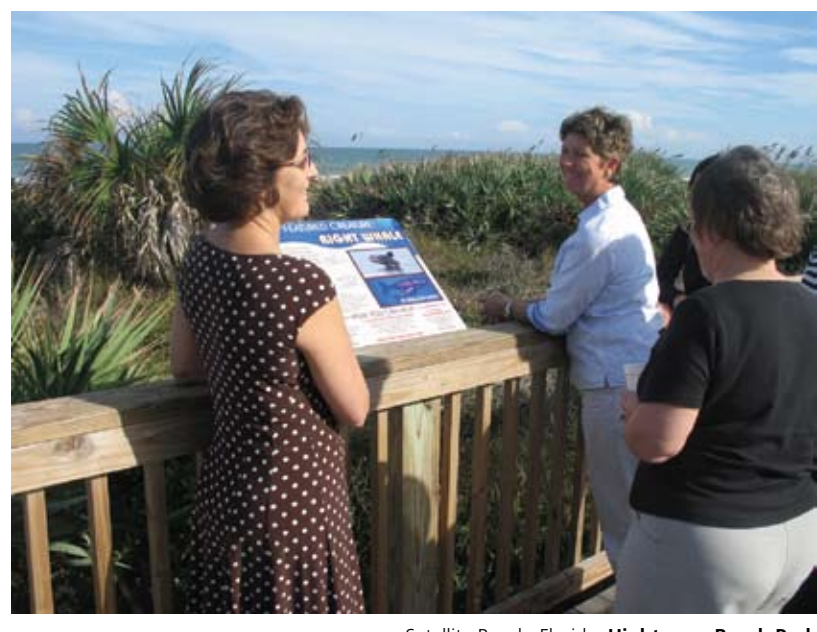
Satellite Beach, Florida: Hightower Beach Park

With natural areas becoming increasingly rare along Florida's urbanized Atlantic