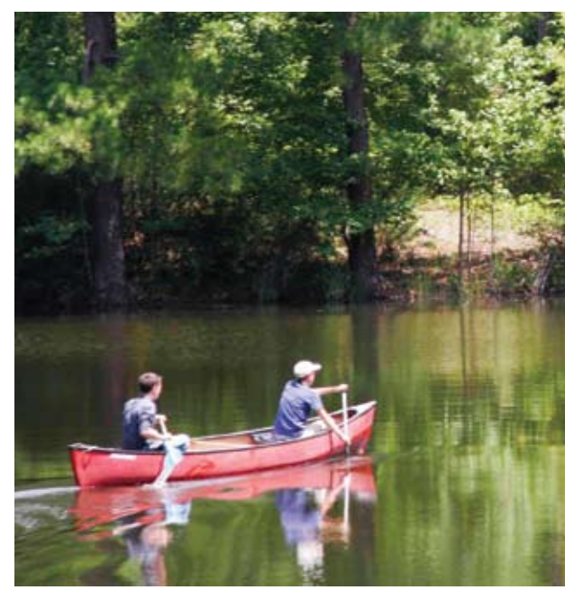
Downsville, Louisiana: Bryan Park

WASHINGTON Washington's estimated unmet need of $227.4 million represents a diverse portfolio of outdoor recreation projects, including acquisition, new construction, and the renovation of aging recreational sites. Among the top-ranked unfunded LWCF projects from 2009 are trail development and public access-related improvements (gates, parking, picnic sites and signs) in Oakland Bay County Park. The County has developed partnerships with several community interest groups to complete this project. Another public access project in King County will develop a whitewater staging area, river access trails, and amenities along the Middle Fork of the Snoqualmie River at the 40-acre Tanner Landing Park. The site is important because the Middle Fork provides prime whitewater kayaking, rafting, and canoeing opportunities near an urban area.