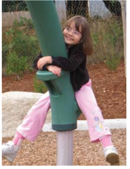
Bremerton, Washington: Blueberry Park

a series of state of the art facility and recreation upgrades that demonstrate low impact design. Green design elements include permeable pavement, rain gardens, green roofs, ecoturf and wetland restoration.