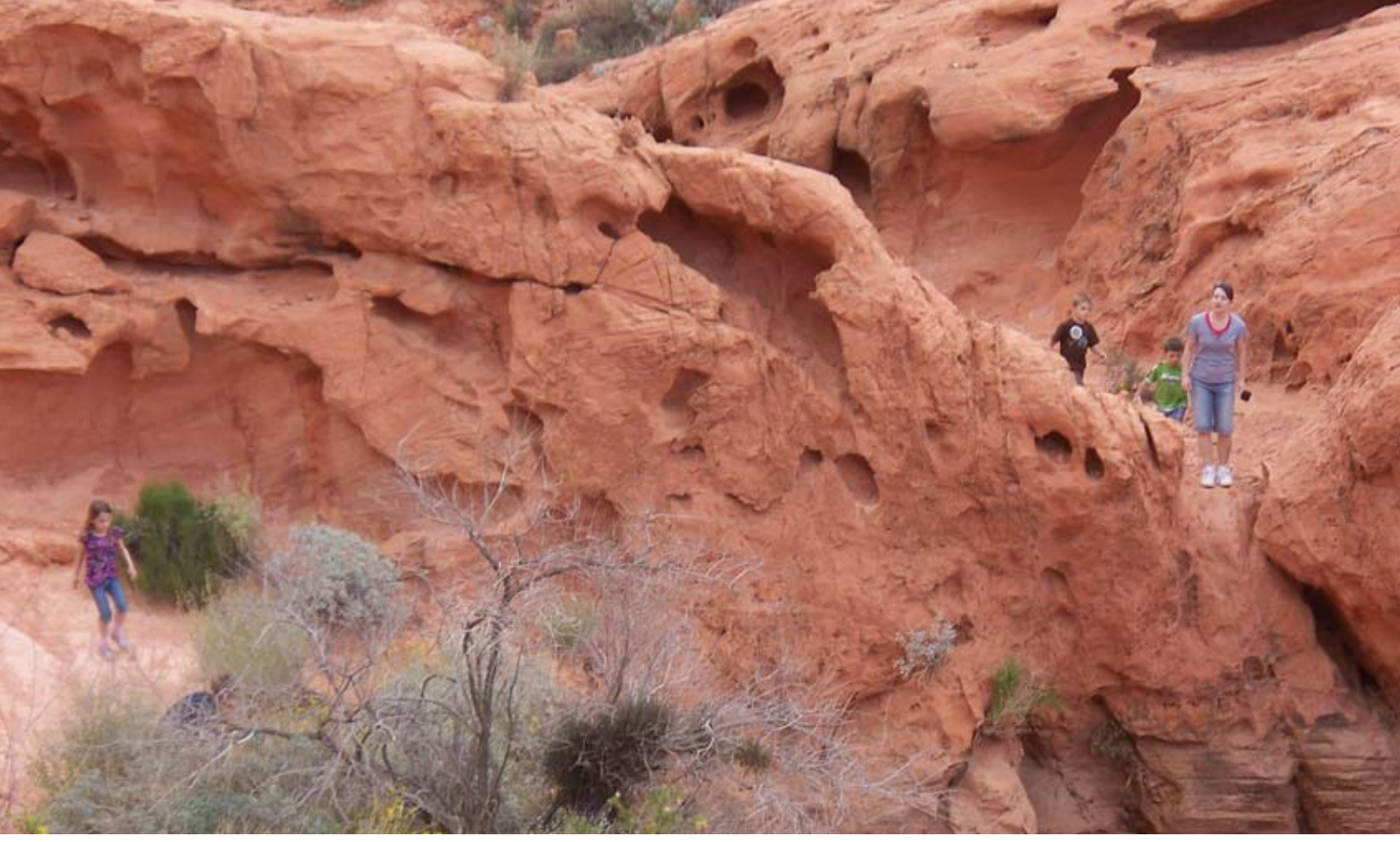
Overton, Nevada: Valley of Fire State Park