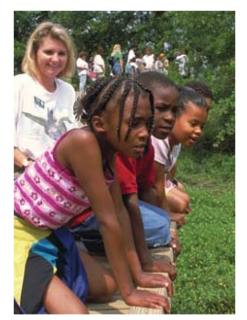
Augusta, Georgia: Phinizy Swamp Nature Park