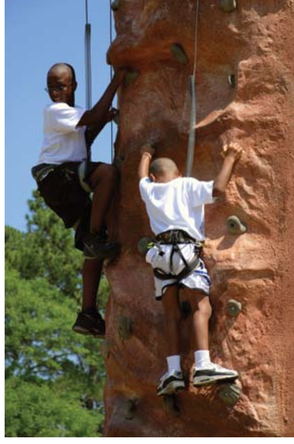
Rockdale County, Georgia: Climbing Demonstration

In 2009, the State of Georgia was selected to receive the first joint NPS/NARRP SCORP Excellence Award for demonstrating the State's solid vision and strategic plan for establishing and protecting places for public outdoor recreation. Oregon, Virginia and Wisconsin were also recognized for their exceptional efforts. The award was presented by NPS and NARRP during NARRP's annual conference in Pittsburgh in April 2009. All four plans deserve consideration by planners in other states charged with providing and protecting public outdoor recreation places and opportunities.