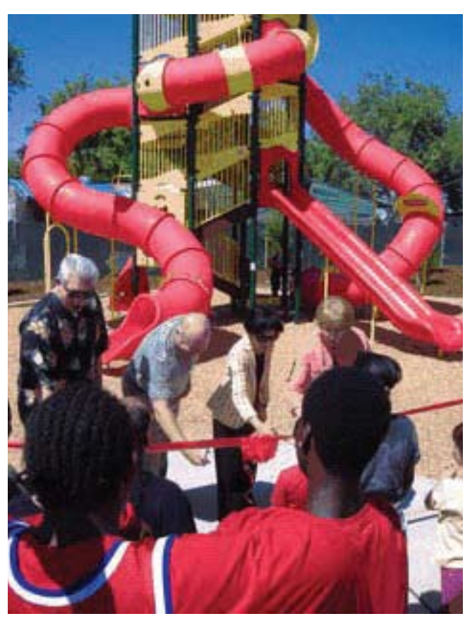
Sacramento, California: Congresswoman Doris Matsui (center) helps celebrate the opening of Five Star Park