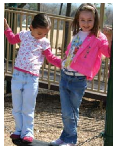
Greenville, South Carolina: Herdklotz Park

Over the past 15 years, LWCF has supported several projects in this region, including a facility development grant at Caesars Head State Park and two land acquisition grants to expand the park and, in 2008 to link it with Jones Gap. Another development grant funded park enhancements at Herdklotz Park in Greenville.