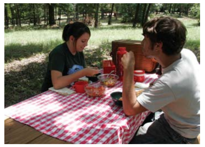
Downsville, Louisiana: Brvan Park

Over the last four years LWCF has provided critical funding assistance as we work to restore damaged outdoor recreational facilities and to provide for the needs of Louisiana's citizens and visitors.