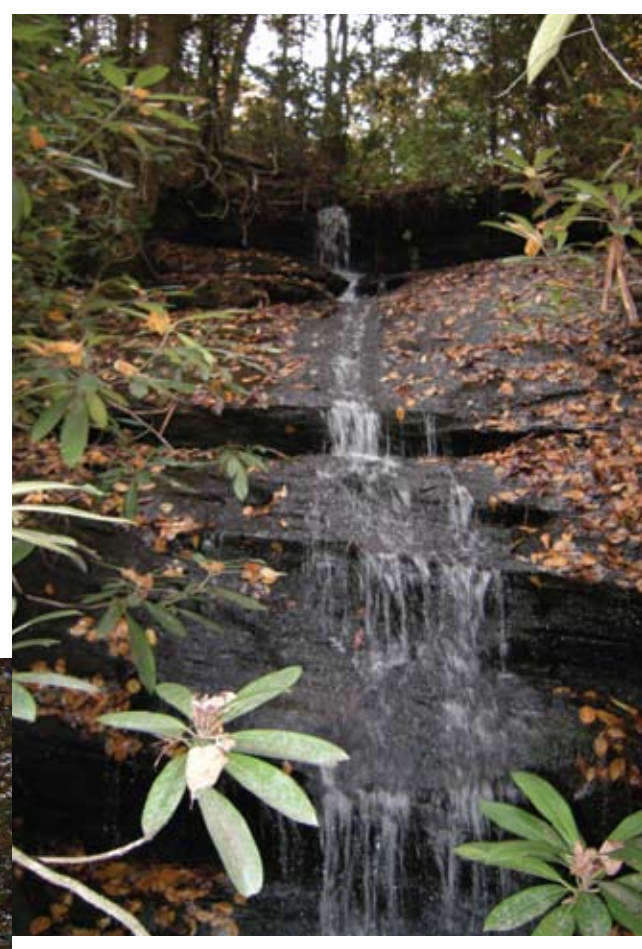
Greenville County, South Carolina: Mountain Bridge Wilderness Area, Blue Wall Connection Acquisition