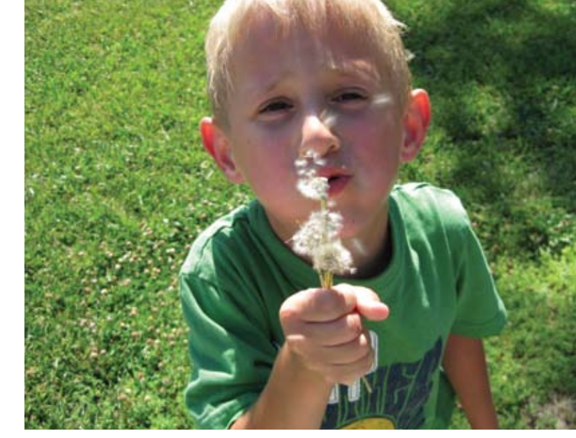
Fallon, Nevada: Laura Mills Park