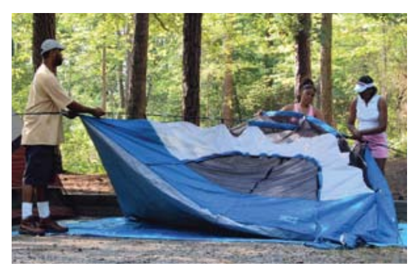
Winder, Georgia: Fort Yargo State Park

LWCF-assisted parks touch the lives of people living in 98% of U.S. counties. This year LWCF supported the creation of brand new parks in 17 communities, several of which are described below.