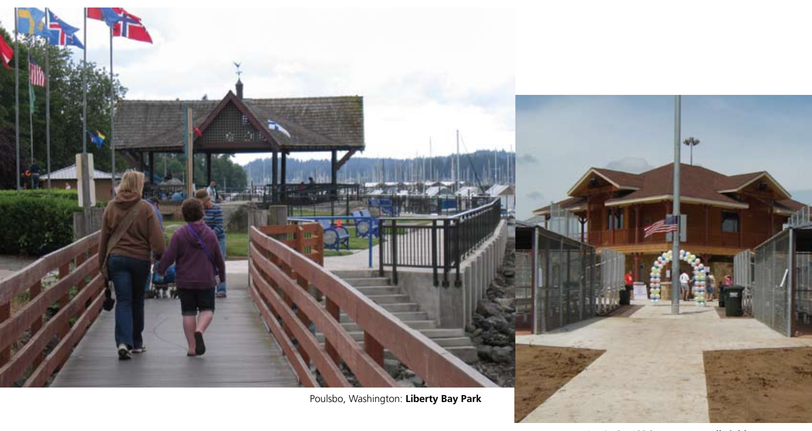
Seminole, Oklahoma: New Ball Fields

Poulsbo, Washington: Liberty Bay Park Then and Now—in 1974, LWCF supported the park's initial construction. A new grant in 2007 funded shoreline trail improvements, landscaping and benches.