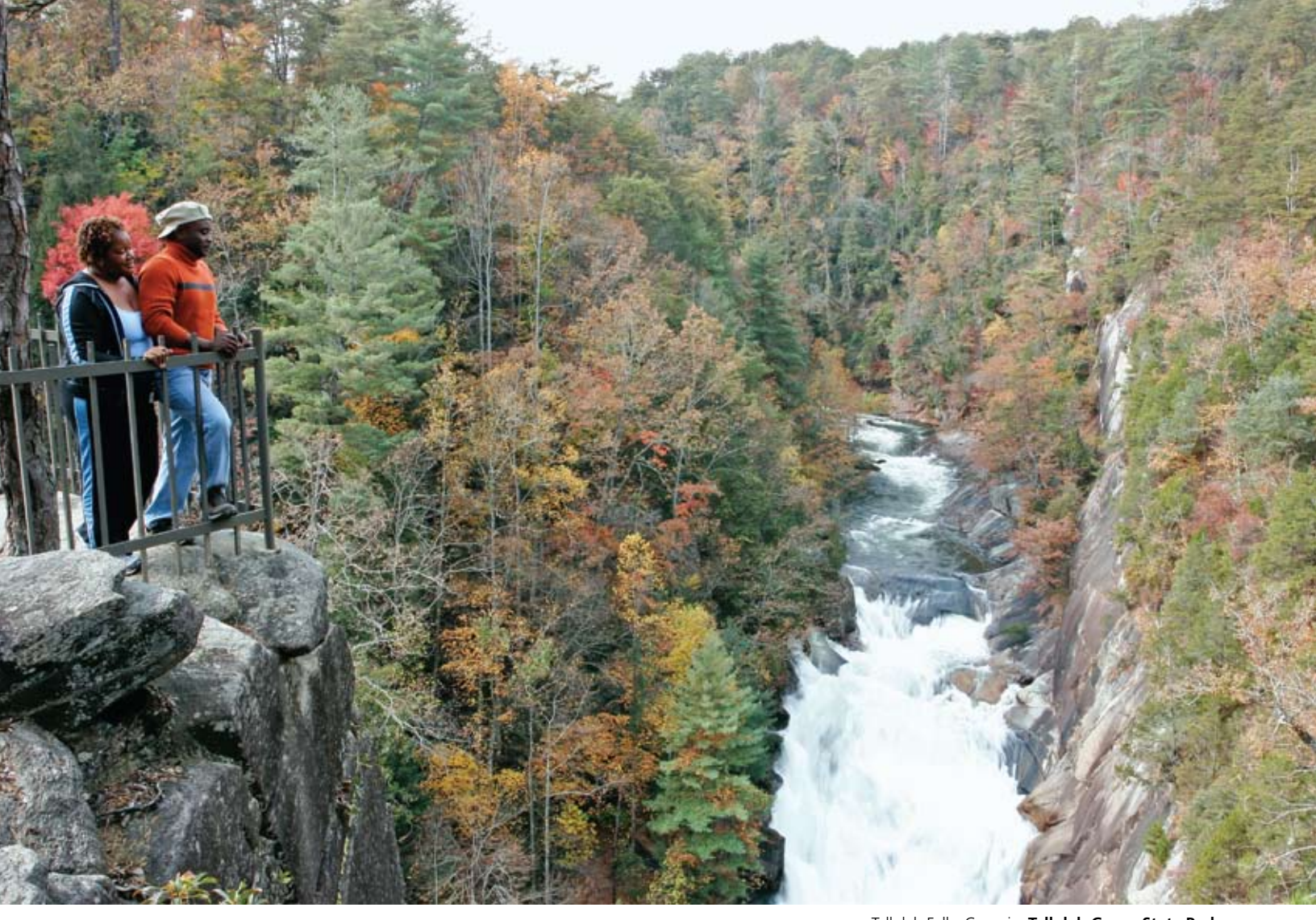
Tallulah Falls, Georgia: Tallulah Gorge State Park

Georgia is honored to receive the inaugural award for planning excellence for our SCORP. The ultimate declaration of our SCORP is that Georgia is at a critical crossroad. The preservation of our state's priceless natural resources and the provision of accessible and affordable public outdoor recreation opportunities are now, more than ever, important responsibilities that we — as a state and as a society must forthrightly address.