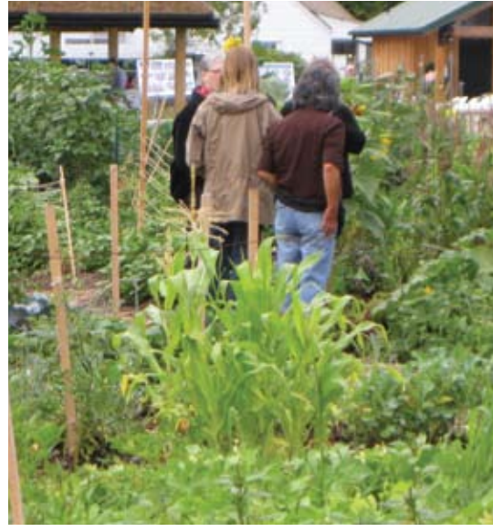
Bremerton, Washington: Blueberry Park