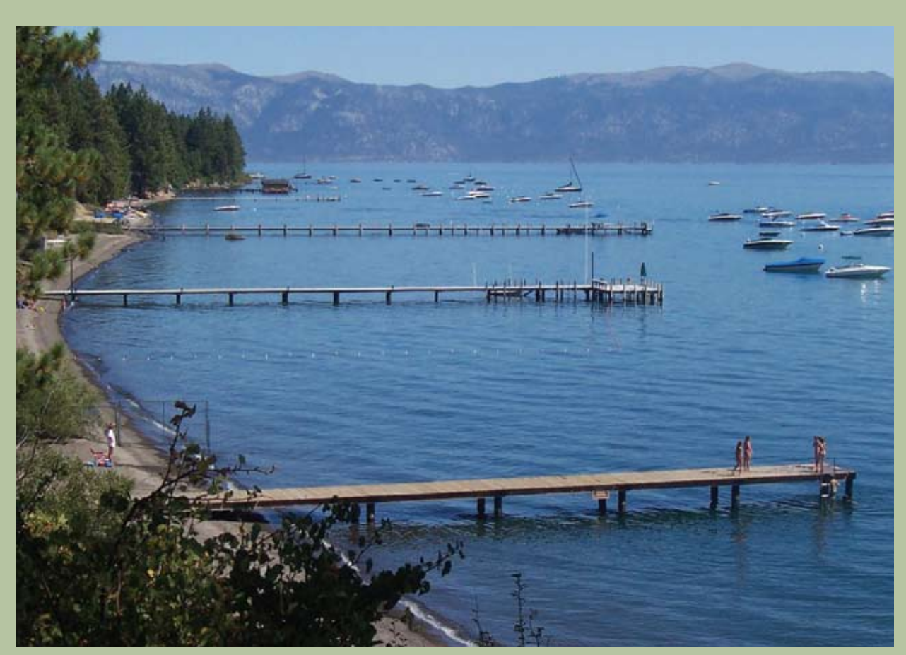
Tahoe City, California: Skylandia Park