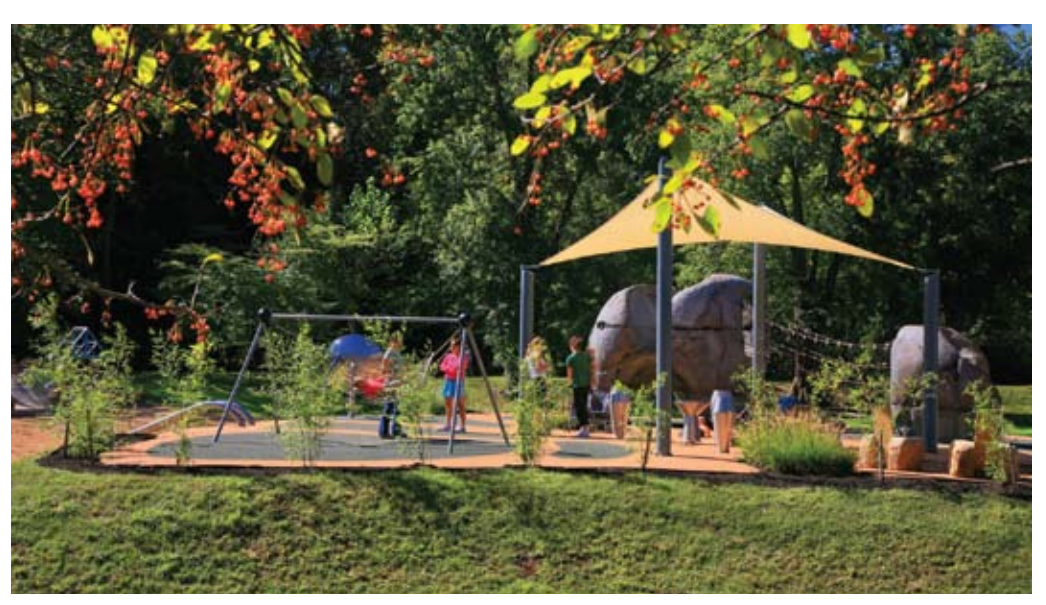
Huntington, West Virginia: Ritter Park

A state may not be represented in the above park list – an occurrence due most frequently to a decision to combine its apportionment from successive years in order to have sufficient funds for a desired project(s). States have three years to obligate funds to new projects once made available to them.