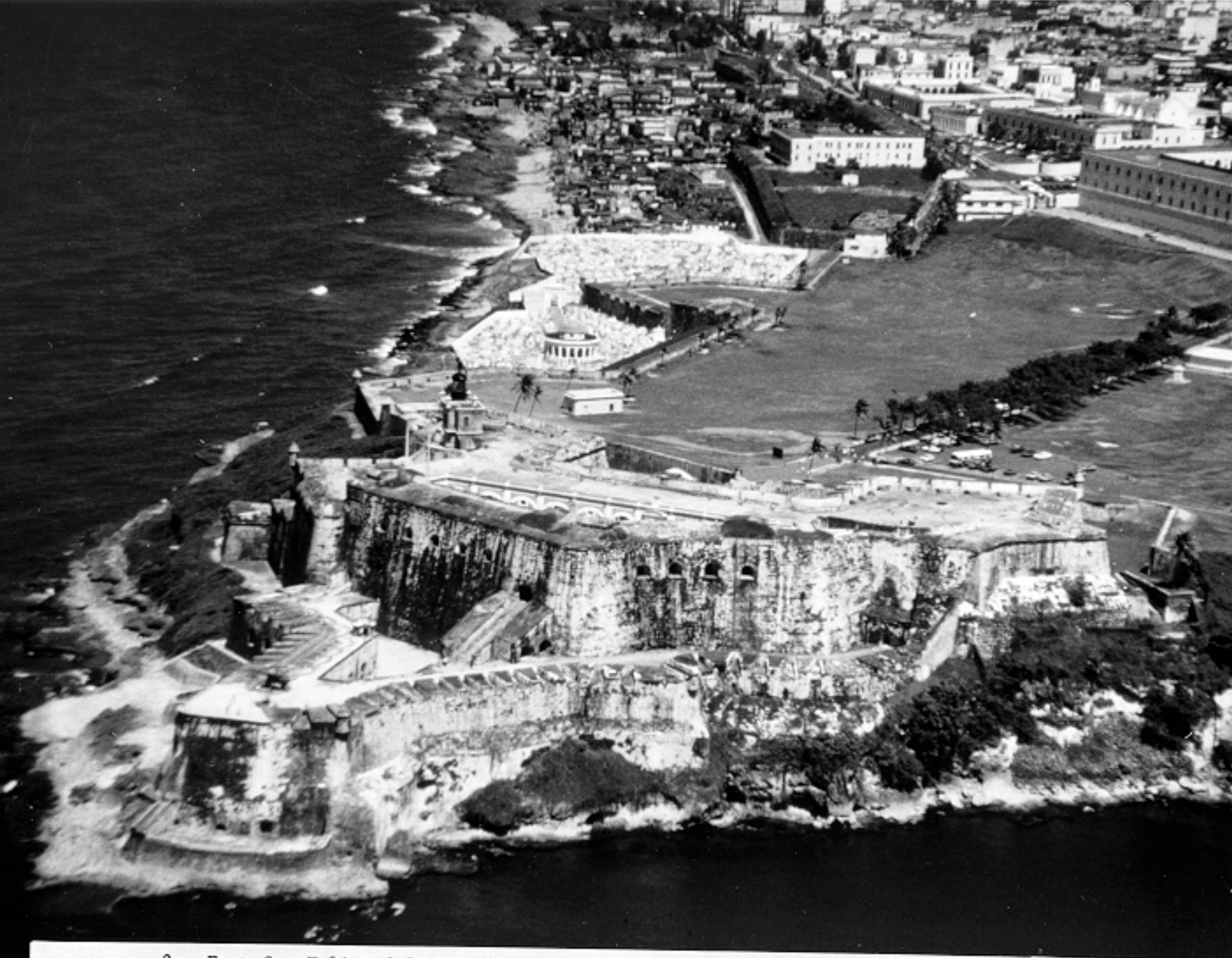
Fort San Felipe del Morro from above the mouth of San Juan Harbor, facing east.