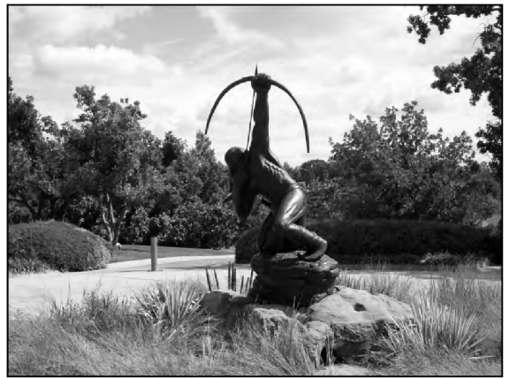
Thomas Gilcrease Estate, HALS OK-25