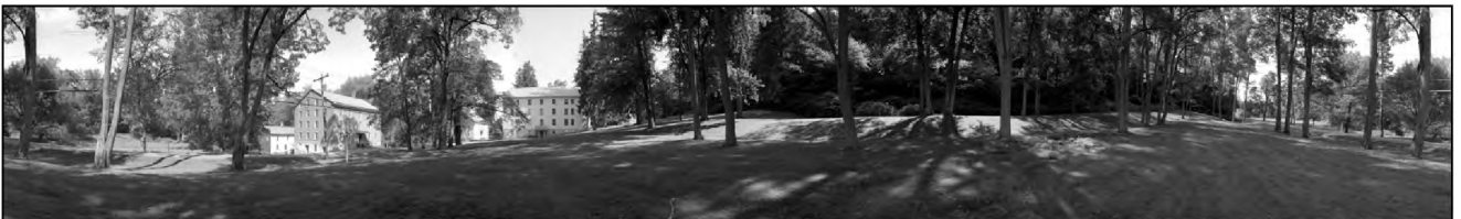
North Family, Mount Lebanon Shaker Village, HALS NY-7

www.facebook.com/HeritageDocumentationPrograms