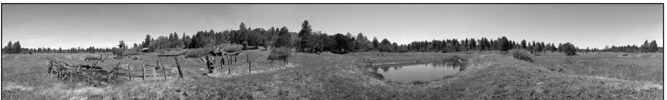
Pine Ranch, Grand Canyon-Parashant National Monument, HALS AZ-4

Throughout the documentation process, please consult with your Chapter HALS Liaison. A spreadsheet of HALS Liaisons is provided on the ASLA HALS webpage www.asla.org/ContentDetail.aspx?id=37488 , and the ASLA HALS webpage https://www.asla.org/ContentDetail.aspx?id=3938 provides more information about HALS Liaisons, the HALS Coordinator, and the HALS Subcommittee from which the Coordinator is chosen.