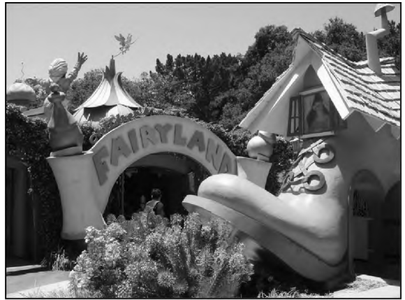
Children's Fairyland, HALS CA-19

I encourage everyone to prepare HALS documentation for sites in your community or state. Since 2004, I've been actively engaged in doing HALS documentation. What I most enjoy is getting up on a Saturday morning, picking a site to visit in my community, packing a picnic lunch, and off we go. I record my notes and photograph the site, then on Sunday do some research, and write up a short form. I find this greatly enhances my experience of the site and it feels good to know I am contributing to a permanent record of our nation's cultural landscape heritage. I encourage everyone to take the challenge and document a site in your community or state - it can be great fun and very satisfying. One way to get started is by preparing an inventory of sites, potential candidates for HALS documentation in your state or region.