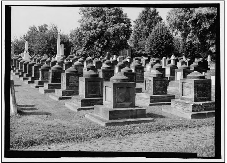
Congressional Cemetery, HALS DC-1-10

Archival standards for the basic durability performance of photographic materials for HALS documentation materials are 500 years. Large format black and white photography when processed to archival standards is believed to meet this standard, while color photography does not. Small and medium format photography is maintained in the HALS collections as part of the field records. The HALS office reserves the right to refuse documentation that does not meet archival requirements for photographic materials. Digital large-format photography is not accepted at this time. Completed Release and Assignment Form(s) must accompany all donated HALS photographs.