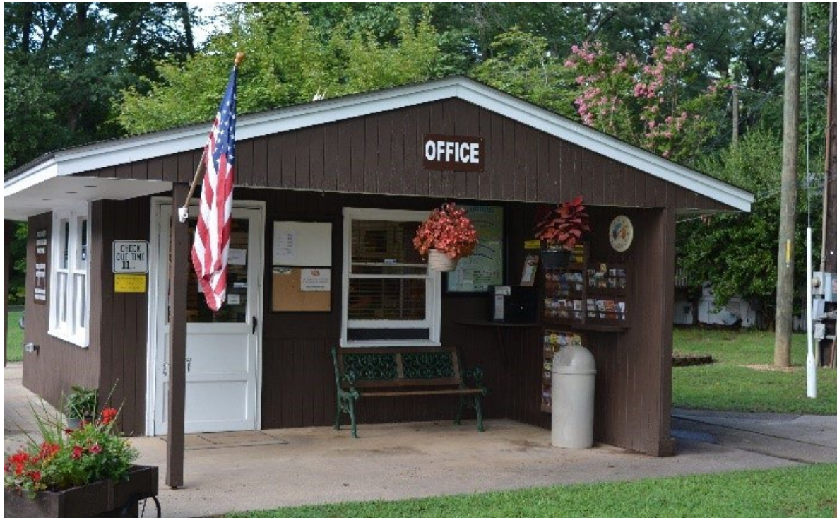
Pictured: Prince William Forest Park RV Campground Office