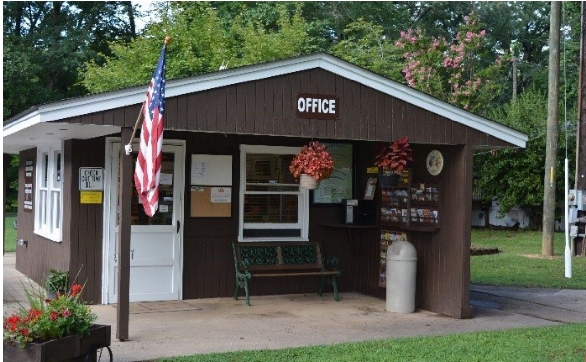
Pictured: Prince William Forest Park RV Campground Office