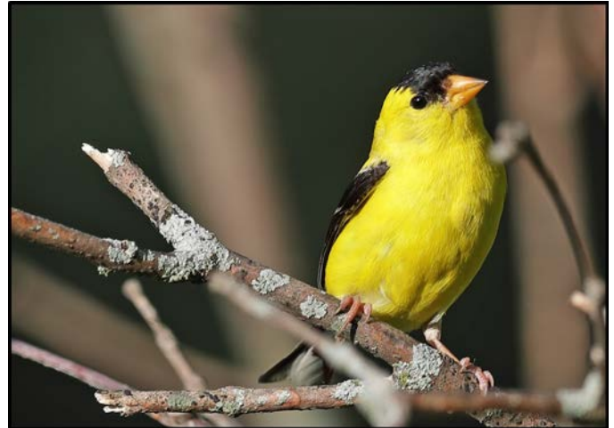
Figure 2. Although currently found at the Parkway, suitable climate for the American Goldfinch ( Spinus tristis ) may cease to occur here in summer by 2050, potentially resulting in local seasonal extirpation.

Parkway may serve as an important refuge for 15 of these climate-sensitive species, 8 might be extirpated from the Parkway in at least one season by 2050.