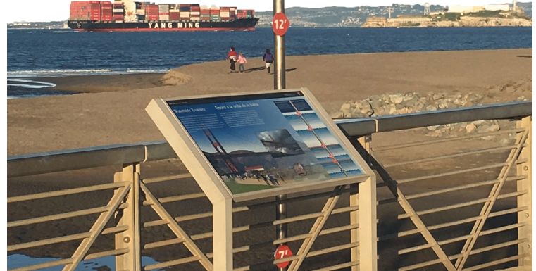
Wayside exhibits recently installed at Golden Gate National Recreation Area are part of a service-wide project to interpret sea level rise. The waysides incorporate novel elements that help visitors visualize what projected levels of rise might mean to park areas.