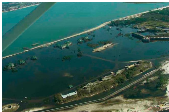
Gulf Island National Sea Shore's Historic District flooding after Hurricane Ivan.

The analyses highlighted how the effects of climate change vary across the country. Many parks in the western US are at risk due to a small number of potentially transformative high-impact climate change factors, like wildfire. In contrast, many parks in the (inland) eastern US are at high risk because climate change may exacerbate existing challenges, such as poor air quality and restricted habitats. These results emphasize the role of climate change as a “threat multiplier.” Coastal parks in the southeastern U.S. are much more vulnerable to sea level rise than coastal parks on the west coast. Additionally, we found that many eastern parks have limited adaptive capacity because of intensive human land use that decreases ecological connectivity surrounding parks.