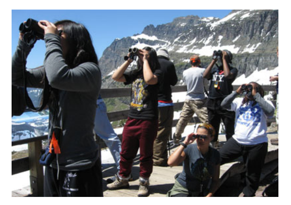
Climate Change Ambassadors Survey for Goats

The complete article on InsideNPS at: http://inside.nps.gov/index.cfm?handler=viewnpsnewsarticle&type=Announcements&id=9357