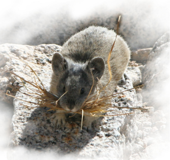
American Pika, NPS photo.

conditions. The study's hypothesis does not imply that climatic shifts will result in more restricted ranges but rather that some species could be unaffected or even benefit from climate shifts. It is just as likely, however, that some species will suffer adverse effects, as their distribution and behavior reflect adaptations to currently favorable habitat.Contact: Scott Gediman@nps.gov, Or Niki_Nicholas@nps.gov