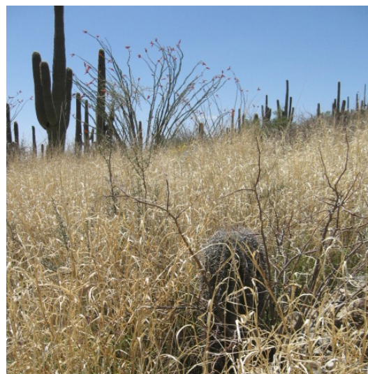
The native Saguaro Cacti is being choked out by invasive Buffelgrass.

On February 6th, Saguaro National Park participated in the annual Beat Back Buffelgrass Day. This event is a joint effort between park staff and hundreds of volunteers who remove thousands of Buffelgrass plants within the park and other public lands. Saguaro National Park was identified as one of 50 National Parks in peril due to threats of climate change (Rocky Mountain Climate Change Organization and Natural Resources Defense Council 2009) because of the threat of invasive buffelgrass. Buffelgrass, an introduced African grass threatens the icon species, the saguaro, directly by competition for resources and crowding out of native plant species. But more detrimental to the saguaro and Sonoran Desert ecosystem is fire; many of the Sonoran Desert species did not evolve with fire and will die as a result of burning. Buffelgrass fuels hotter, more intense and more frequent fires than historically known. Contact: Dana_Backer@nps.gov