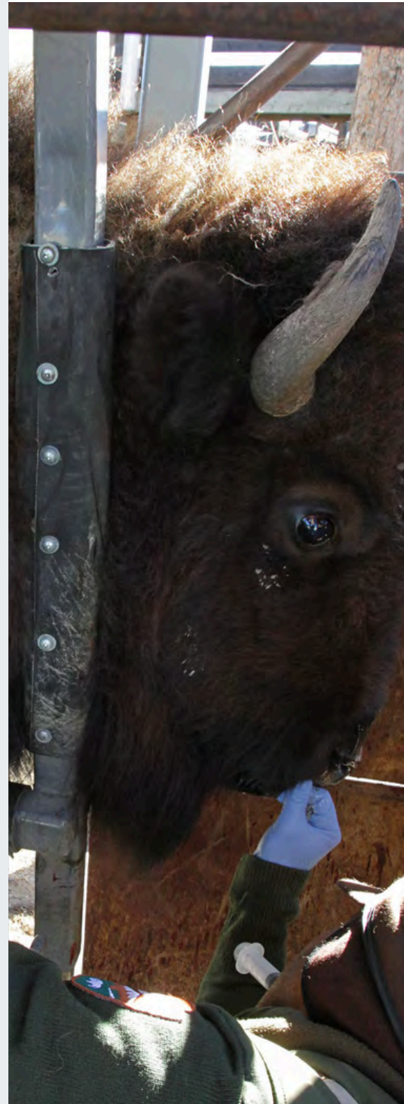
NPS staff aging bison by tooth eruption

Resourcefulness. Work in partnership to advance innovations and approaches that increase resources and capacity essential to the ecocultural restoration of bison. Creatively overcome organizational, informational, and capacity obstacles to bison stewardship by joining expertise and empowering others.