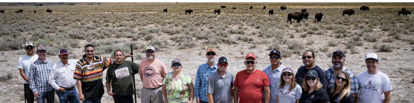
Bison shared stewardship coauthors and team on the Wind River Reservation

When you, our reader and our current or future partner, consider how you yourself can utilize this Strategy to promote ecocultural restoration of bison, please follow the buffalo's voice, and follow your hearts.