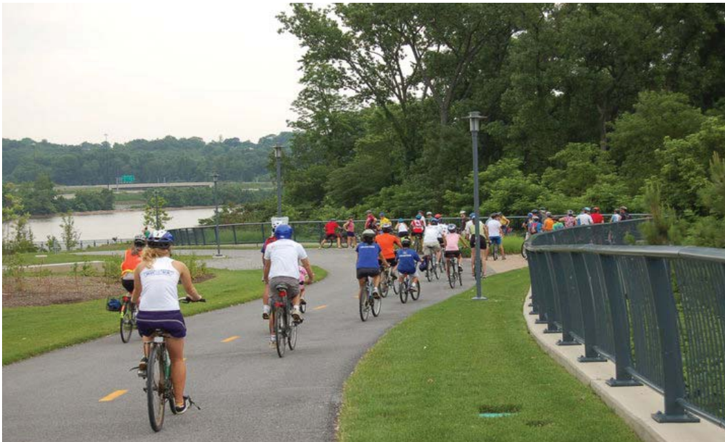
National Trails Day Bicycle Ride 2010