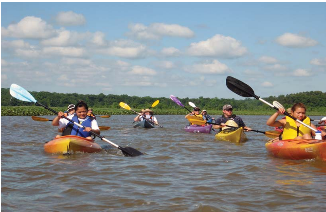
Patuxent River Sojourn

The father engages a volunteer interpreter in a discussion of the arms used by 19 th century soldiers, sailors and marines comparing them to weaponry and technology soldiers use today. The father wants to learn more about the battles of the War of 1812. He begins to plan future visits to nearby Fort McHenry, the Battle of Bladensburg Visitor Center south of Baltimore and Havre de Grace, north of the Heritage and Historic Trail Center.