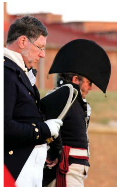
Fort McHenry National Monument and Historic Shrine

“The Chesapeake Campaign of 1814 is significant in and of itself and represents key turning points in American social and political history. The events of the invasion contributed to the preservation of a young nation and its Constitution.”