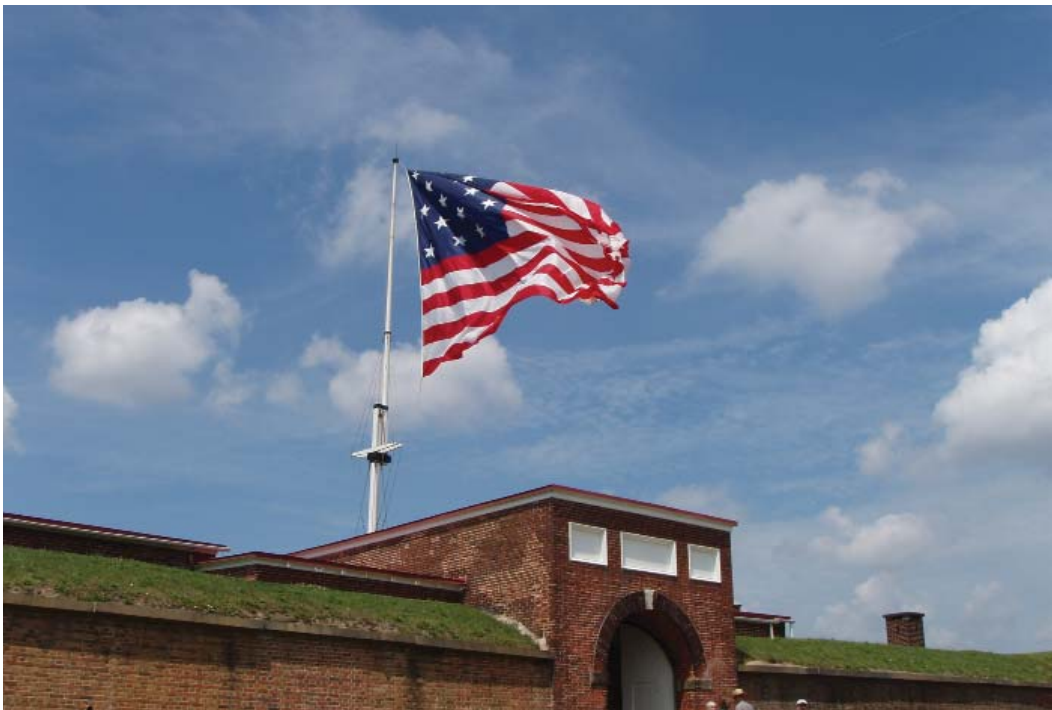
Fort McHenry National Monument and Historic Shrine (Donna Dickson)

Examining the economic and political significance of the Chesapeake region is an important complement to exploring the military events of the Chesapeake Campaign. Prior to the British blockades of 1813, the Chesapeake Bay played