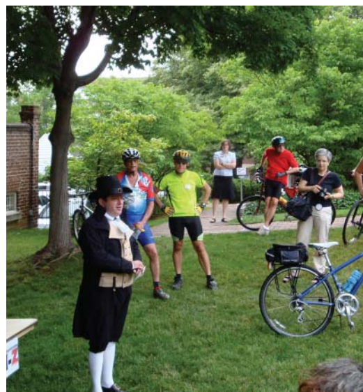
National Trails Day Bicycle Ride, Carlyle House, Alexandria, VA

The Commission is coordinating research, programming and activities throughout the state. A bicentennial kick-off event will be held at Montpelier in 2011. A War of 1812 symposium is planned for June 2014 at Fort Monroe featuring family-friendly events, educational seminars and re-enactments. Ongoing efforts in Virginia include securing 15 new historical markers with War of 1812 interpretation to complement 40 existing markers. For details, visit http://dls.state.va.us/1812.htm .