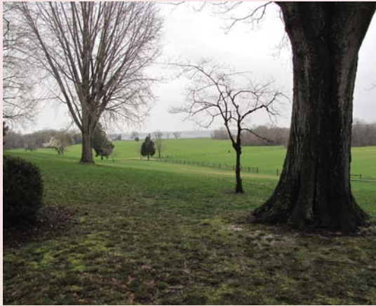
Historic St. Mary's City, MD

He likes the Star-Spangled Banner Geotrail because it has nearly 40 sites with geocaches not too far from his home in Baltimore. He shows his grandparents his passport for the Trail that he downloaded