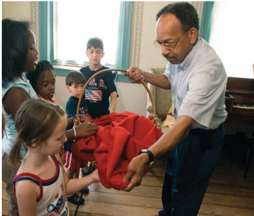
School Program, Flag House and Star-Spangled Banner Museum, Baltimore, MD

Many National Park Service units report that school groups represent more than 80% of their visitors on weekdays in mid-fall and mid-spring. At Fort McHenry National Monument and Historic Shrine, approximately 15% of its 570,000 visitors in fiscal year 2009 were school groups.