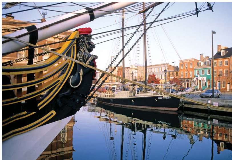
Fell's Point, Baltimore, MD