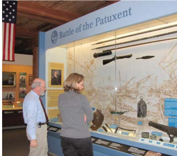
Calvert Marine Museum, Solomons, MD