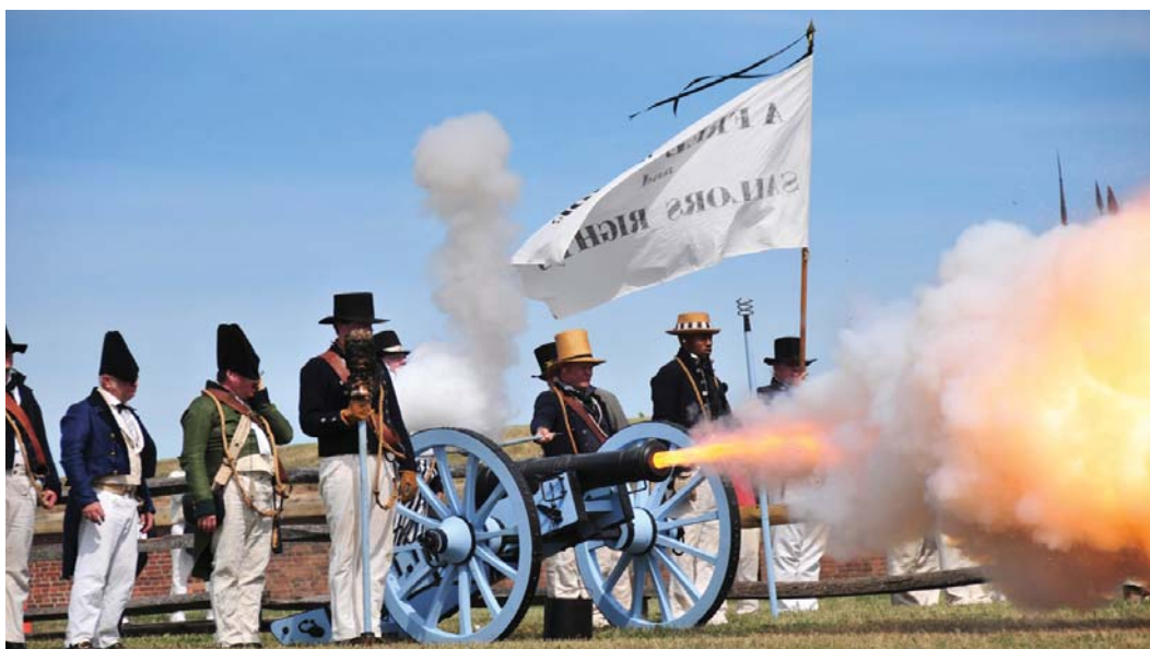
Fort McHenry National Monument and Historic Shrine (Dietrich Ruehlman)

The plan also identifies property acquisition, construction and other improvements needed to create and enhance the visitor experience along water portions of the Trail. Assessment criteria will include historic integrity and site significance, interpretive and visitor experience potential, anticipated visitation, ease of access, proximity and connectivity to other sites, development feasibility, investment needed to improve the site, and stewardship needs and opportunities. The plan will serve as a framework for water trail investments over the next five years.