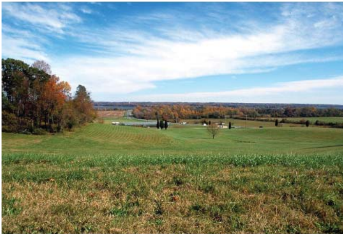
Serenity Farm, Benedict, MD

This national historic trail offers parks, historic sites, heritage areas, tourism bureaus, educators, conservation organizations, communities and private