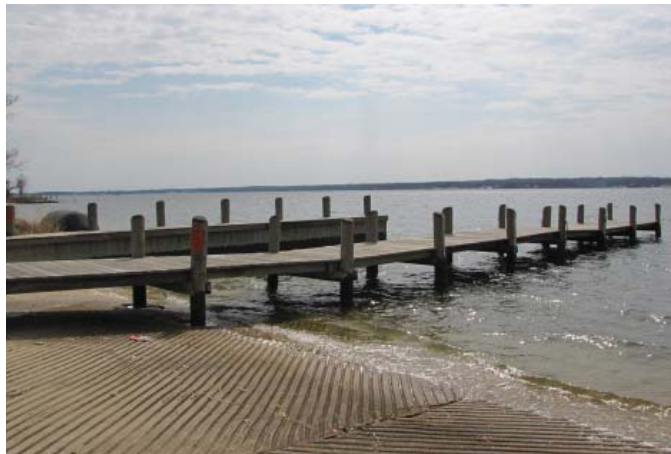
Public Boat Launch, Solomons Island, MD

Operation Sail, Inc. (OpSail) and the U.S. Navy will bring tall ships and naval vessels to five ports from May to July 2012 to kick-off the bicentennial celebration. The Parade of Tall Ships will visit Baltimore, MD and Norfolk, VA. Local Trail partners will likely see increased visitation as more than 1.5 million people gathered in Baltimore for OpSail 2000, a similar event. Media attention generated by these large scale maritime festivals will raise awareness nationally of the War of 1812 bicentennial. The Navy has earmarked funding for educational initiatives related to naval involvement in the War of 1812.