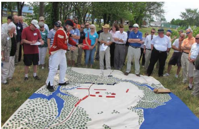
Maryland War of 1812 Bicentennial Commission, Star-Spangled 200 Baltimore County Tour, North Point, 2010

Interpretation is telling a story. It is a communication process designed to reveal underlying meanings to visitors through immersive, first-hand involvement with objects, features, landscapes or authentic places. Interpretation helps people to