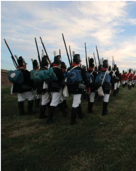
Soldiers in Formation, Fort McHenry National Monument and Shrine