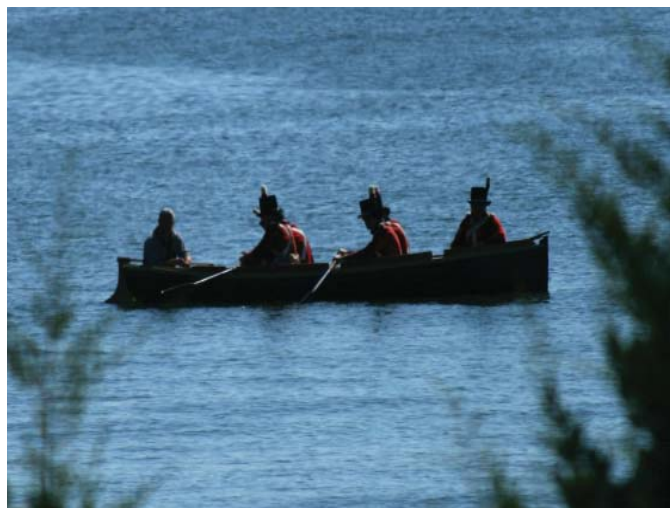
War of 1812 Reenactment, Jefferson Patterson Park and Museum

However, Americans were emboldened by the fact that the British were also embroiled in the Napoleonic Wars, spanning from 1803 to 1815 in Europe. The United State's Declaration of War made it necessary for British troops, supplies and funds to be diverted from that conflict with the French to defend their interests in Canada. Britain saw America as an important market and