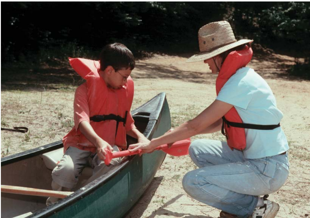
Canoeing Lesson, Sotterley Plantation, Hollywood, MD