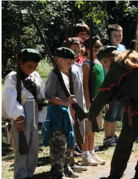
Defenders Day 2010, North Point, Baltimore County, MD