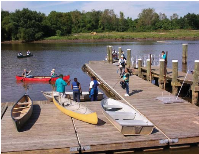
Bladensburg Waterfront Park, Bladensburg, MD

Within this diverse population of potential visitors, several distinct audiences for the Trail can be identified based on historical tourism patterns and projections, demographic trends, and the unique cultural and historical resources of the Trail.