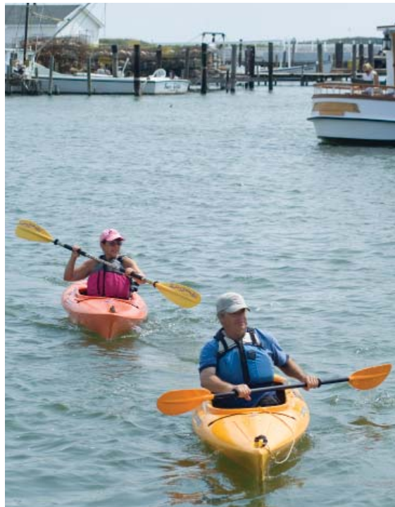
Kayakers off Tangier Island, VA (Starke Jett)

Significantly, until the 1968 law, the only federal role in trails was to build and maintain trails on federal lands. The 1968 Act provided for federal recognition and promotion of trails, including portions not on federal land, by providing financial assistance, supporting volunteer activities and coordinating with states and other authorities.