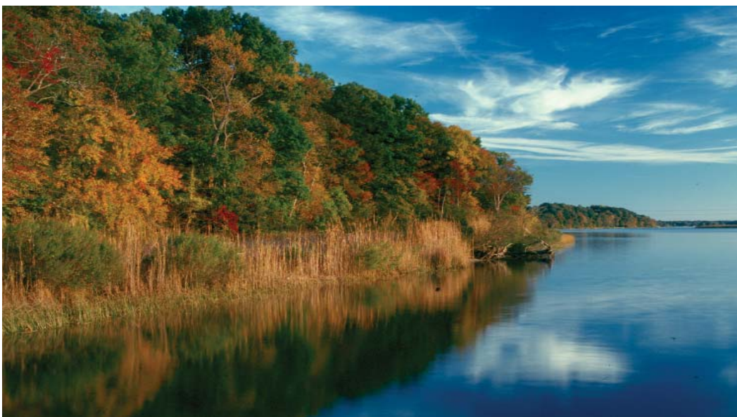
Kings Landing Park, Huntingtown, MD

Each partner's active involvement in implementing the ideas presented in this interpretive plan is vital to the success of the Trail's overall interpretive effort. The process of developing the Trail's interpretive program will be enriched as partners apply their experience and perspectives, local knowledge and specific opportunities associated with their individual sites or regions.