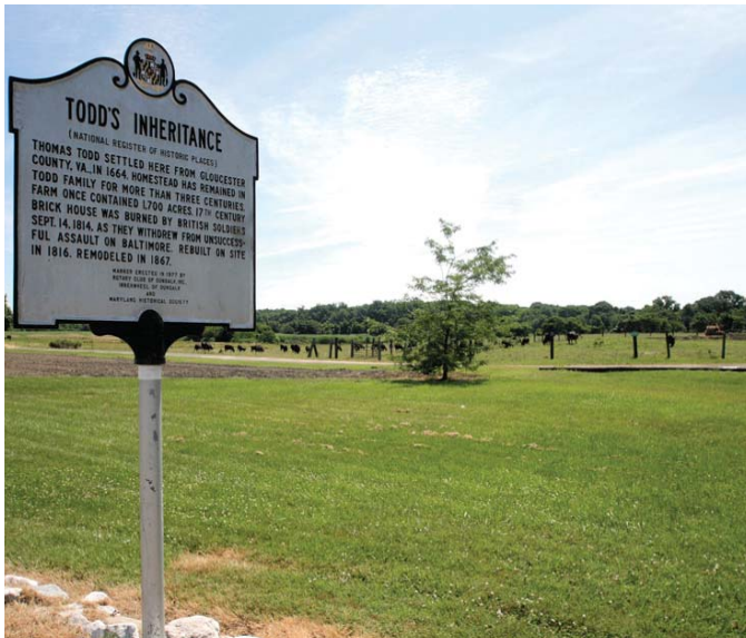
State of Maryland Historical Marker, Todd's Inheritance Historic Site, North Point, MD

are already cataloged. Research and data provided by Maryland and Virginia regarding water access for the Captain John Smith Chesapeake NHT will aid development of the Star-Spangled Banner Trail. For details, visit http://www.smithtrail.net .