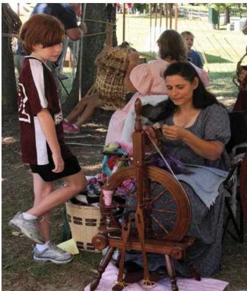
Jefferson-Patterson Park and Museum

Imagine many other positive visitor experiences like these along the Trail. The ultimate goal of interpretation is to connect a wide variety of visitors with well-crafted, unforgettable experiences knowing that even within the same family or group of friends, a canoeing adventure may appeal to some, while touring an historic home will inspire others. The Trail must effectively serve multiple audiences that have varied needs and interests.