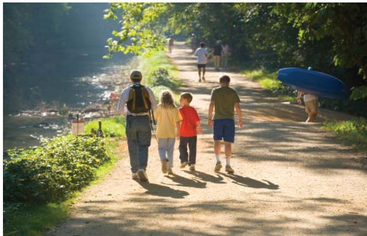
C & O Canal National Historical Park

The following draft purpose and significance statements aid in the development of the Trail's comprehensive management plan, and inform the Trail's primary interpretive themes. These purpose and significance statements and the primary themes will be further refined during the comprehensive management planning process.