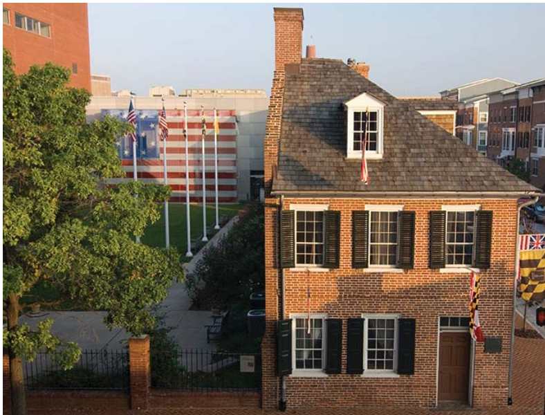
Flag House and Star-Spangled Banner Museum, Baltimore, MD

Importantly, the study found that cultural and heritage travelers spend an average of $994 per trip compared to $611 for all U.S. travelers.