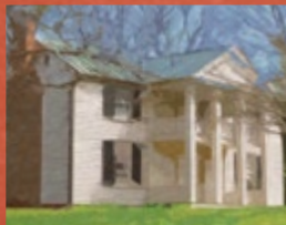
Sam Davis Home