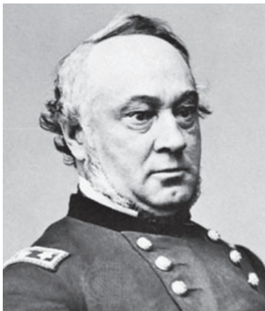
Maj. Gen. Henry W. Halleck

At its height, the Siege of Corinth would involve over 200,000 soldiers and an undetermined number of enslaved laborers. On the Northern side were Halleck’s three armies numbering some 120,000 soldiers under three capable major generals; the Army of the Tennessee under George H. Thomas; Don Carlos Buell’s Army of the Ohio, and the Army of the Mississippi commanded by John Pope. The Confederates, led by Gen. Pierre G.T. Beauregard, were composed of two armies, Braxton Bragg’s Army of the Mississippi, and the Army of the West under Earl Van Dorn. The Confederates numbered close to 75,000 on paper though sickness reduced the actual level closer to 53,000 effectives. In addition to the men in uniform, the Southerners utilized thousands of slaves