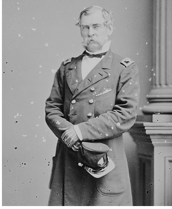
General Charles F. Smith

It was slow work and though folks on the home front may have chaffed at the delay, this was not so with the soldiers. “But to us boys who have to do the work,” stated a soldier from the 8th Wisconsin, “this master policy which obliges an enemy to surrender or evacuate, or fight against great advantage is rather agreeable. I think I can safely say that there is not a regiment in the whole Western army that really has much of a ‘hankering’ for another field of Shiloh.”