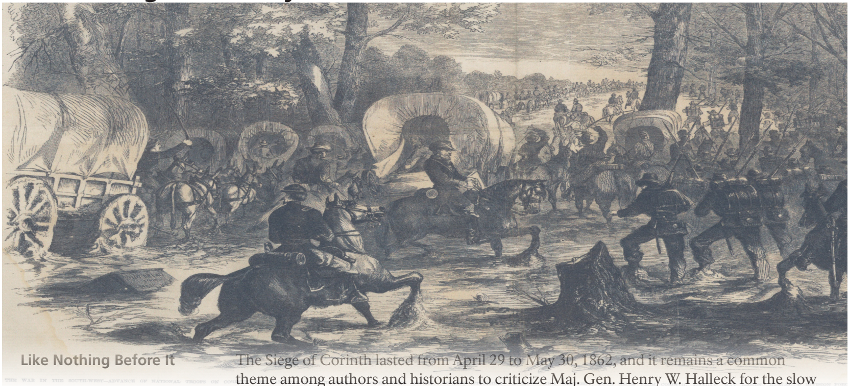
Like Nothing Before It

The Siege of Corinth lasted from April 29 to May 30, 1862, and it remains a common theme among authors and historians to criticize Maj. Gen. Henry W. Halleck for the slow pace of his advance which averaged less than a mile a day. While it is true, had Halleck pushed his infantry forward they would have been at the gates of Corinth within two days instead of thirty. But if his army was not immediately successful those same men would have faced starvation. It is an old military axiom; amateurs talk tactics, professionals talk logistics. Henry W. Halleck, who would gain the nickname “Old Brains” during the siege, was facing a task no other American military officer had ever faced; how to move three armies across a near-trackless wilderness during abominable weather and then face a strongly fortified city defended by a well-supplied foe. It was to be in the number of men engaged, the largest siege ever on the Western Hemisphere.