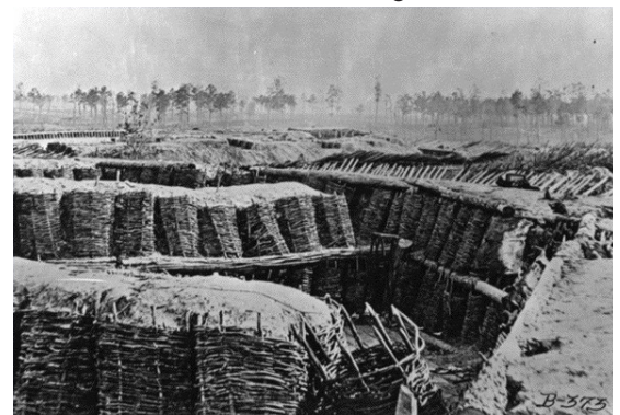
Use of gabions and fascines

Yet, with just a little imagination, one can envision how things would have appeared to those soldiers building, manning, and fighting in these works during the Civil War.