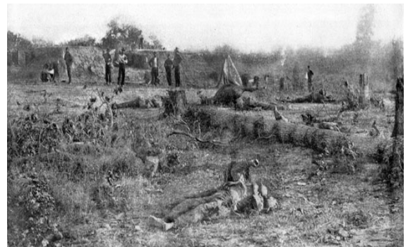
Battery Robinett shortly after the battle

Confederate attack against the bastion resulted in a hand to hand struggle for the position. The strength of Federal defensive fortifications proved effective against the Confederate assaults.