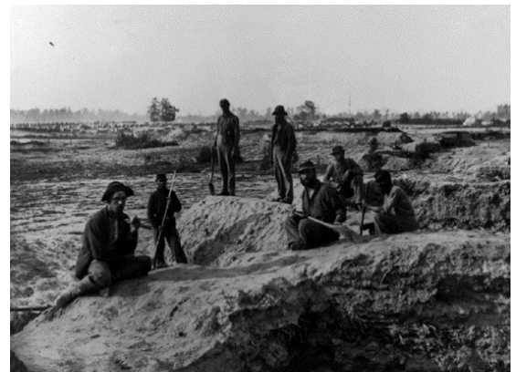
Soldiers constructing earthworks during the war

The men on the front lines found they could improve their chances for success, and more importantly, for survival, by digging in. Simple rifle pits could be dug by infantry soldiers in earnest, even under fire. These crude pits could be improved to form trenches with headlogs and ditches in front.