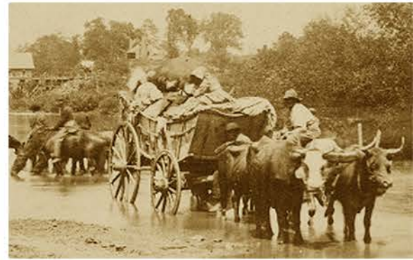
Contraband slaves fleeing Confederate forces in Virginia.

them, and placed them in charge of security at the newly organized contraband camp for the refugees on the northeast side of Corinth.