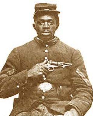
Nearly 200,000 African American soldiers and sailors served in the U.S. military during the Civil War.