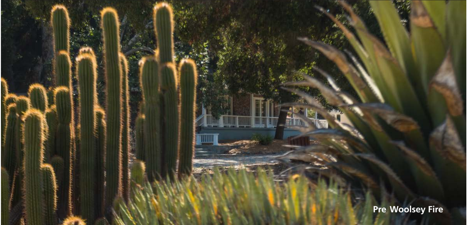
Pre Woolsey Fire

Santa Monica Mountains National Recreation Area