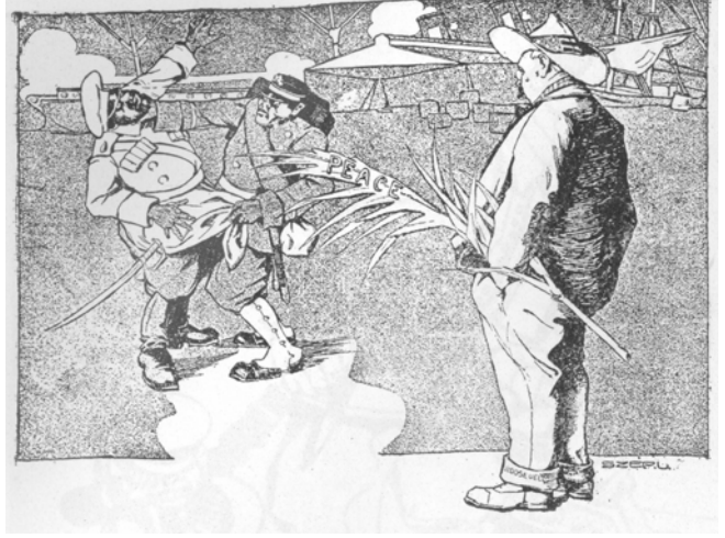
From the North American