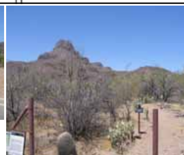
Park Access Point (Trailhead). Safford Peak is in the background.