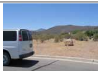
Parking at the south end of San Dune Pl. The trail starts to the right of the big boulder.