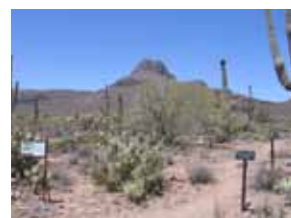
Below: Park Access Point (Trailhead) looking towards Safford Peak