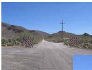
Left: Parking area looking towards Park Access Point.

Take Pima Farms Road west from Continental Reserve Loop to its end at Scenic Drive; turn left, go about 0.2 mile to a graded circle, just beyond the driveway of 8230. Park here, walk another 0.2 mile south to the Park Access Point.