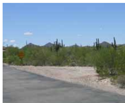
Parking for the Abington Road Trailhead. 32°18.685'N 111°05.790'W

3 Abington Road Access Go southwest on Abington Road. Past the South Belmont Trailhead (#2) at about 1.1 miles you will see a small turnout on your right with a "no outlet" sign. Park here, walk up the road about 0.2 mile to the Park Access and trailhead.