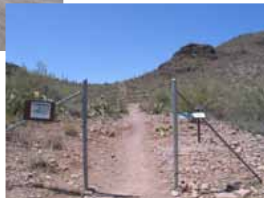
Right: Park Access Point (Trailhead)