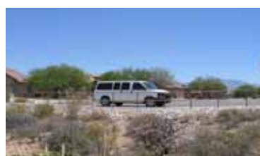
Above: Thelon Court parking, view from Park Boundary fence.

Take Pima Farms Road west to Sand Dune Place, turn south, go to end. Park in circle, do not block any driveways. Walk south on the trail from the large boulder along the fenceline. Stay on the trail; the areas east and west of the trail are private property. Park Access Point is about .37 miles south of the parking area.