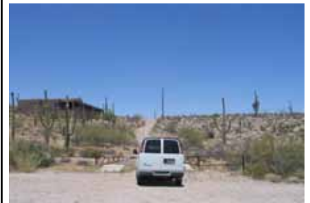
Trailhead parking for South Belmont Trail 32°18.930'N 111°05.366'W

2 South Belmont Access Go southwest on Abington Road off Belmont Road about 0.6 mile. On your right will be a pullout area, a gated dirt road, and a trail sign by Pima County Natural Resources Parks and Recreation. Park here, walk .11 mile up hill to Park Access Point. This is the southern end of the Belmont Trail.