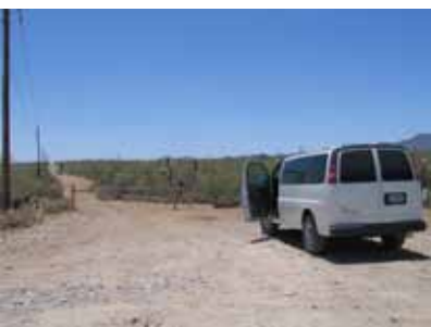
Parking for the north Belmont Trailhead. 32°19.389'N 111°05.768'W

1 North Belmont Access Go west about 1.2 miles on Belmont Road off Silverbell Road. You will see a gated road on your left. Park in the area in front of the gate. This gated road is the access road along the natural gas pipeline and power lines, and is the Belmont Trail.