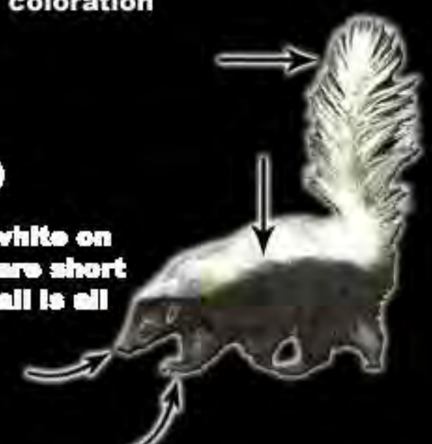
Hooded Skunk ( Mephitis macroura )

Body is colored solid black on bottom and solid white on top. Snout is long, hairless and flat-ended. Legs are short and thick with downward curving front claws. Tail is all white.