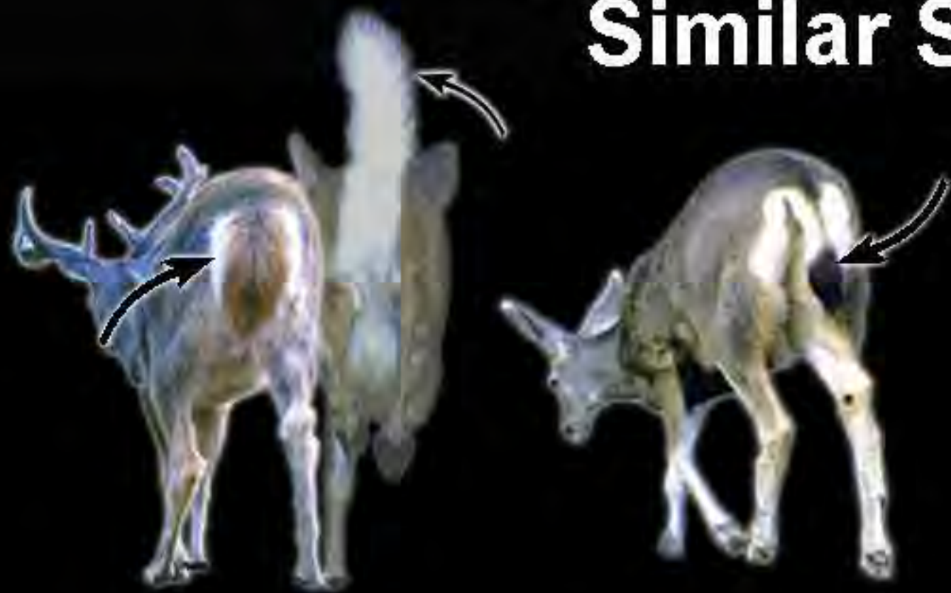
White-tailed Deer ( Odocoileus virginianus )

Tail is distinctly fluffy and white. Animals will "flag" when alarmed by raising tail in the air while fleeing. Antler points branch from a single main beam (Figure A). Metatarsal gland is short (Figure C). Generally found at higher elevations.