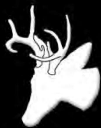
Figure A White-tailed Deer

Tail is thin and has a black tip. Antlers fork as they grow (Figure B). Metatarsal gland is long (Figure C). Dark mask may be present on face, coming to a point below the eyes. Generally found at lower elevations.