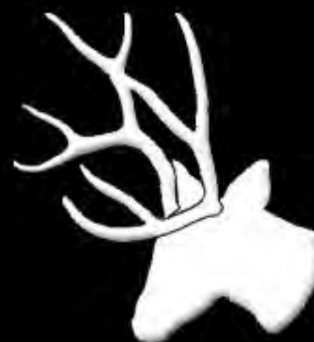
Figure B Mule Deer