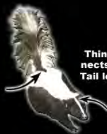
Striped Skunk ( Mephitis mephitis )

Thin white stripe present between ears and eyes. Stripe connects to a larger white stripe down back, which forks near tail. Tail length equal to or shorter than body length. Tail coloration variable.