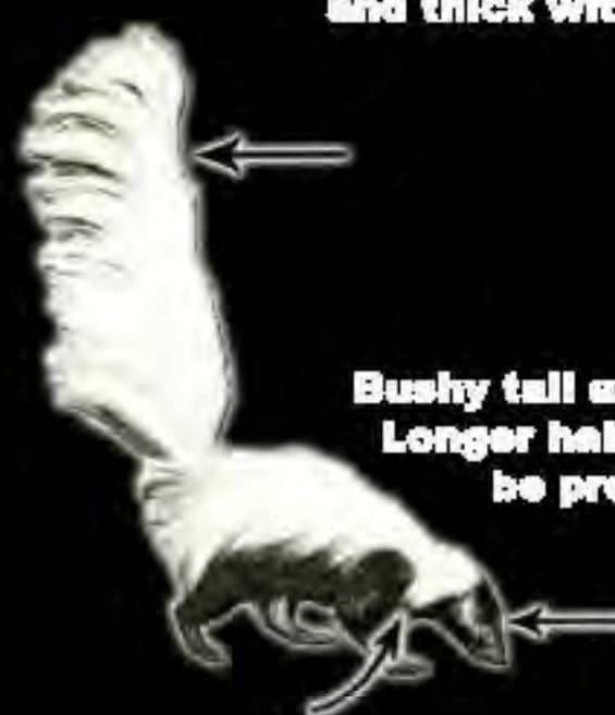
Spotted Skunk ( Spilogale gracilis )

Bushy tail exceeds body length. Body has variable color patterns. Longer hair behind head creates a "hood." White markings may be present on face, but do not connect to body stripe.