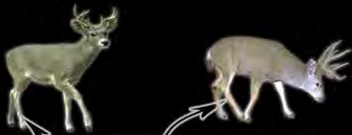
Figure C White-tailed vs. Mule Deer Metatarsal Glands

Tail is long with a distinct black stripe that extends from the back down to the tip of the tail. Ears have black tips and black halo around the edges.