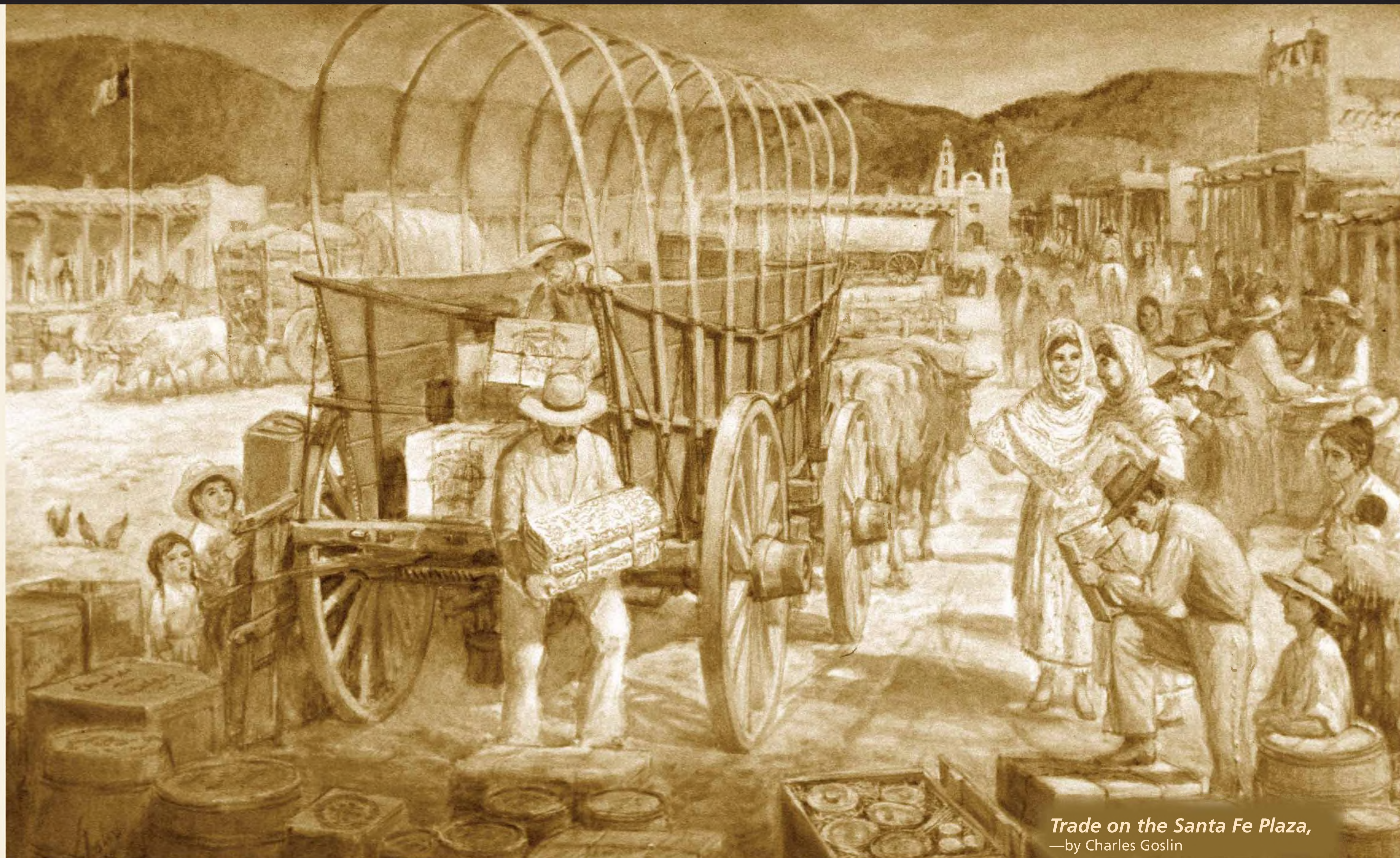
Trade on the Santa Fe Plaza, —by Charles Goslin

For 60 years, the trail was one thread in a web of international trade routes. It influenced economies as far away as New York and London. The 1865 close of the Civil War released America's industrial energies and stimulated the push to develop railroads westward. Railroad expansion gradually shortened the Santa Fe Trail—finally replacing it in 1880.