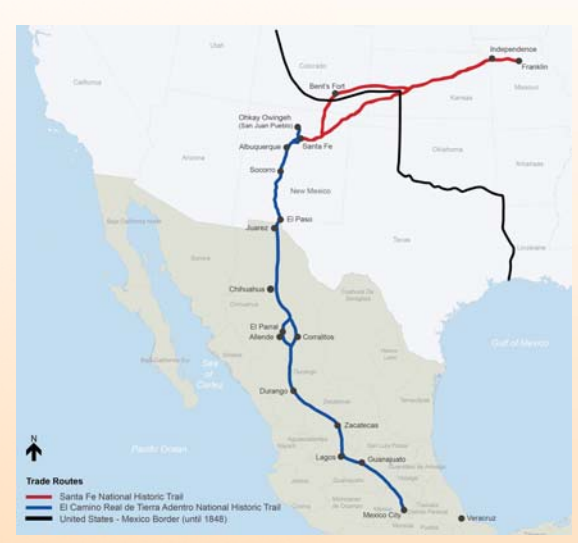
The Santa Fe Trail and El Camino Real de Tierra Adentro formed an international route of commerce used between 1821 and 1880.