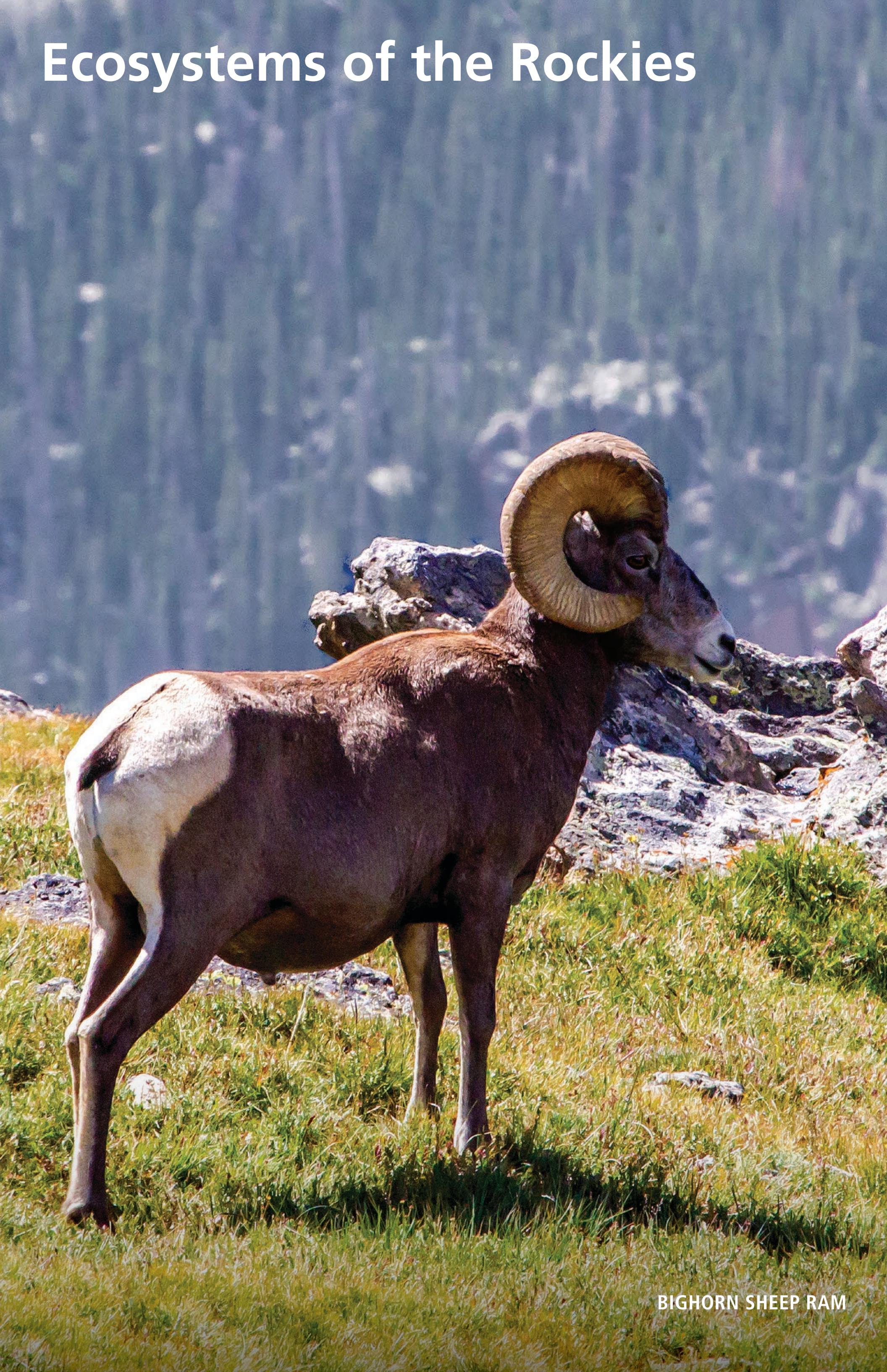
BIGHORN SHEEP RAM