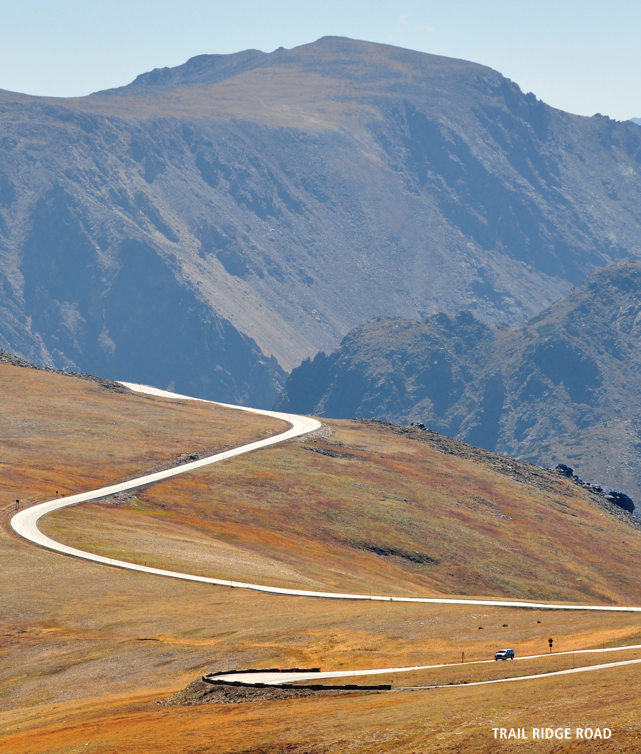
TRAIL RIDGE ROAD

For More Information Rocky Mountain National Park