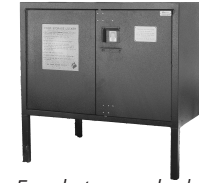
Food storage locker

If your campsite has a food storage locker, you are required to use it.