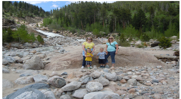
17 foot tall 425 ton boulder after the September 2013 Flood.