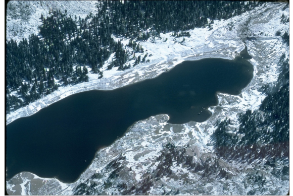
Lawn Lake Before Dam Break

The flood on July 15, 1982 was the result of the collapse of two dams in the Estes Park valley. The flooding began with the failure of the Lawn Lake dam at 5:30 a.m., releasing 219,623,574 gallons of water. The flood waters from Lawn Lake caused the destruction of the Cascade Lake Dam 6.7 miles below Lawn Lake dam releasing another 3,912,000 gallons of water into the Estes Park valley. The surge of water then coursed down the Big Thompson River until a debris dam caused the waters to follow the roadbed through downtown Estes Park. Only when the floodwaters had reached the Olympus Dam in Estes Park, three hours and forty minutes after the Lawn Lake Dam failure, were they contained. The flood left three people dead, eighteen bridges damaged, 177 Estes Park businesses inundated with three to four feet of water and one to two feet of mud, and 108 private homes damaged. Damage estimates were $31 million.