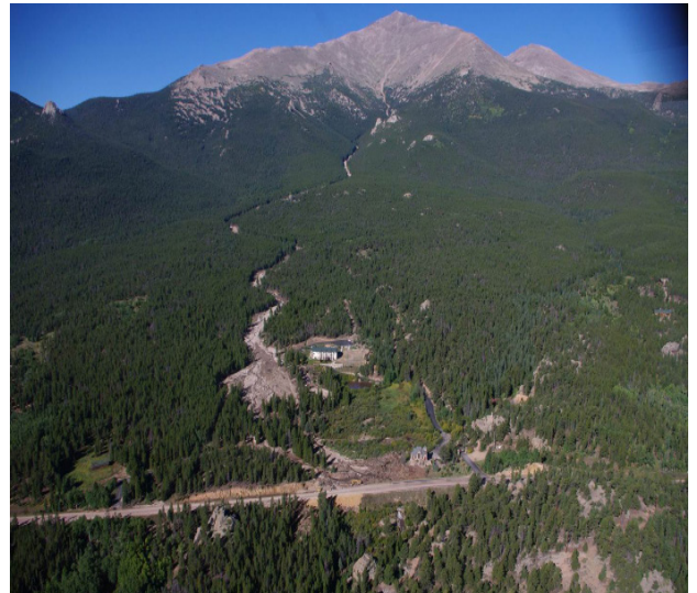
Debris Flow on Mount Meeker

Another notable factor from this storm and flood event is the number of debris flows recorded. Scientists define a debris flow as “a moving mass of loose mud, sand, soil, rock, water and air that travels down a slope under the influence of gravity. To be considered a debris flow, the moving material must be loose and capable of “flow,” and at least 50% of the material must be sand-size particles or larger.” Once scientists were able to get into helicopters and start looking at the Front Range, they recorded over 1,000 debris flows, some small and others huge. One of the larger flows occurred on Mount Meeker, located in Rocky Mountain National Park, with a straight-line length of 2.39 miles. Another large debris flow on West Twin Sister, also located in Rocky Mountain National Park, had an estimated straight-line length of 1.02 miles. A two meter (six feet) thick debris flow also covered the streets of Jamestown, while the building at 100 Arapaho Ave in Boulder was cut in half by a debris flow. Estimates of the rate some debris flows moved show boulders six feet in diameter moving at speeds of 20-30 miles per hour. Plotting these debris flows on a map shows south facing slopes along the Front Range were more susceptible to debris flows. This is not unusual, considering that south facing slopes tend to be warmer with less vegetation covering them and fewer roots to help stabilize the soil.