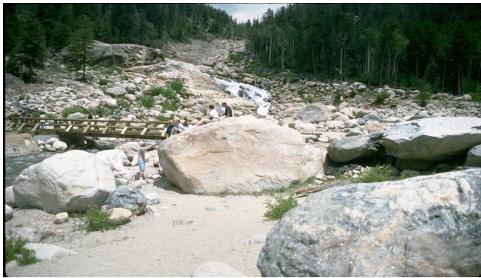
17 foot tall 425 ton boulder deposited during the Lawn Lake Flood.

In the wake of the flood, Colorado residents learned that the state had not been inspecting dams in a timely manner. The 1982 inspection of the Bluebird Dam, Pear Lake Dam, and Sand Beach Dam were found by inspectors to be seriously deficient and posing a hazard to residents living below them. While all three dams were located in the high elevations of Rocky Mountain National Park their upkeep was the responsibility of the City of Longmont, the dams' owner. After a review, the City of Longmont determined the dams were no longer necessary for irrigation purposes because of the creation of the Buttonrock Reservoir. It would take until 1987 for Rocky Mountain National Park to purchase the rights to all three dams at the cost of $3,926,794.89 (in 2014 monies). From 1989 to 1990 park staff removed all three dams in compliance with regulations concerning the protection of the threatened greenbacked cutthroat trout and protection of plants and animals in the alpine tundra. Even though the Bluebird Dam was considered to be historically significant, since it was the first high-altitude reinforced concrete dam, the potential for loss of life and property was considered of greater importance. The dam was thoroughly photographed and documented before the removal process began and later an interpretive sign was built to inform visitors of the dam's existence.