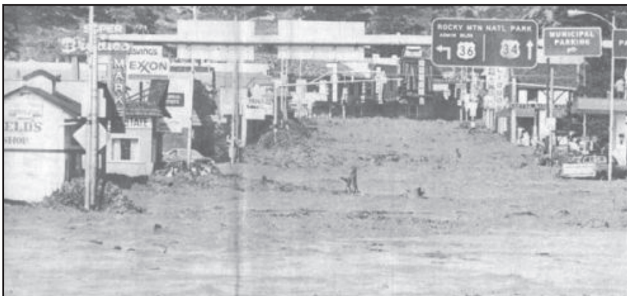
Downtown Estes Park inundated by floodwaters from the failure of the Lawn Lake dam in 1982.

The Wilderness movement during this time prompted RMNP to seek a Wilderness designation under the Wilderness Act of 1964. After many years, RMNP created several Wilderness areas within its boundaries, leading the park to be over 90% designated Wilderness by 2009.