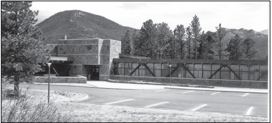
Beaver Meadows Visitor Center (BMVC) in 1967. BMVC was designed by architects mentored by famous Mid-century Modern architect Frank Lloyd Wright.

In 1963, a document was published by the National Park Service titled “Wildlife Management in the National Parks”, more commonly known as the Leopold Report. This document envisioned national parks as “vignettes of primitive America” where scientists could study plants and animals in a non-developed state.