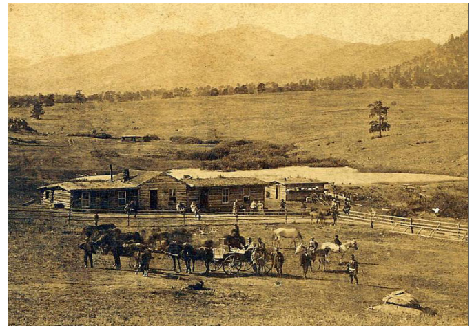
The Griff Evans Ranch with Longs Peak in the distance.