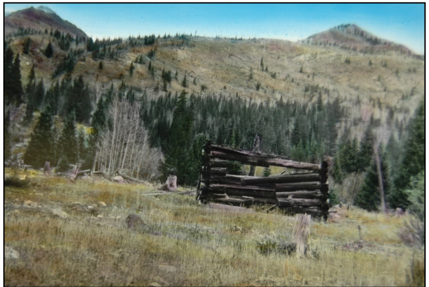
The remnant of a log cabin at Lulu City circa 1930.