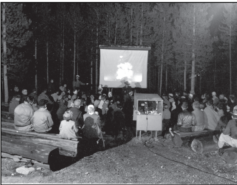
Visitors enjoy a ranger talk in Glacier Basin Campground in 1956.

RMNP also saw a change in the way visitors wanted to experience the area after World War II. Before cars had become common, people visiting Estes Park, Grand Lake, and RMNP would spend weeks in the area. They would spend the summer at the Stanley Hotel or roughing it in cabins or tents. As cars became more affordable and roads easier to navigate, many people came for day adventures, often driving over Trail Ridge Road or visiting the Hidden Valley Winter Recreation Area which was in operation until the 1990s. The new RMNP visitor often had specialized equipment for their activities whether that be camping, backpacking, hiking, skiing, etc.