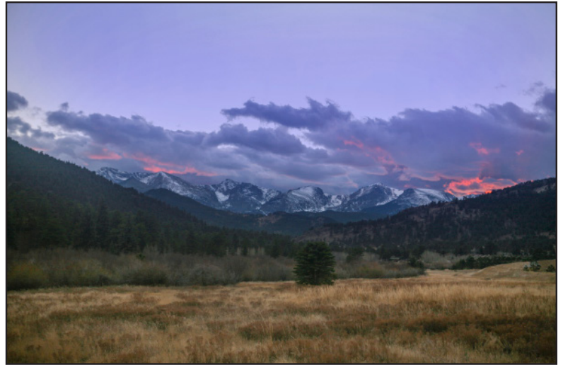
The snowcapped Continental Divide has lured humans to the Estes Valley for centuries.

Today, Rocky Mountain National Park (RMNP) spans 415 square miles of lands that hold some of America's most beautiful scenery. This land was formed from geologic forces and is well known for sweeping mountain ranges and a variety of flora and fauna. While these lands may have been shaped by natural forces first, they have been shaped in the human mind by a series of behaviors and ideas going back thousands of years. The human history of RMNP has shaped it as much as a glacier or a flood. The choices that humans have made over time have contributed to the RMNP we know today in sometimes surprising ways.