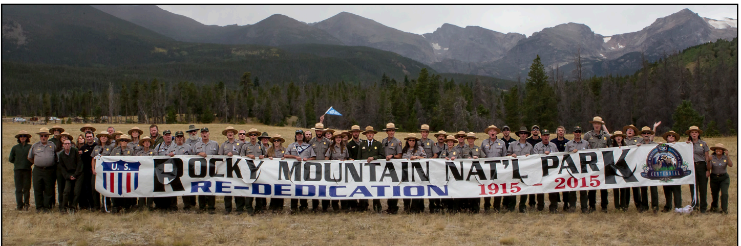
Park rangers gather in Horseshoe Park on September 4, 2015 to celebrate the 100 year Anniversary of Rocky Mountain National Park.

In 2015, RMNP celebrated its 100th Anniversary with special programs and events. In 2016, the National Park Service celebrated its 100th Anniversary nation-wide. These two events mark the start of the next century of human history on this landscape. Ideas will shift and change as they always have, and every visitor to a national park can be a part of making that future by protecting and learning about its history.