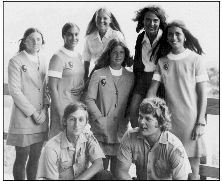
A group of park rangers and ranger-naturalists circa 1960.

the creek bed of the Roaring River, carrying large boulders and debris quickly towards Horseshoe Park and then continued on towards Estes Park. A park employee called in the emergency which allowed the evacuation of the Aspenglen Campground, Estes Park, and the Big Thompson canyon. Due to the quick response time, many lives were saved, though three lives were lost. Many of the businesses and homes in Estes Park nearby the river were damaged and it led to a rebuild of the town that would make it even more appealing to tourists. Similar events happened in a 2013 flood, which was caused by an excess of rain over a short period of time.