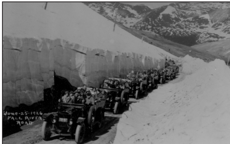
Automobiles are dwarfed by snowdrifts as they drive over Fall River Road in June of 1926.

There were many notable park rangers, both men and women, who worked in RMNP and helped shape it into the special place it is today. With their passion for the job and their values regarding the environment and history, they still inspire today's rangers and visitors. The focus of the first few decades of RMNP was supporting recreation and maintaining these opportunities. Operations such as the Deer Ridge Chalet selling curios at the junction of US 34 and US 36 were a norm. Stead's Ranch sported a golf course and swimming pool in the heart of Moraine Park. A winter recreation area complete with short lifts and a bus taking skiers up Trail Ridge Road sprung up in Hidden Valley, in an attempt to drive revenue into the Estes Park area.