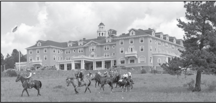
The Stanley Hotel cost over a half-million dollars to build. Early guests who stayed at the hotel included J.C. Penney, Harvey Firestone, and Theodore Roosevelt.