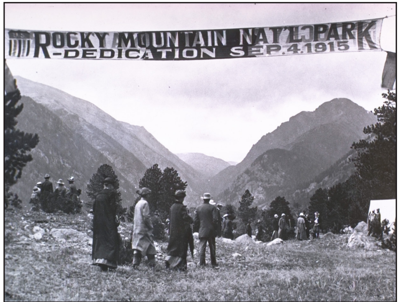
Eager visitors gather for the dedication ceremony in Horseshoe Park.