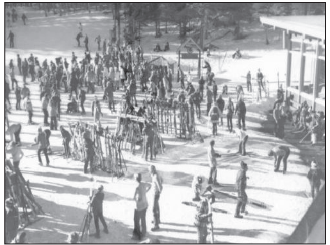
Hidden Valley was the only ski area with easy access from northern cities along the Front Range and was very popular with locals.

The start of World War II brought big changes to RMNP. Many park rangers at the time were young men who were eligible to serve in the military. Across the country, national parks quieted and fell into disrepair as park rangers left to become soldiers and tourists stayed home due to rationing. However, when the war ended, visitors came back to the national parks in numbers never before seen. The visitors in the 1940s and 1950s found an unprepared RMNP. During the Great Depression many private land owners had sold their lands to the park, and the remaining dude ranch and lodge owners did not have the space to accommodate waves of new arrivals. The NPS was still functioning on the reduced budget levels of World War II, and Congress had not allocated additional funds.