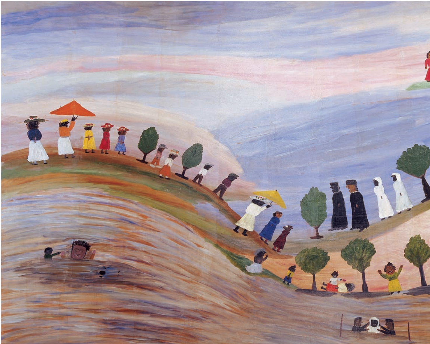
CANE RIVER NATIONAL HERITAGE AREA, ART: CLEMENTINE HUNTER, AFRICAN HOUSE MURAL, MELROSE PLANTATION; PHOTO: JAMES ROSENTHAL (HISTORIC AMERICAN BUILDINGS SURVEY)

What We Envision The National Park System Advisory Board envisions a future in which the National Park Service welcomes National Heritage Areas for their role in expanding the conservation stewardship of nationally important historic resources, landscapes, and cultures; redefining how traditional and contemporary cultures tell their stories; and enhancing understanding of partnership and heritage development, so that the full scope of the American experience is revealed. This new future should be built on a legislative foundation that frames and supports the value of this approach.