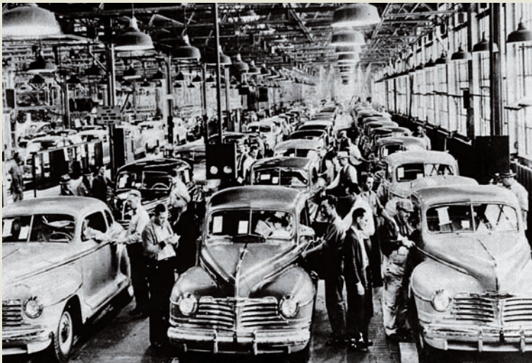
THE HENRY FORD