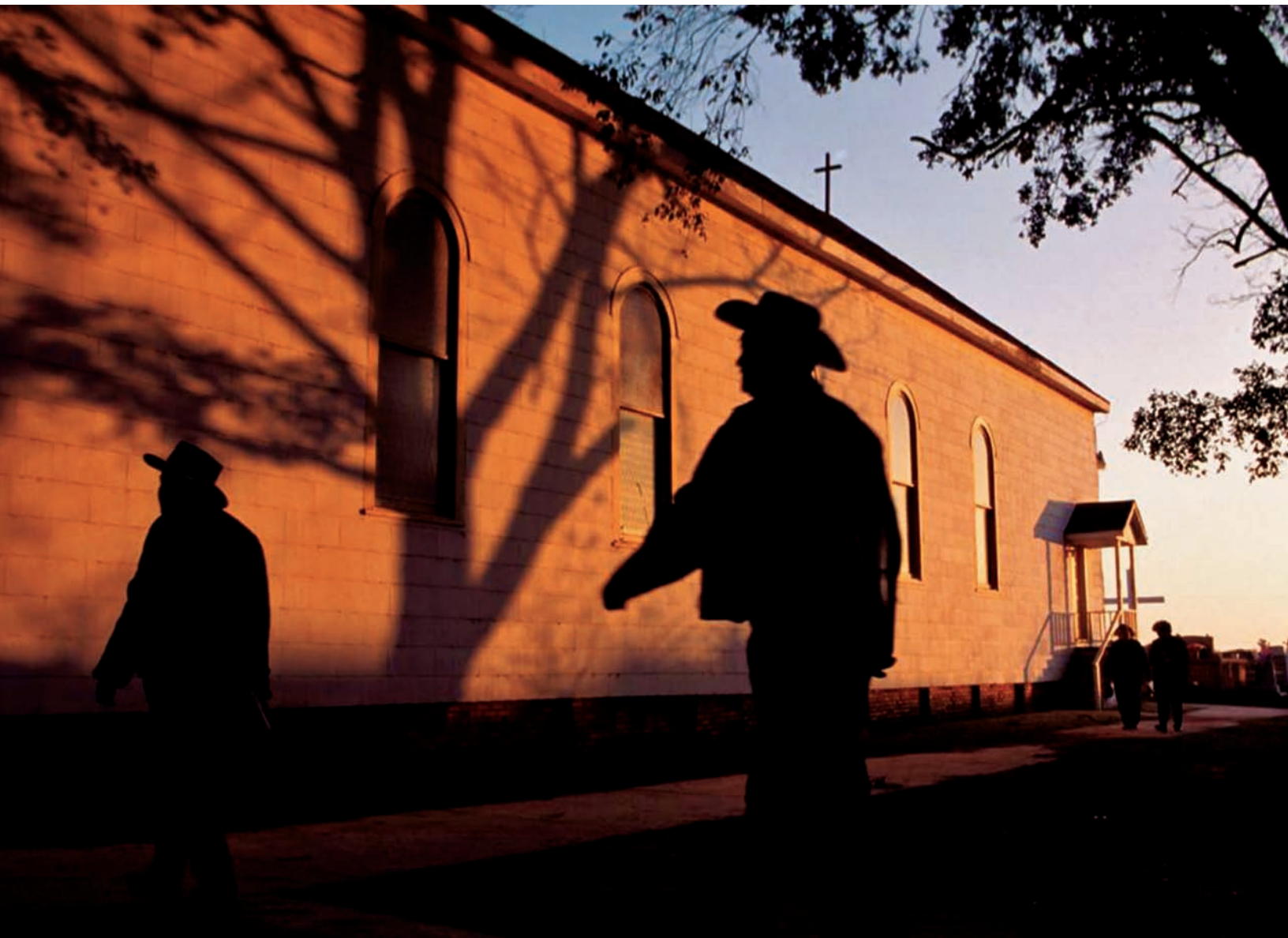
CANE RIVER NATIONAL HERITAGE AREA, PHILIP GOULD

National Heritage Areas knit together the whole landscape and provide an integrated approach to conserving the natural, cultural, historic and scenic resources that define sense of place and shared heritage values, and encourage compatible economic growth.