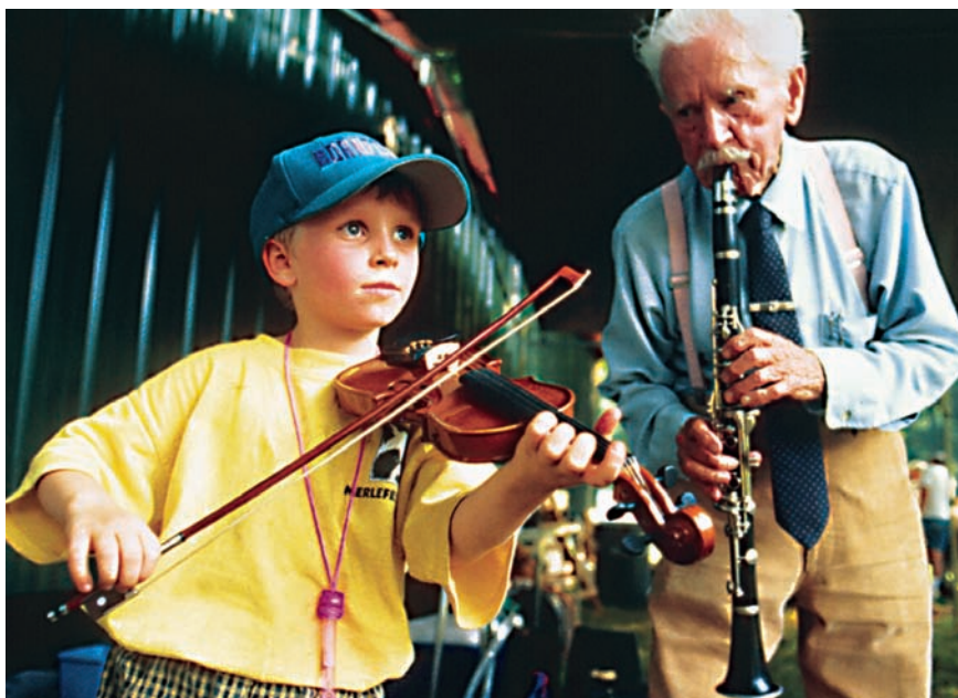
BLUE RIDGE NATIONAL HERITAGE AREA, CEDRIC CHATTERLY

Each National Heritage Area is unique and needs legislative authority specifically tailored to meet the needs of its region and its resources.