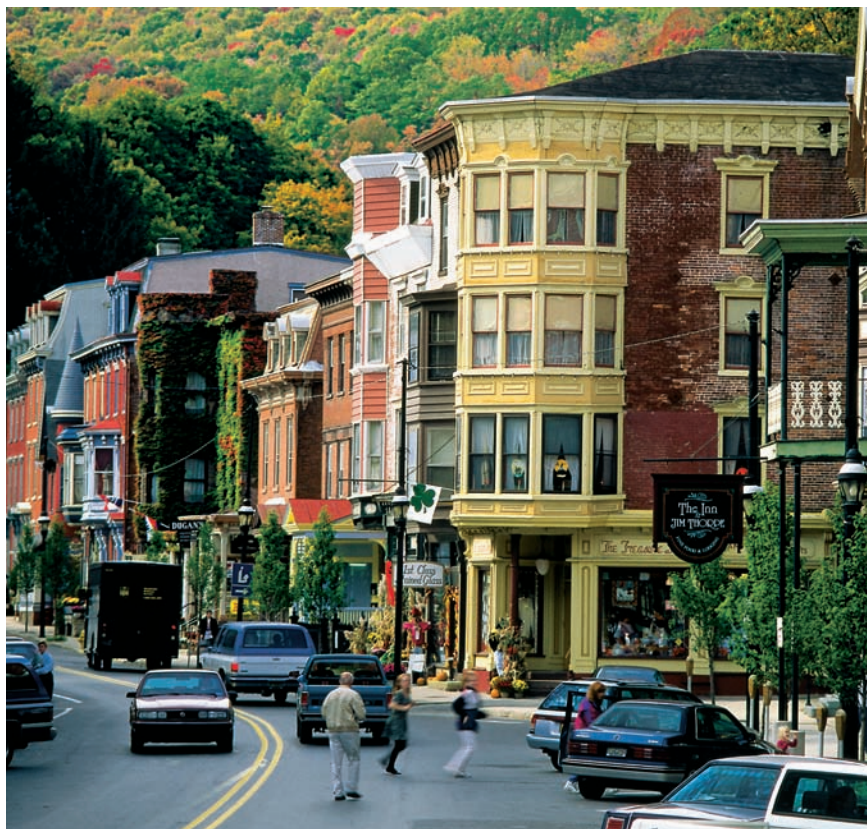
DELAWARE & LEHIGH NATIONAL HERITAGE CORRIDOR