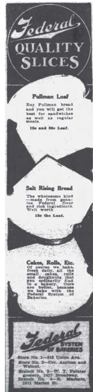
Figure App.C.1. Knoxville Journal and Tribune, Oct. 22, 1920, p. 10.

Take for example, car 2293, a general service parlor car built in 1898. 208 Built to plan 1278a, these six cars used ash, birch, maple, oak, and three types of pine plus mahogany, primavera (AKA 'white mahogany'), satinwood, and vermilion in the body, and then 18 different veneers to adorn the interior. Then many dozens of individual castings and forgings, most made at Pullman, outfitted the interior and underbody; something like 6,000 bolts and screws and 3,900 lbs. of glue held them all together; and over 160 itemized trimming items—from pull cords, water coolers and faucets, to springs, lifts, latches, locks and pulls—were added to each car (the inventories sometimes lead to curious rabbit holes: what, for example, was 4,400 ft. of 'Okonite' cable for electrical wiring [still in business!]). From these docket, one could investigate how the running trucks were built, the steam heating plant and distribution, plumbing and electrical systems, and glass, paint, and upholstery came together to make the opulent hotel on wheels that everyone wanted to ride. Finally, one can see breakdown by department of the $23,500 labor costs that went into these six cars, for which Pullman charged a total of $86,000 (For purposes of comparison, when Charles M. Schwab ordered a single steel private car in 1916, it cost