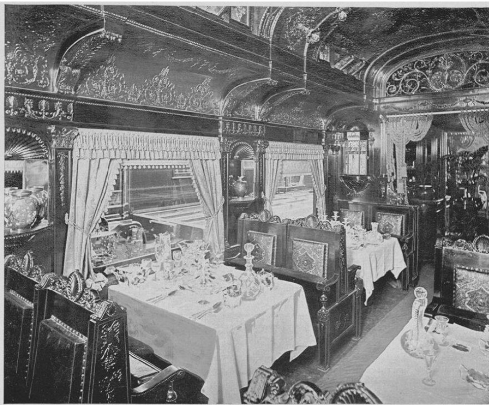
Figure App.C.2. Pullman dining-car La Rabida . ( Bancroft, 1893, p. 552 )

First is the baggage and smoking car Marchena , with bath-room, barber's shop, writing-desk and library. Next is the dining-car La Rabida , finished in the finest of vermillion wood imported from Central America, with windows of stained glass in delicate hues, seats elaborately carved, and kitchen which is a model of cleanliness and condensation of space. There are the sleeping car America and the compartment sleeping car Ferdinand , both marvels of comfort and decorative skill, the latter finished in Pompeiian red, and satin wood, artistically carved and polished to a mirror-like brightness, each of its compartments a miniature boudoir, and with separate design and color scheme, as in ivory and gold, in olive green, in blue and satin wood, all with upholstery of silk brocade. The last is an observation car, named Isabella , a portion of which is furnished as a drawing-room, with large railed platform at its end. In this train it would almost seem that the perfection of comfort and convenience had been attained, many skilful [ sic ] devices, though small in themselves, contributing to the general effect. All the compartments are provided with toilet appliances, and with water, hot, cold, and iced. The electric lights are shaded with silken fringe; the entrance ways paved with mosaic, and vases placed on