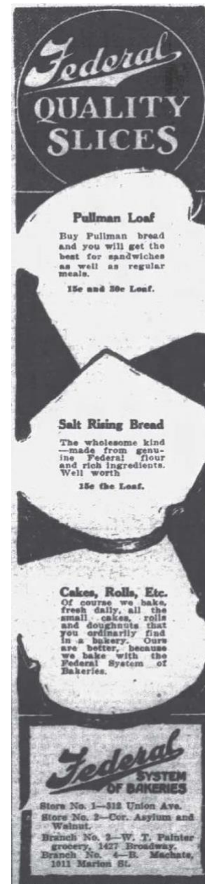
Figure App.C.1. Knoxville Journal and Tribune, Oct. 22, 1920, p. 10.

Take for example, car 2293, a general service parlor car built in 1898. 208 Built to plan 1278a, these six cars used ash, birch, maple, oak, and three types of pine plus mahogany, primavera (AKA 'white mahogany'), satinwood, and vermilion in the body, and then 18 different veneers to adorn the interior. Then many dozens of individual castings and forgings, most made at Pullman, outfitted the interior and underbody; something like 6,000 bolts and screws and 3,900 lbs. of glue held them all together; and over 160 itemized trimming items—from pull cords, water coolers and faucets, to springs, lifts, latches, locks and pulls—were added to each car (the inventories sometimes lead to curious rabbit holes: what, for example, was 4,400 ft. of 'Okonite' cable for electrical wiring [still in business!]). From these docket, one could investigate how the running trucks were built, the steam heating plant and distribution, plumbing and electrical systems, and glass, paint, and upholstery came together to make the opulent hotel on wheels that everyone wanted to ride. Finally, one can see breakdown by department of the $23,500 labor costs that went into these six cars, for which Pullman charged a total of $86,000 (For purposes of comparison, when Charles M. Schwab ordered a single steel private car in 1916, it cost