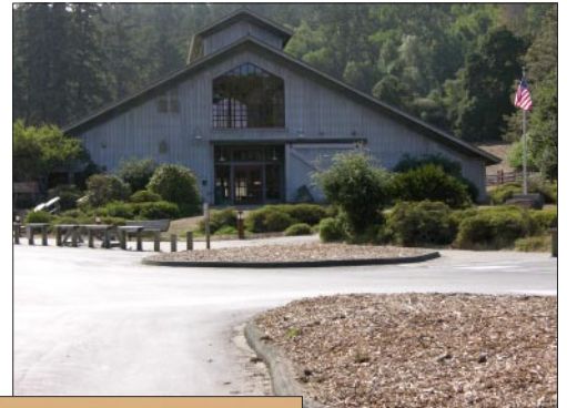
Bear Valley Visitor Center (above) and Limantour Beach

Point Reyes National Seashore is a Climate Friendly Park due to the efforts of reducing waste, implementing sustainable practices and reducing GHG emissions. The park has an