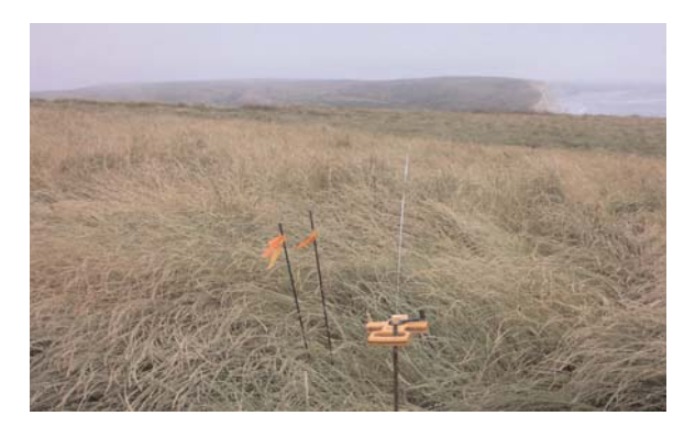
Non-native ryegrass dominates the site.