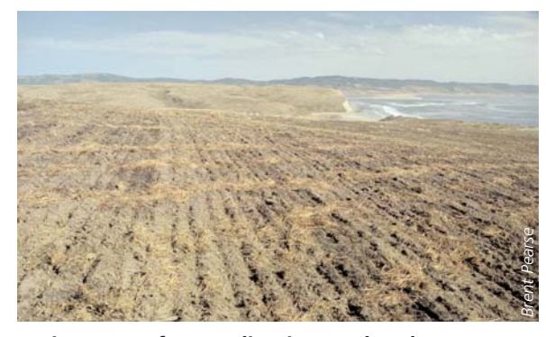
Project area after seeding is completed.