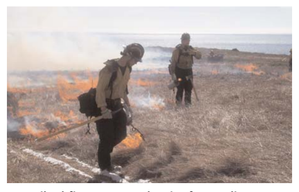
Prescribed fire prepares the site for seeding.

Meanwhile, native grasses are more abundant in some other areas on D-ranch.