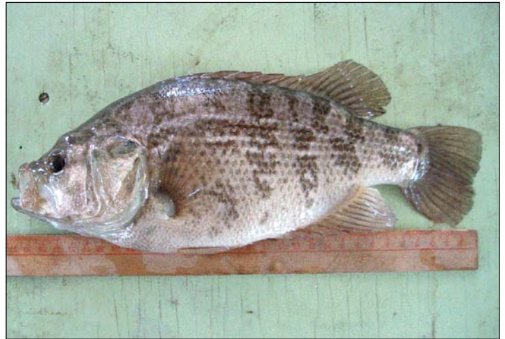
Sacramento Perch populations are waning in their natural, native habitats (due to habitat destruction), but are paradoxically flourishing in habitats into which they have been introduced.

Researchers at the University of California-Davis are using genetics and physiology to develop a successful reintroduction program for Sacramento perch. Analyzing the genetic diversity within and among populations, including that in Abbotts Lagoon, allows us to maximize diversity at reintroduction sites and monitor reintroduced populations to determine the number of reproducing adults. Habitat use will be documented by snorkeling and remote video. Observations will focus on breeding and nest guarding behavior, and movements within and between lagoons. Water quality fluctuations within lagoons will be used to determine the physiological tolerances, behavioral preferences, and habitat use of the species.