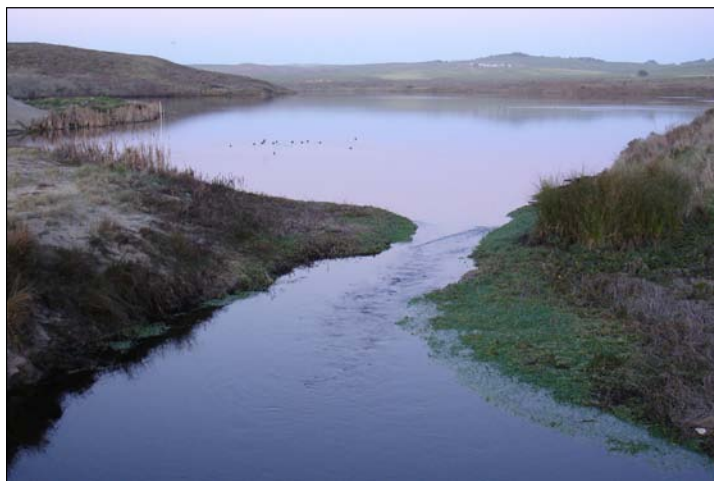
Sacramento perch in Abbotts Lagoon appear to preserve ancestral variation that has not been preserved in other populations.

Preliminary Results: Sacramento perch in Abbotts Lagoon are more genetically diverse than other populations and are genetically distinct from other populations. Initial observations show that these Sacramento perch are behaviorally sophisticated and tolerant of a wide range of conditions.