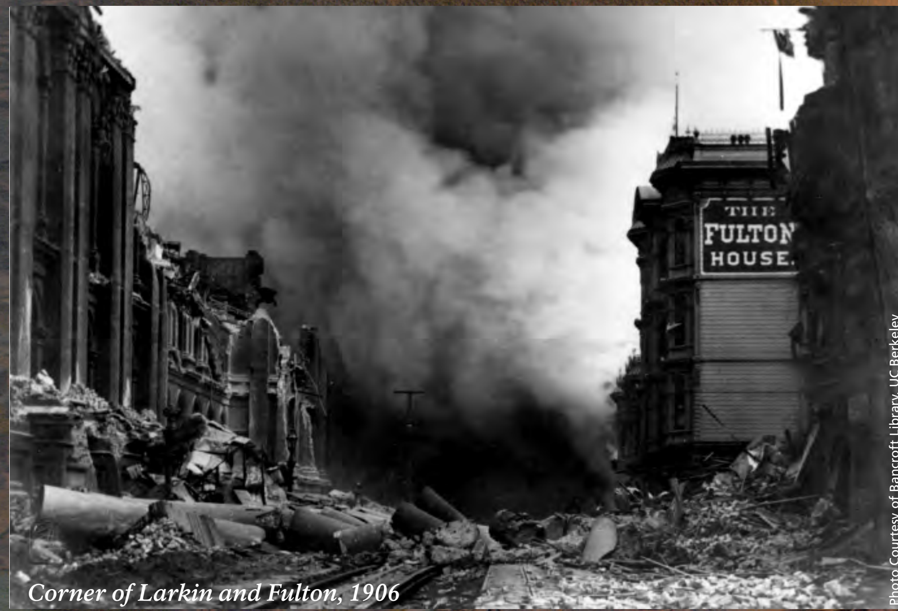
Corner of Larkin and Fulton, 1906

Memories of uncontrollable earthquakes are burned into our minds by the grief and uncertainty left in their wake. As the fault ruptures, violent shaking crumbles buildings, takes lives and rocks the foundations of society.